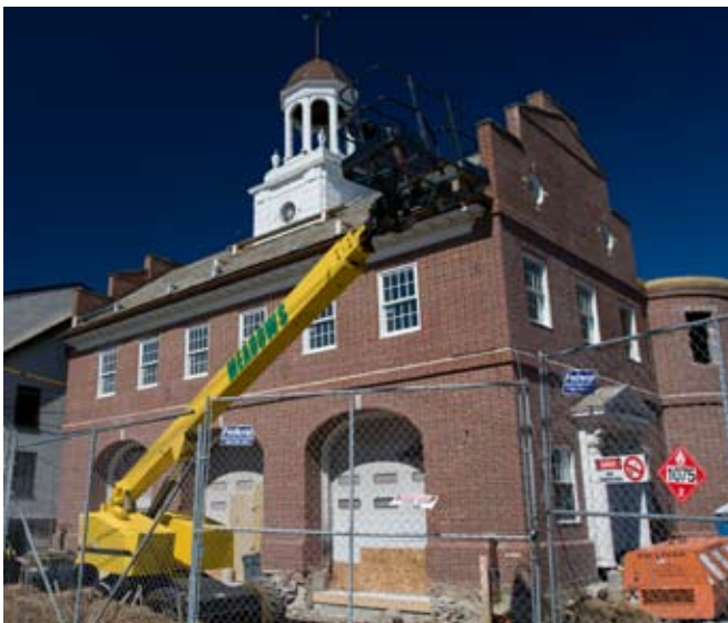
Highland Station construction

In 2010, the Inspectional Services Department issued a total of 4,826 permits of which 1,539 were Building permits, 919 were Plumbing permits, 633 were Gas permits and 1,293 were Wiring permits. Total fees collected by the Inspectional Services Department in 2010 were $882,768.94 with an estimated construction value of $36,602,880