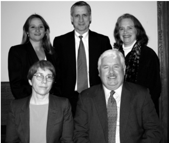
Board of Selectmen