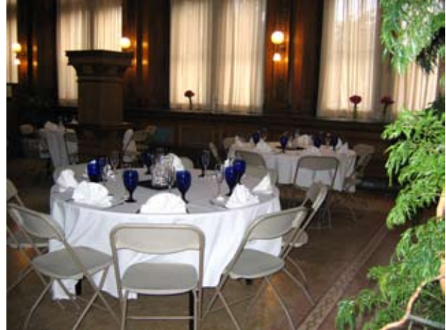
Reading Room Rental

Library staff prepared the children’s monthly and adult quarterly newsletters and the online children’s and business subscription announcements to keep the public aware of services that are available. Other staff activities included: selecting, weeding and updating the