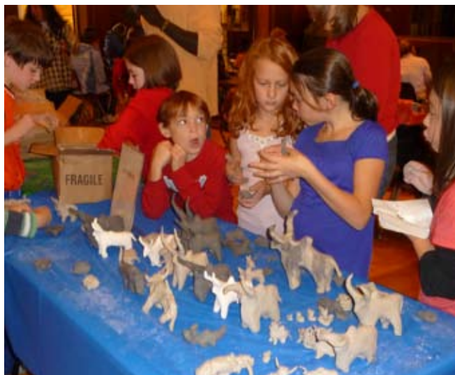
Cow Making at Sudanese Cultural Festival

The Community Room and Conference Room were used by approximately 100 local organizations for a total of 887 meetings. In addition, the two study rooms were in constant demand by students and tutors and the Local History Room received heavy usage by researchers with Independent Research Cards.