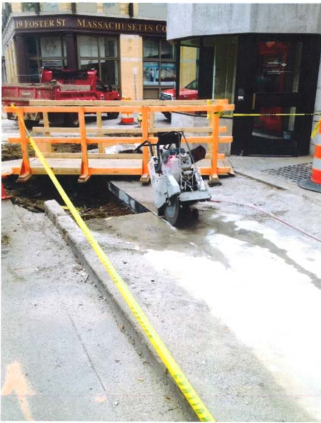
1. Remove sidewalk