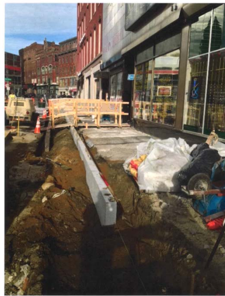
2. Shift curb