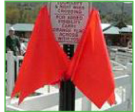
Flags used in the program.

The Mayor of Salt Lake City in 2000, Rocky Anderson, responded to a national study that declared Salt Lake City as “not pedestrian friendly” by creating a Pedestrian Safety Committee aimed at reducing pedestrian injury accidents. The committee implemented several different safety measures, including crosswalk flags and the Adopt-a-Crosswalk Program.