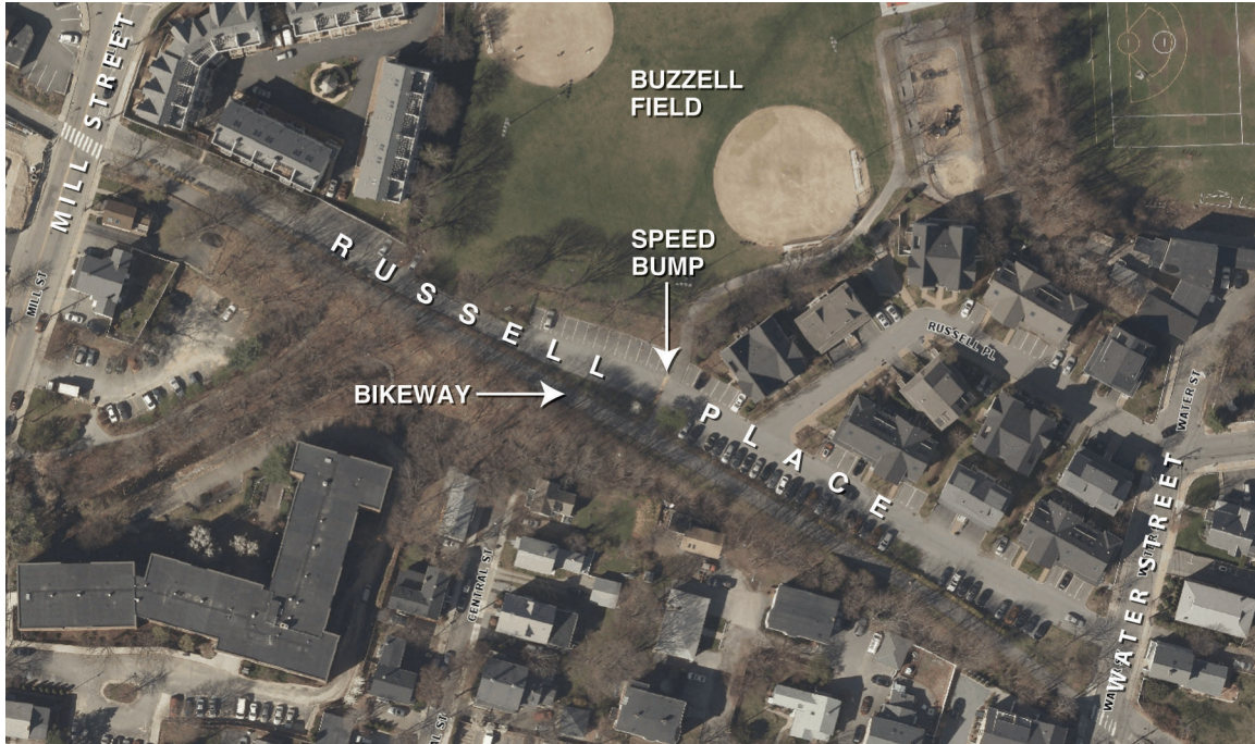
Aerial view of Russell Place.

For the purposes of this report, we will refer to the entire roadway beside the Minuteman Bikeway between Mill and Water Streets as Russell Place. (The actual jurisdictional status is more complex. The Town Engineer has provided documentation of the property boundaries for clarification. See Attachment B.) The roadway provides access to the residences and parking for the Russell Place development and to sticker parking areas. The roadway has a speed bump midway, beside the Bikeway connection to Buzzell Field.