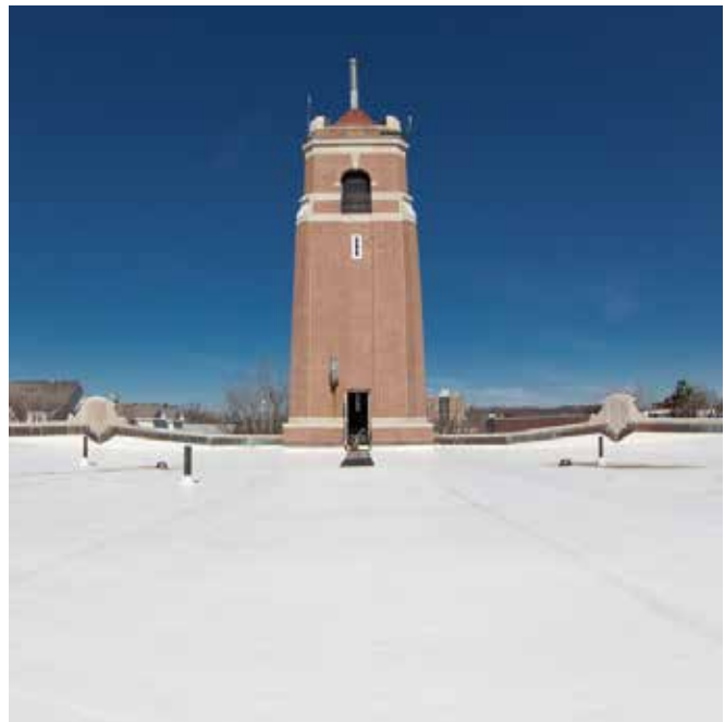
Back roof view of Central Fire Station just prior to renovations.

In 2014 the Inspectional Services Department issued a total of 5,912 permits of which 2,702 were Building permits, 1,149 were Plumbing permits, 840 were Gas permits, and 1,221 were Wiring permits. Total fees collected by the Inspectional Services Department were $1,279,147 with an estimated construction value of $74,833,355.