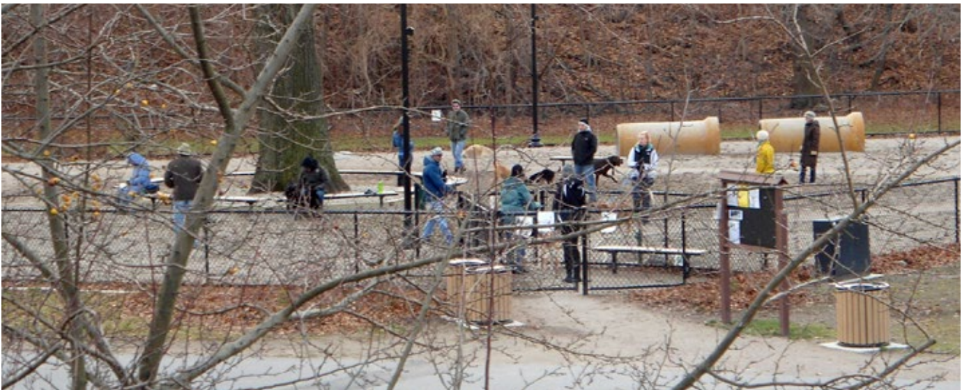
Thorndike Off-leash Recreation Area

Arlington Recreation will continue to offer residents quality recreational programming. It is the goal of the Department to increase and improve program offerings every season. The Department will continue to work with users of the Arlington Sports Center and Town outdoor playing fields to address the increasing needs of the community. Our financial goal is to continue to become increasingly self-supporting through appropriate fee structuring and program and facility management.