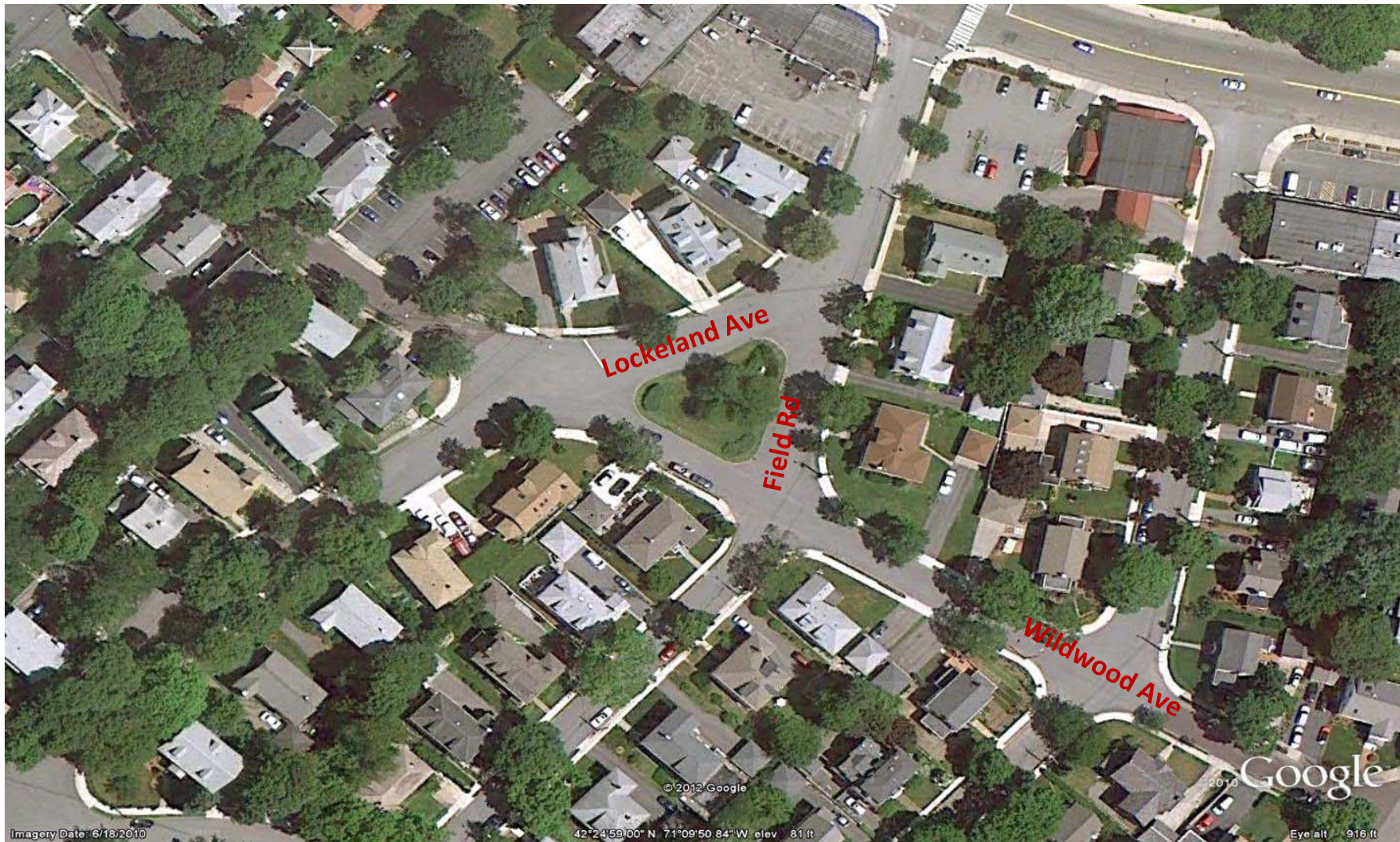
Figure 1: Aerial View of Lockeland Ave and Field Rd at Wildwood Ave