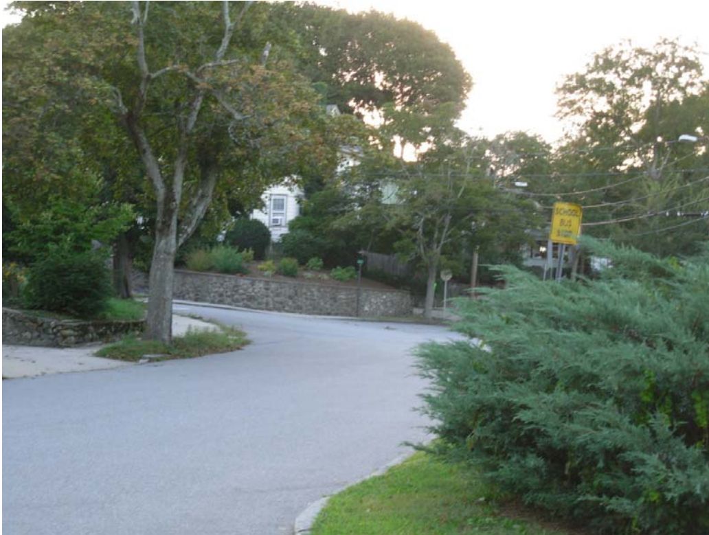
Figure 5: Field Road SB approach to Wildwood Ave. looking west