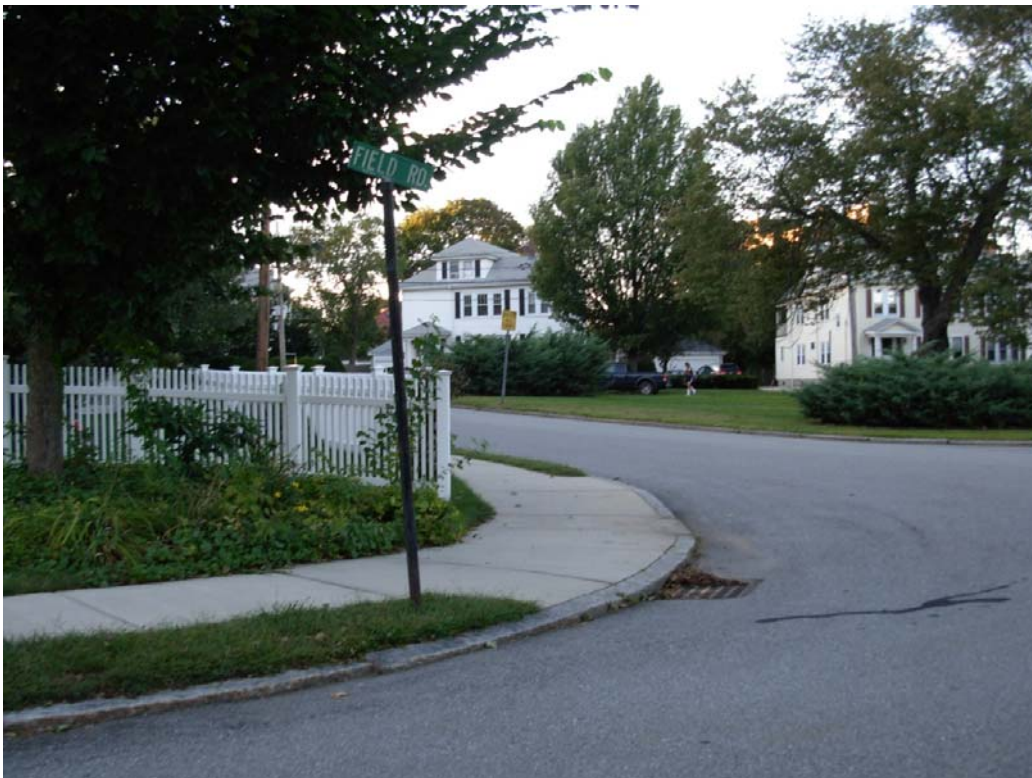
Figure 6: Field Road NB Approach to Wildwood Ave. looking west