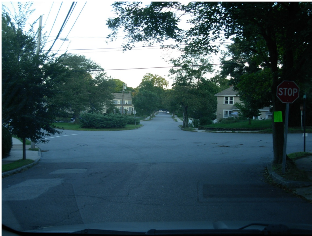
Figure 4: Wildwood Ave. EB Approach to Lockeland Ave.