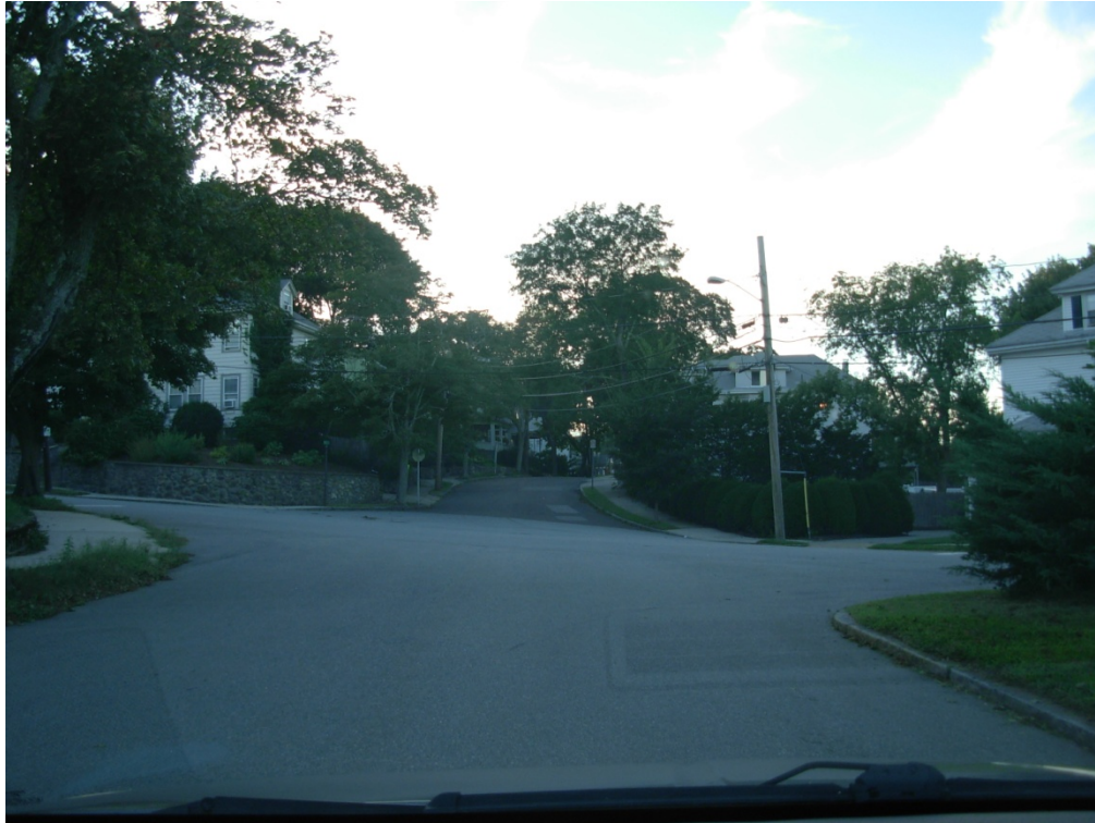
Figure 3: Wildwood Ave. WB Approach to Lockeland Ave.