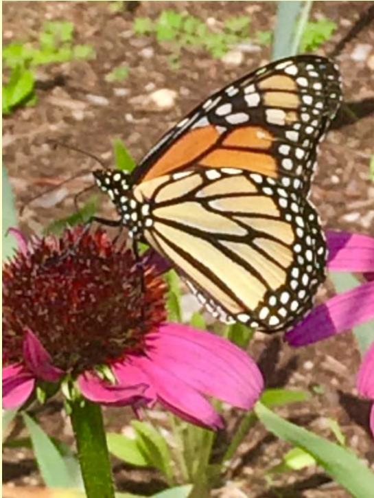
Monarch feeding on Coneflower nectar Arlington

Monarch butterflies are an important pollinator but their populations are at risk. Here are several ways to help them thrive.