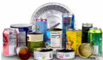
Food and Beverage Cans (empty and rinse)