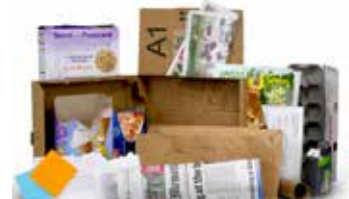
Mixed Paper, Newspaper, Magazines, Boxes