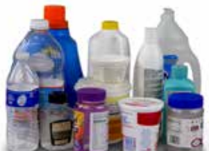
Bottles, Jars, Jugs, and Tubs (empty & replace cap)