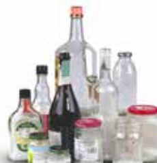
Bottles and Jars (empty and rinse)