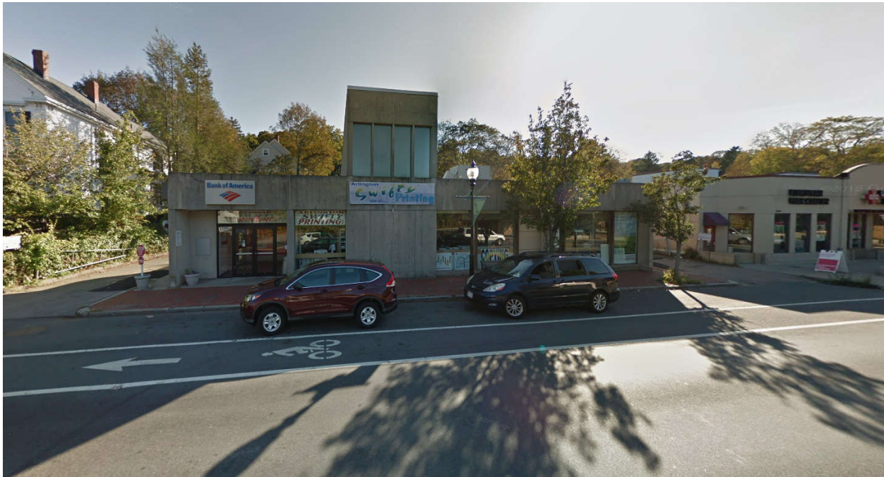
Figure 1 – 1386 Massachusetts Avenue, Arlington, MA

The existing 2,184 ± square foot (sf.) building at 1386 Massachusetts Avenue is occupied by Arlington Swift Printing , a copy, printing and shipping store. The Applicant proposes to convert the facility into a medical and adult-use marijuana dispensary within the existing footprint.