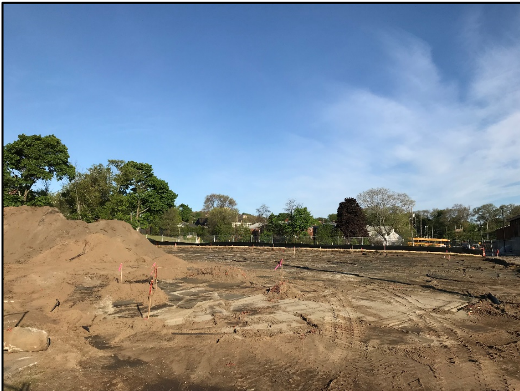
Photograph 4: West Parking Lot