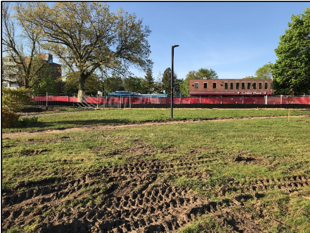
Photograph 2: Mass Ave Front Lawn (memorials have been removed and put in storage)