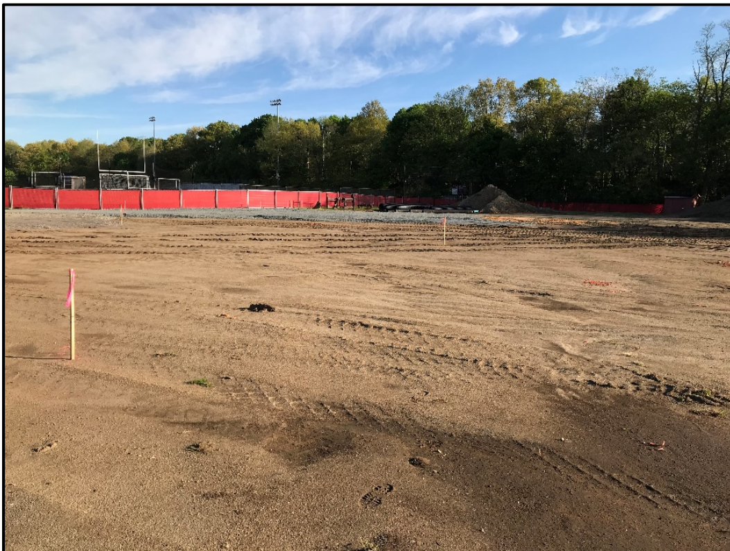
Photograph 6: Rear Parking Lot