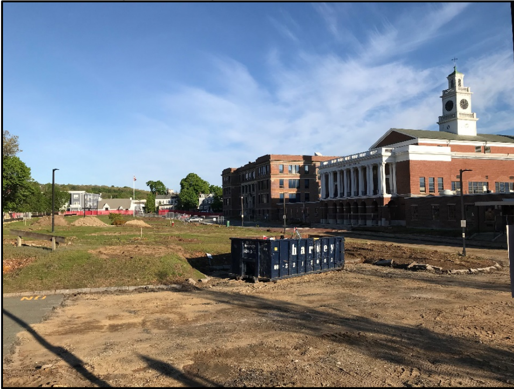
Photograph 1: Mass Ave Front Lawn