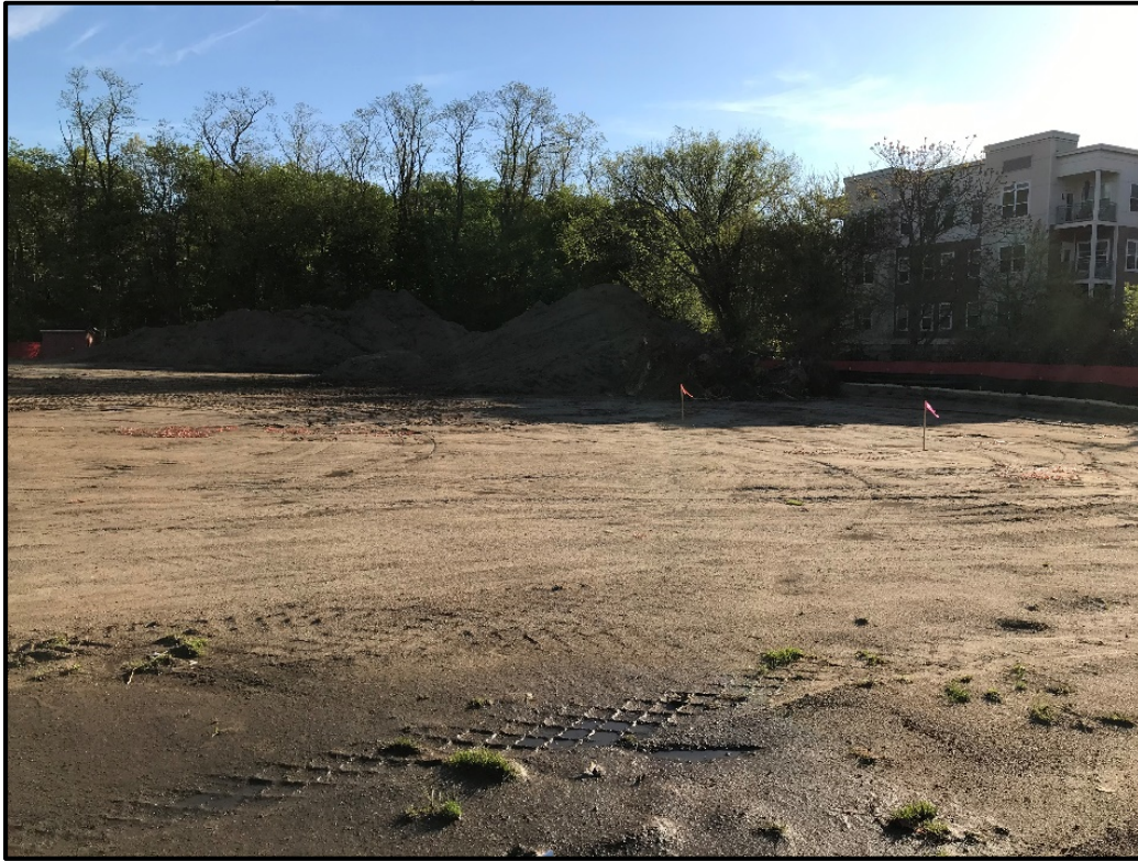
Photograph 5: Rear Parking Lot