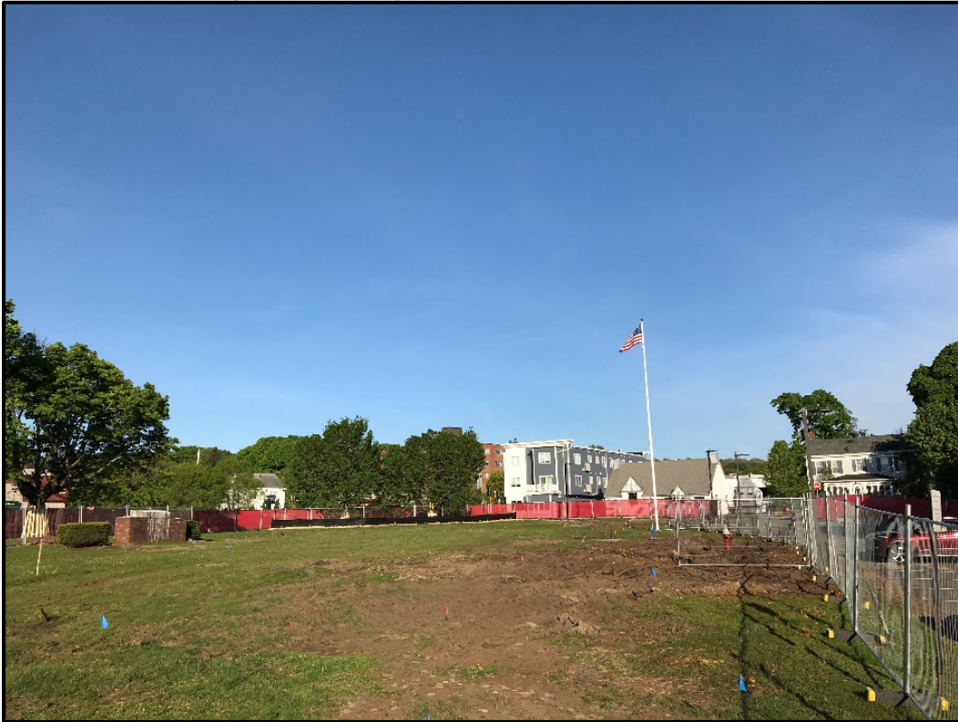
Photograph 3: Mass Ave Front Lawn