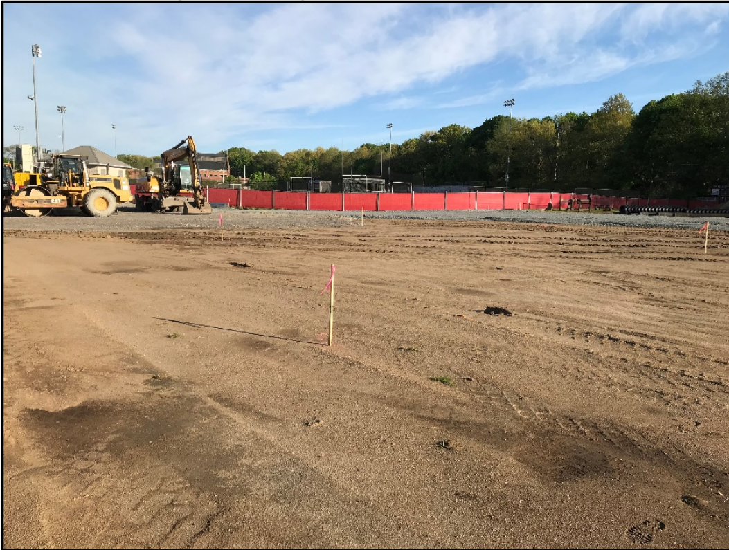
Photograph 7: Rear Parking Lot