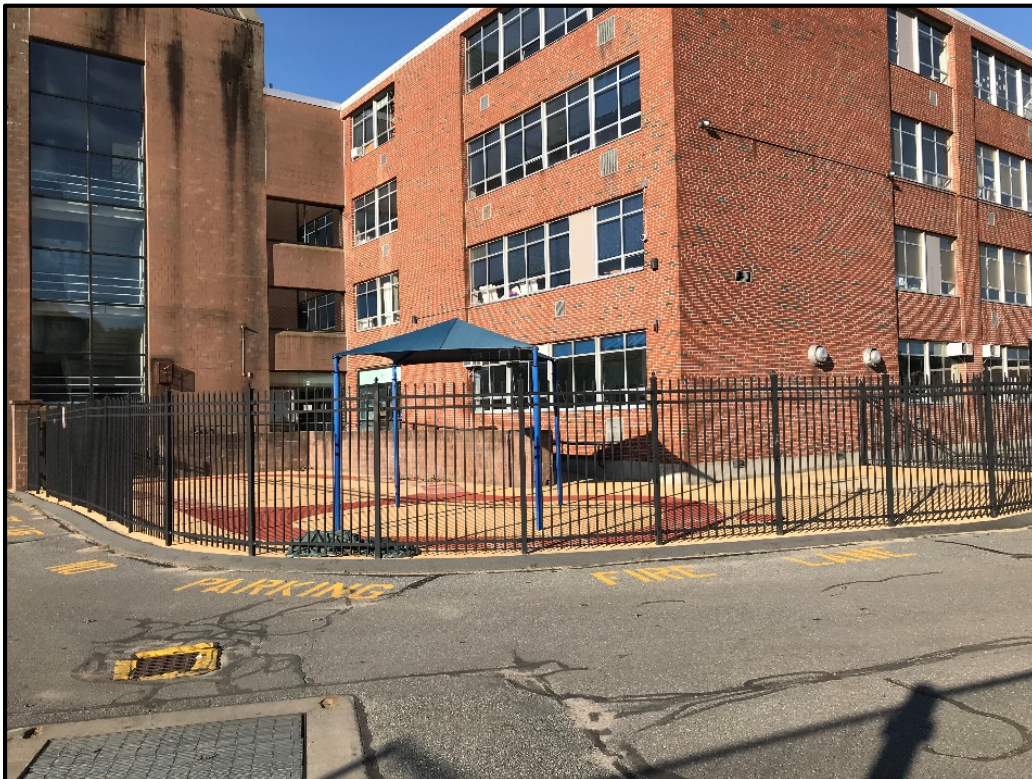
Photograph 8: Playground at Rear