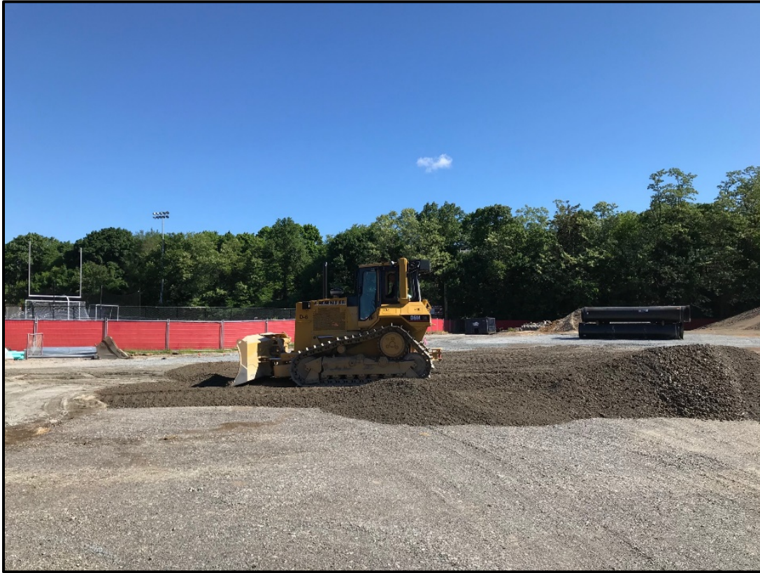
Photograph 5: Current softball field/Future Contractor lay down area– Bulldozer Preparing for Paving