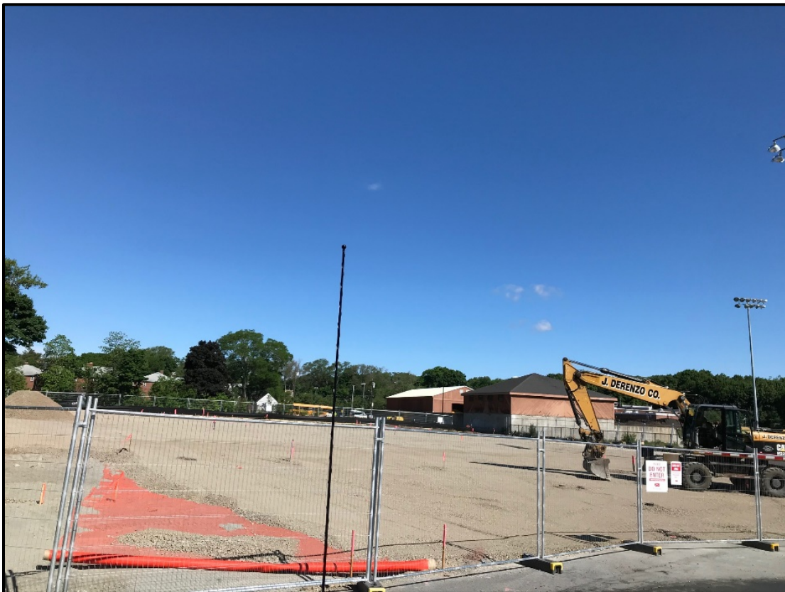
Photograph 4: West Parking Lot Prepped and Ready for Paving