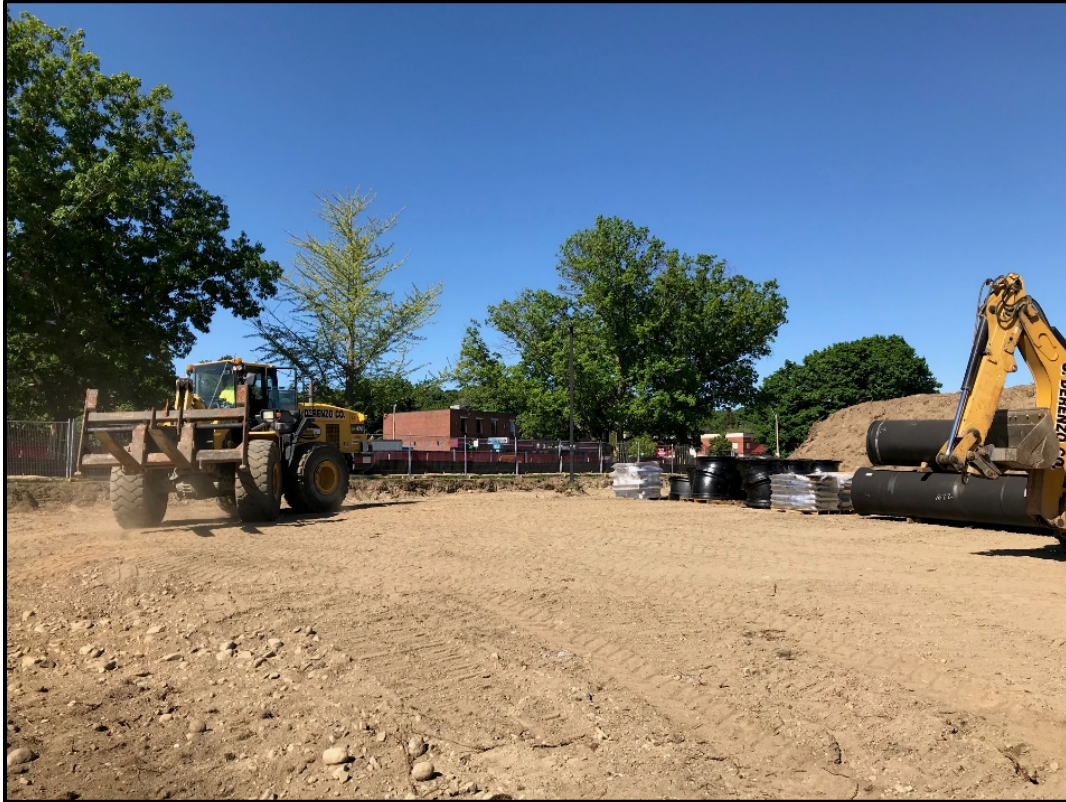
Photograph 1: Mass Ave Front Lawn - Sitework