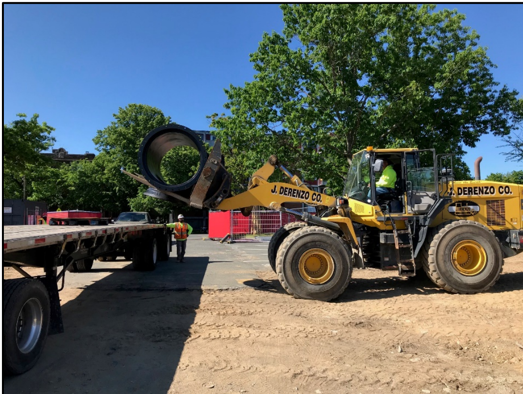
Photograph 2: Mass Ave Front Lawn – Pipe Delivery