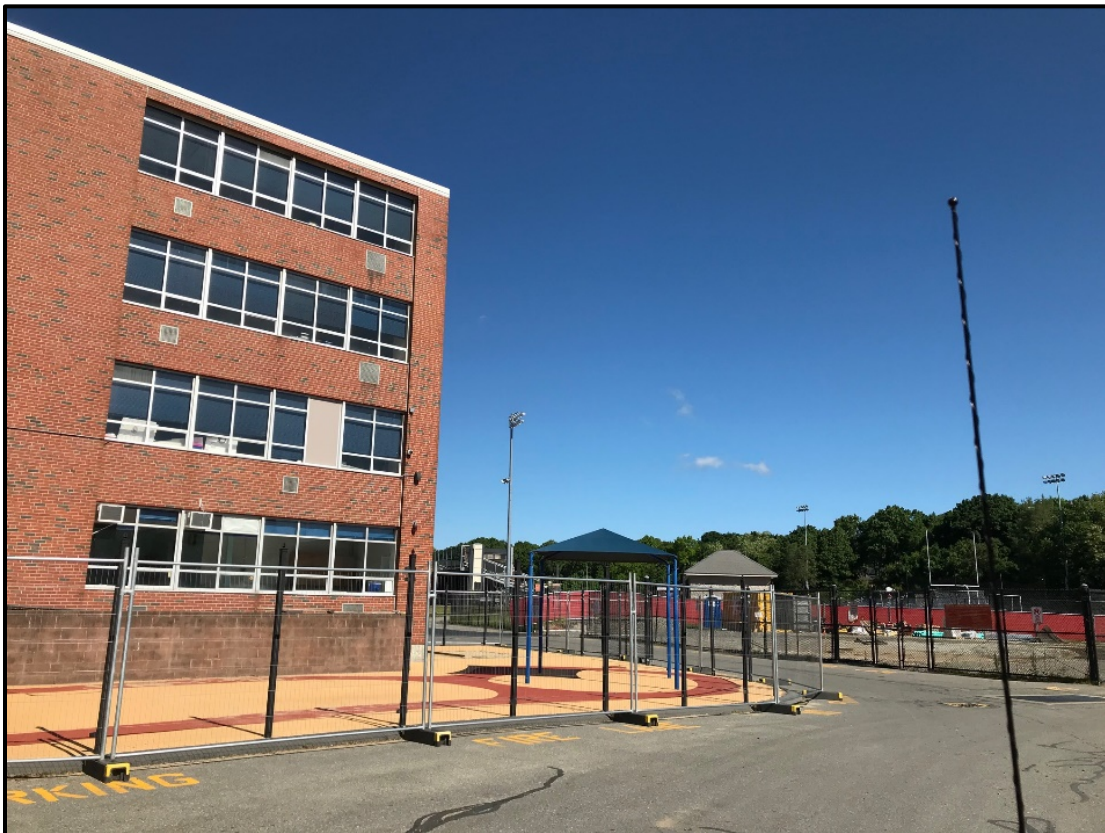
Photograph 6: Playground with Temp. Fence Ready for Demolition