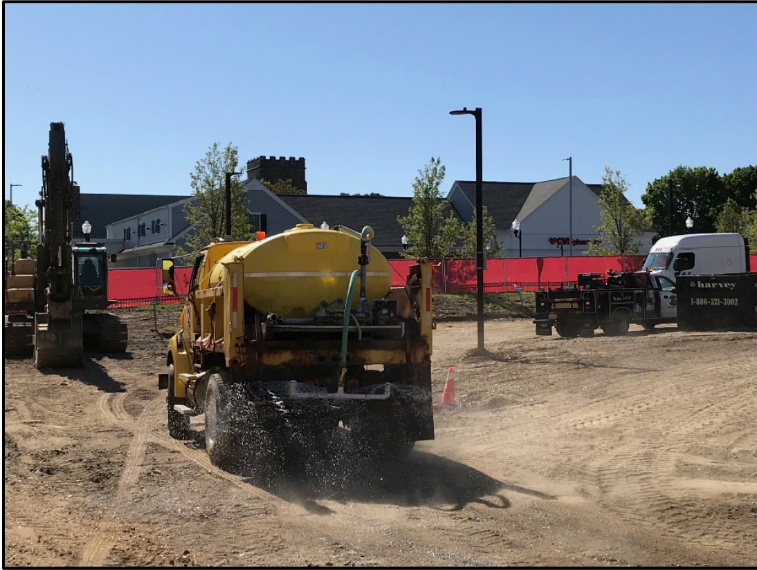
Photograph 3: Mass Ave Front Lawn – Dust Control