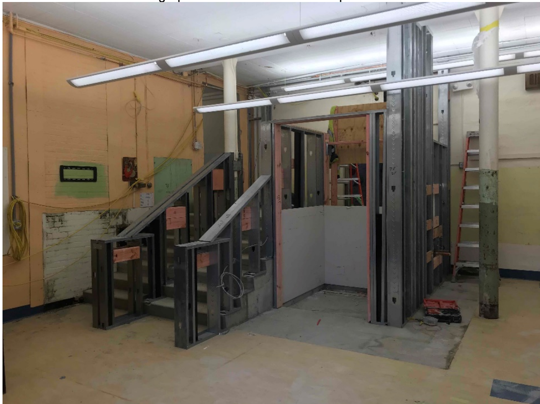
Photograph 2: Handicap lift progress