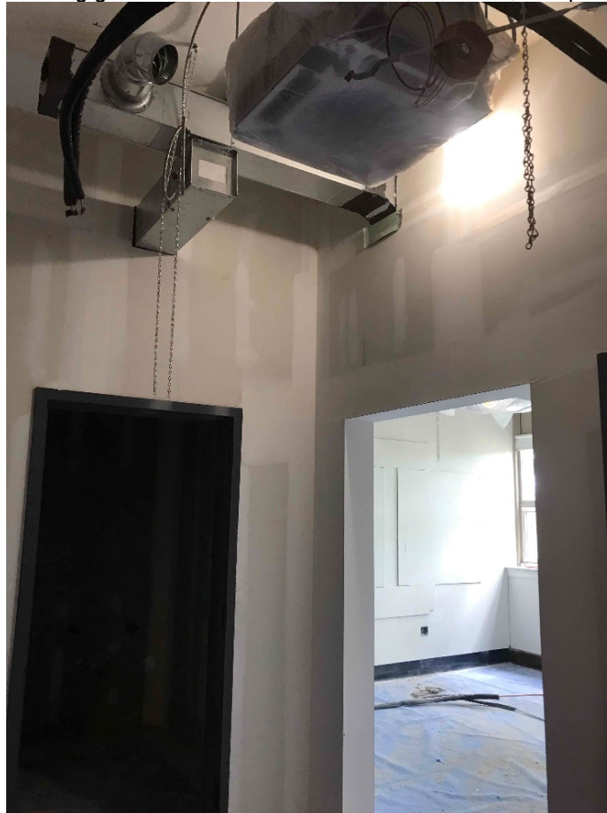
Photograph 6: Ongoing drywall install on upper floors