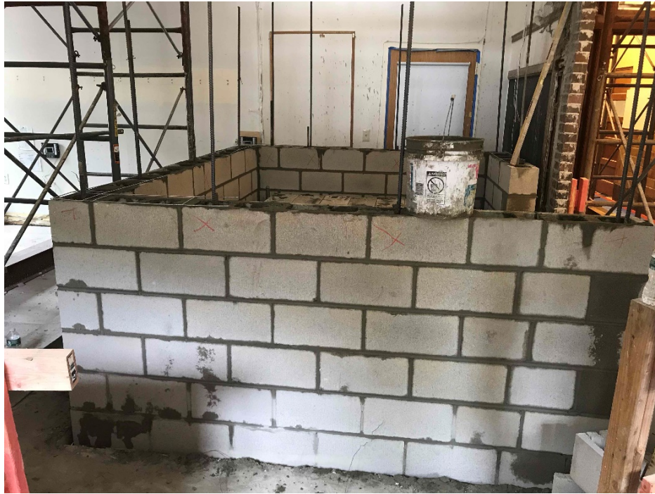
Photograph 3: CMU install at new elevator shaft