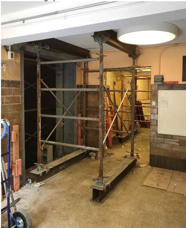
Photograph 4: Temporary shoring (support) for elevator shaft construction