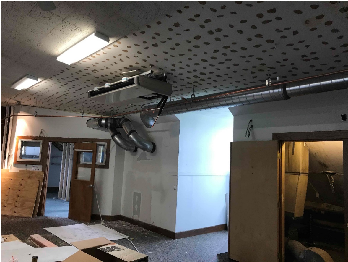
Photograph 7: Ductwork install on top floor