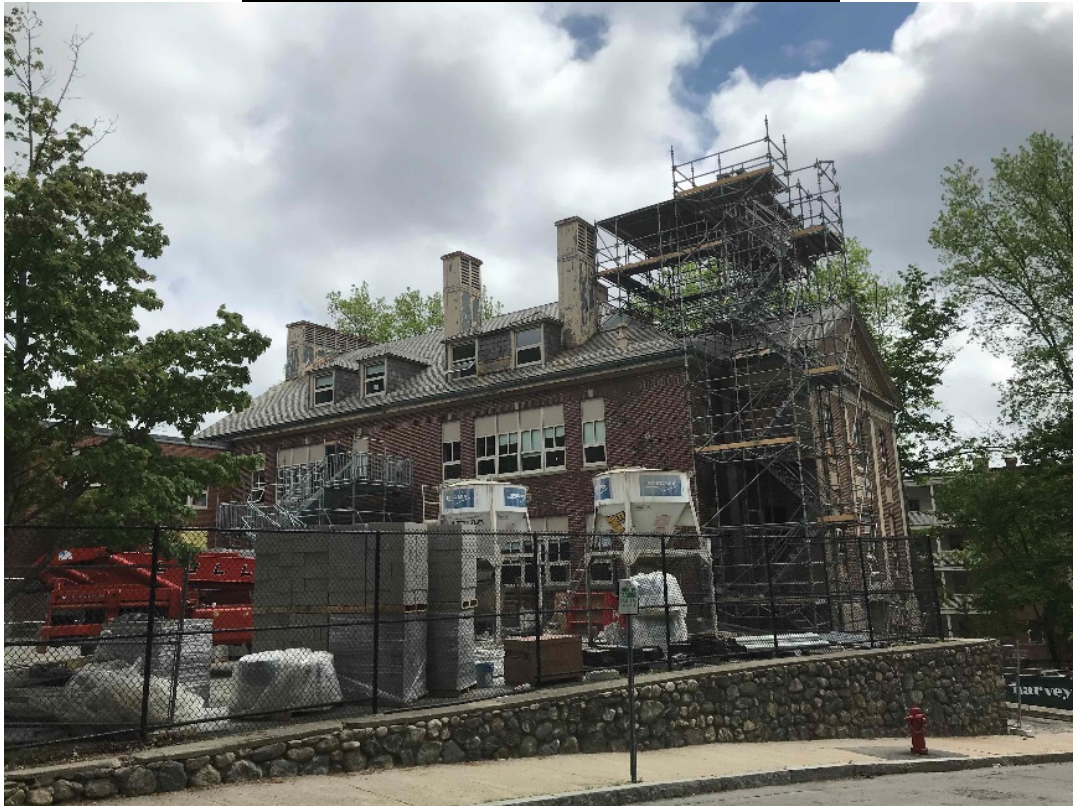
Photograph 1: Exterior scaffold for top floor access