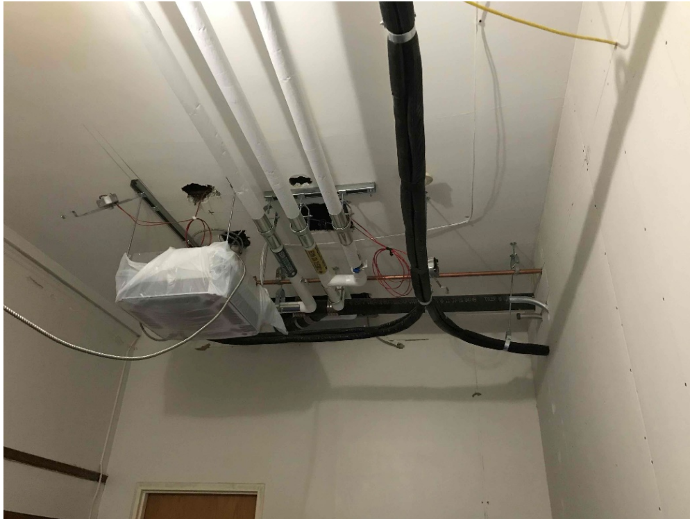
Photograph 5: Install ceiling grid and overhead mechanical, electrical, and plumbing (MEP) devices