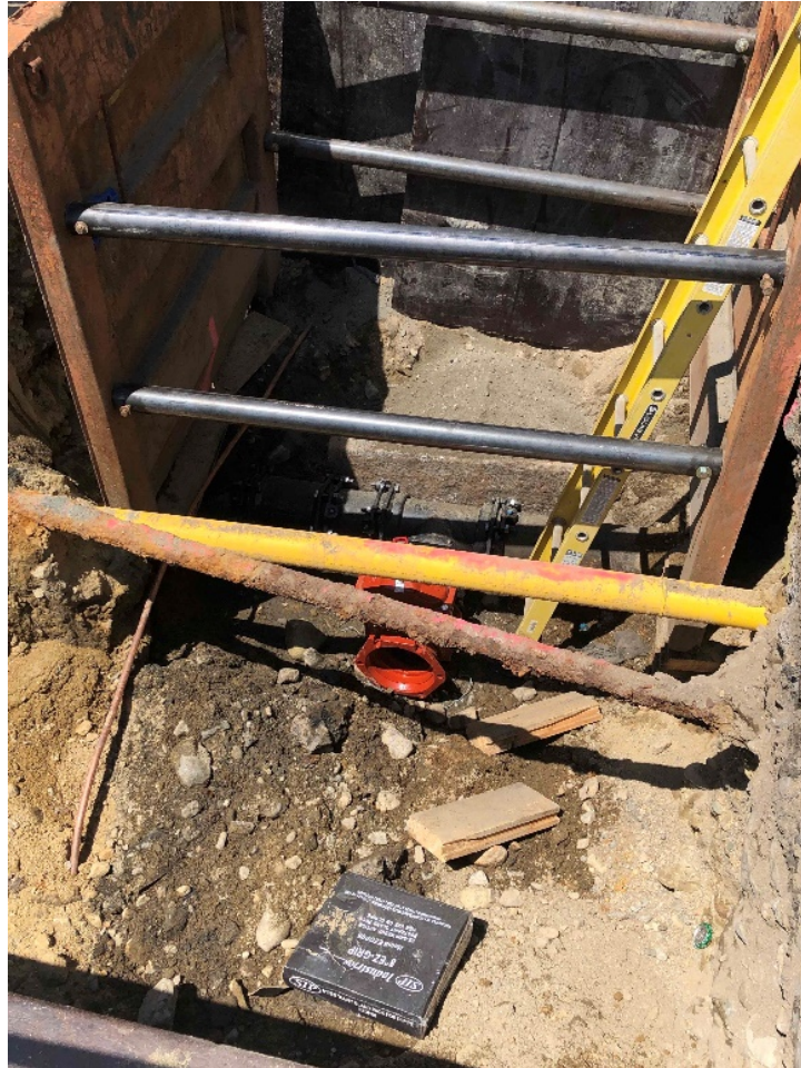
Photograph 4: Derenzo opened up schooler court to install a new water tie in for a new sprinkler line (6/11/20)