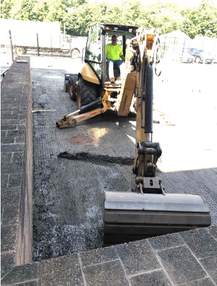
Photograph 2: J. Derenzo scraping turf adhesive off the playground area in preparation for new parking (6/9/20)