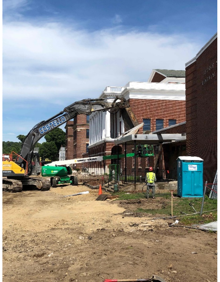
Photograph 3: Costello demolition crew ripping off the canopy to the main entrance (6/9/20)