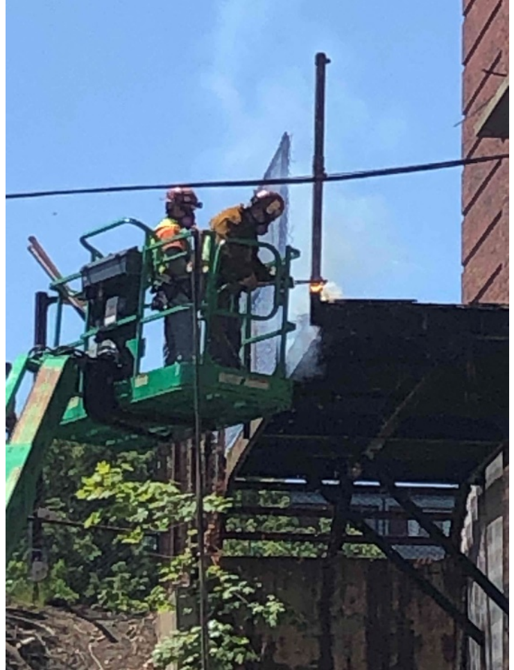
Photograph 2: Costello Demolition Crew removing the fire escape from the Auditorium building (6/8/20)