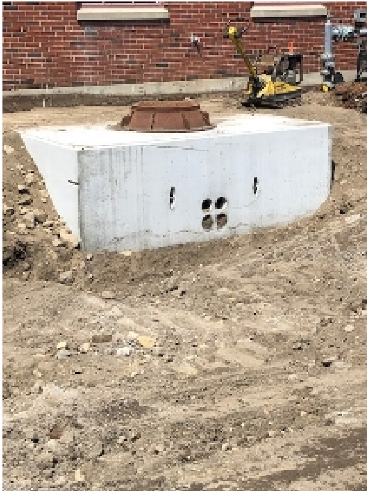
Photograph 5: Derenzo placed Eversource Electrical vault in the ground in front of Fusco Building (6/19/20)