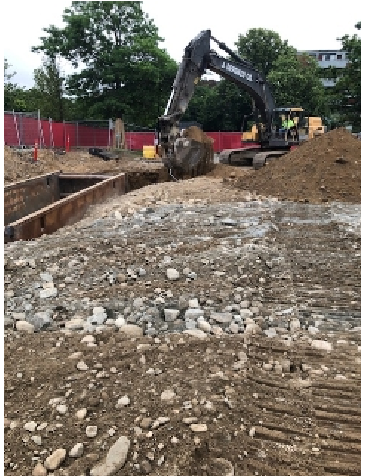
Photograph 4: Derenzo digging by the Mass Ave entrance for installation of 36in drain line (6/19/20)