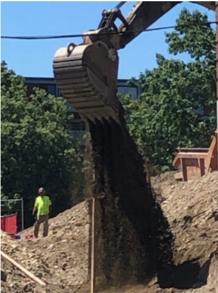
Photograph 1: Derenzo backfilling 36in drain line from North to South at the East end of the Auditorium Building (6/18/20)