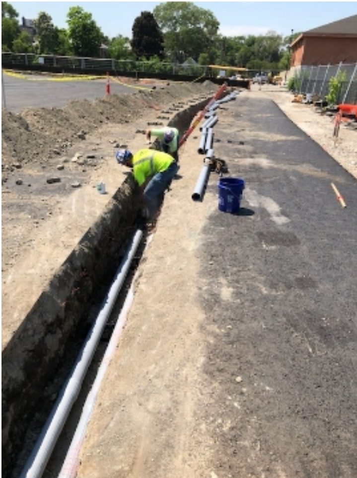
Photograph 3: Griffin installing Conduit in the West Lot for telecom/electrical service (6/22/20)