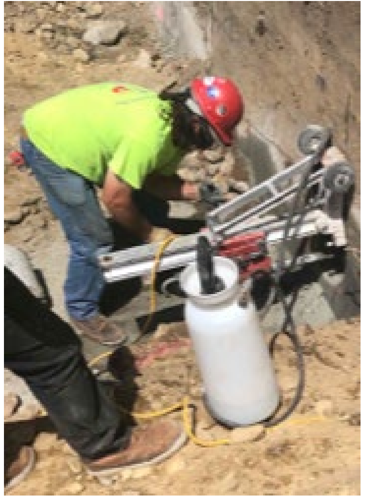
Photograph 6: Rustic coring a hole for west fire protection line (6/17/20)