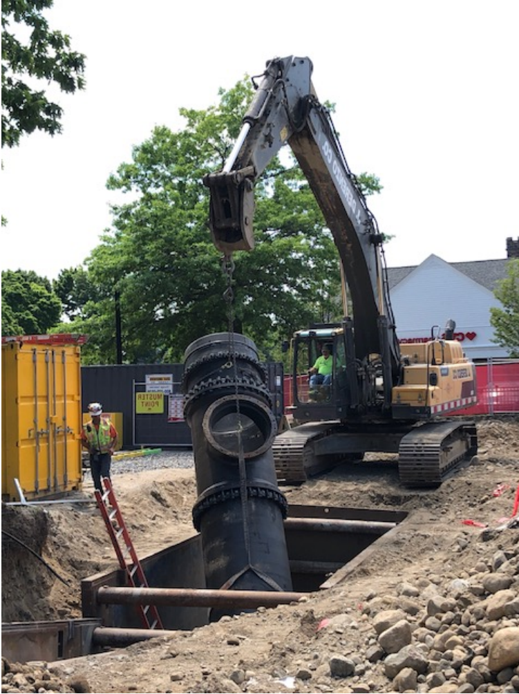
Photograph 1: Derenzo installing 48in drain line along Mass Ave (6/26/20)