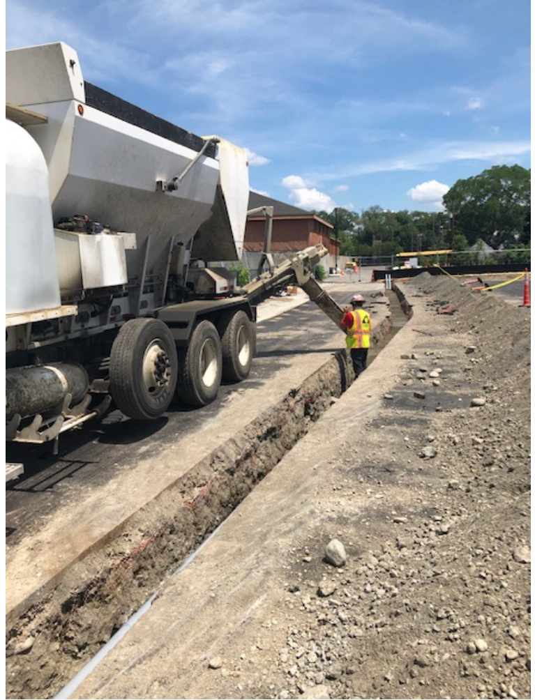
Photograph 2: Derenzo placing concrete for west lot duct bank (6/23/20)