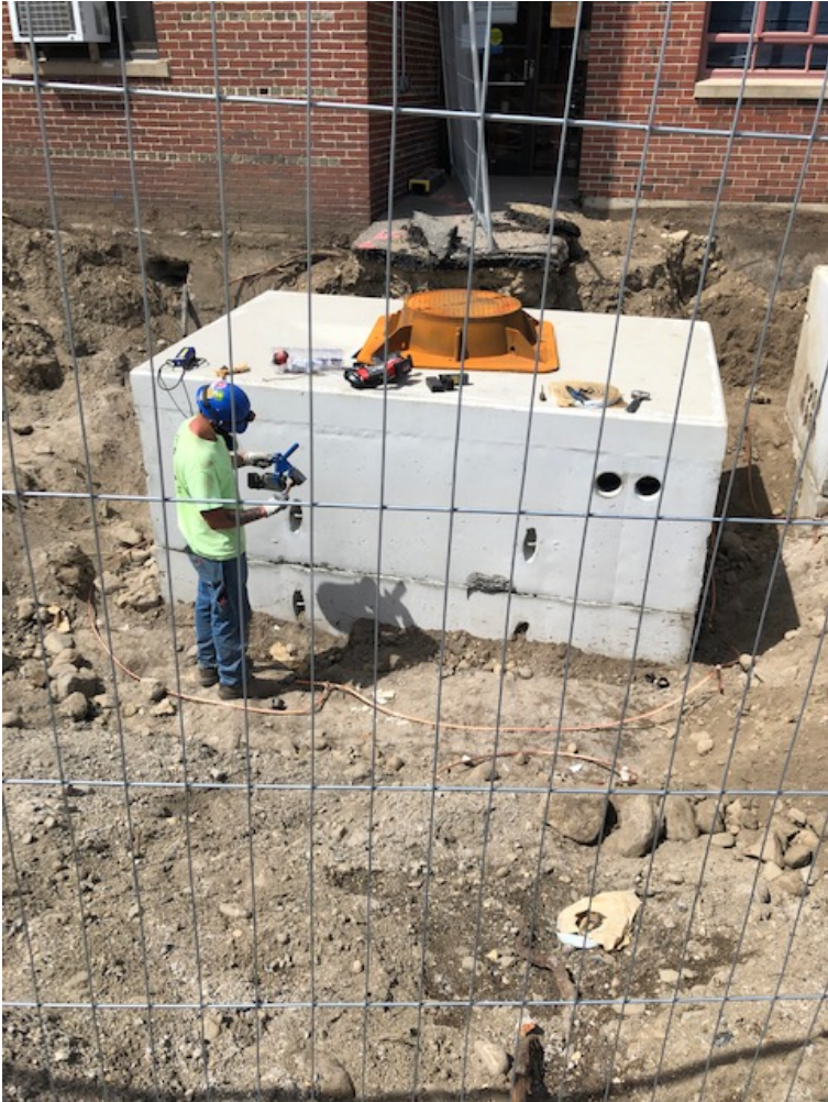
Photograph 2: Griffin working on electrical vault in the ground in front of Fusco Building (6/25/20)