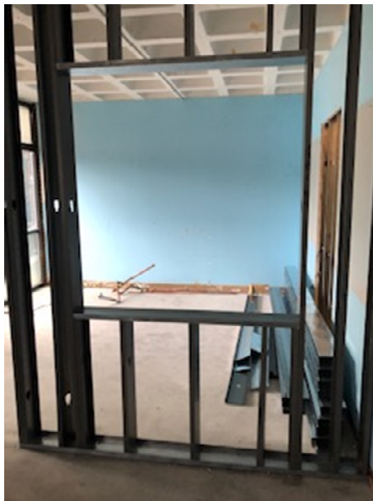
Photograph 8: T.J. McCartney framing in the transaction window in the vestibule of the new swing space in Downs Building