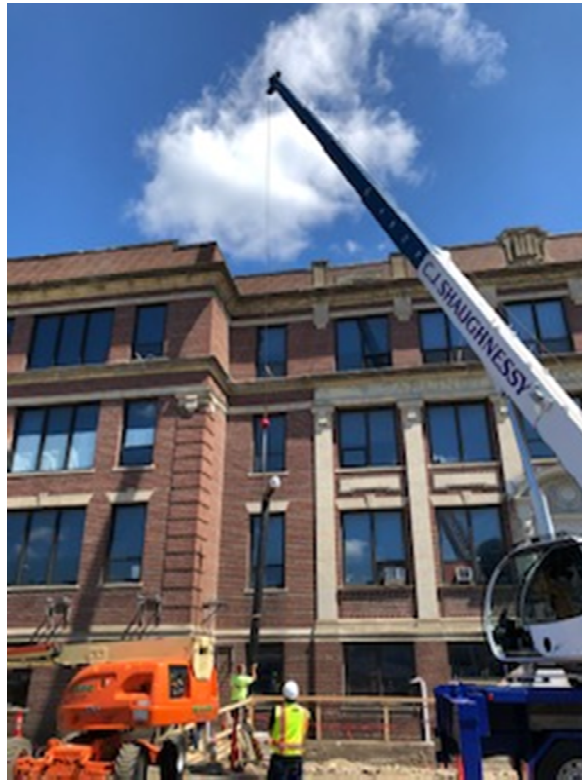
Photograph 3: P.J. Kennedy mounting 10in gas line to the front of Fusco Building