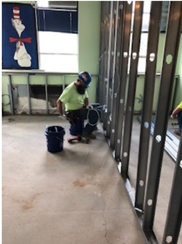
Photograph 7: Electrical work in the new swing space of the Downs Building