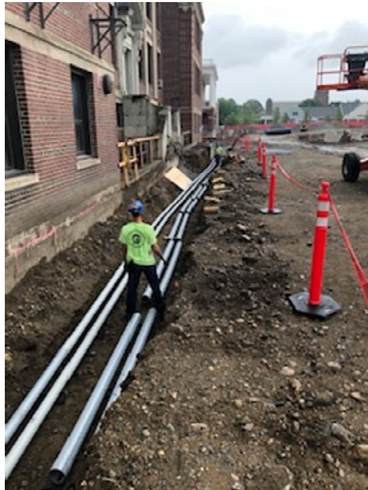
Photograph 2: Griffin running conduit between electrical and telecom vaults