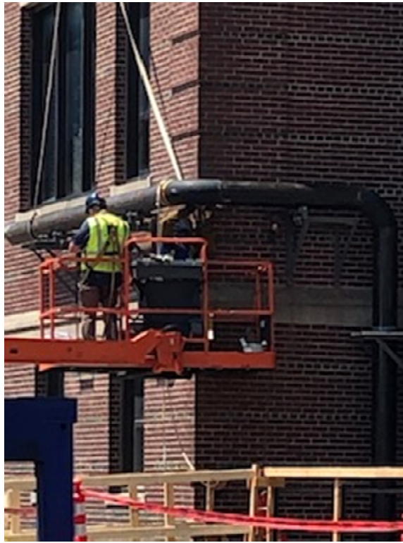
Photograph 5: P. J. Kennedy welding segments of 10in gas line together in front of Fusco Building