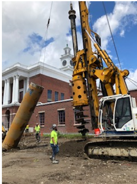
Photograph 4: Keller drilling and installing caissons for support of excavation (SOE) in front of Auditorium Building