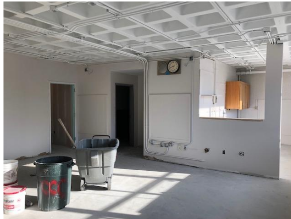
Photograph 1: New administration area in downs with a coat of paint from Color Concepts