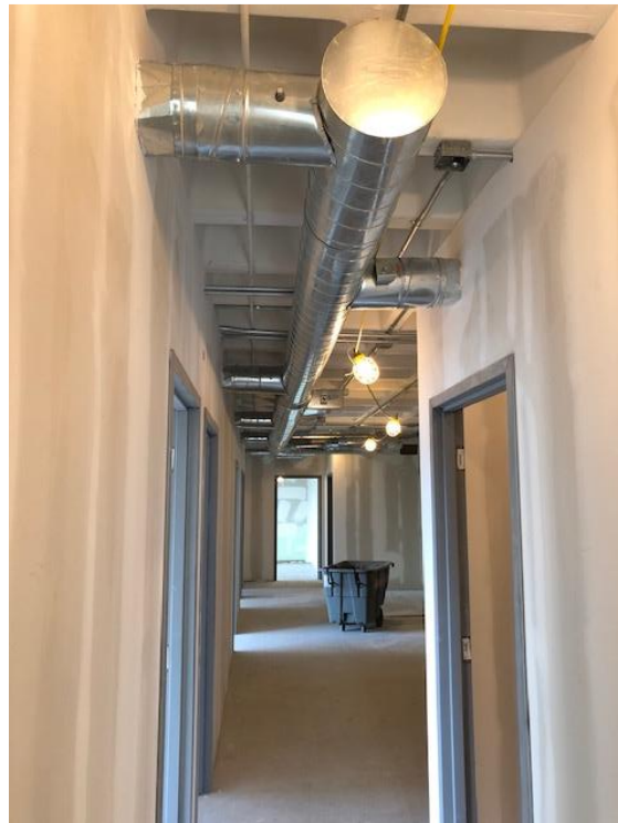
Photograph 2: CAM HVAC installed duct work in the new guidance offices in Downs Building