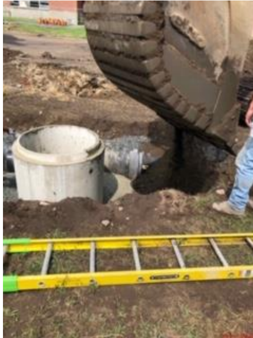
Photograph 2: Derenzo backfilling catch basin east of Auditorium building