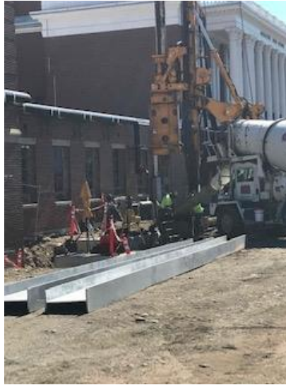
Photograph 5: Keller installing SOE and placing flow fill in front of the school