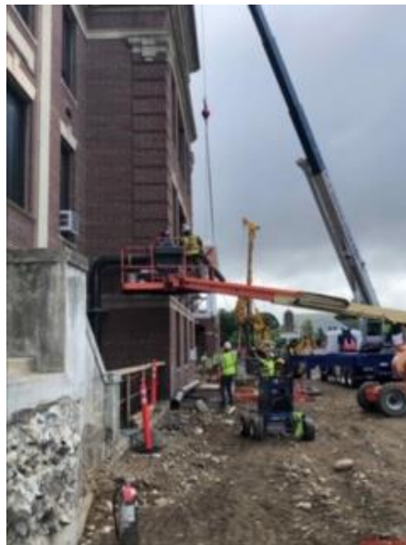
Photograph 6: P.J. Hanging 10 in Gas Line from the front of Fusco