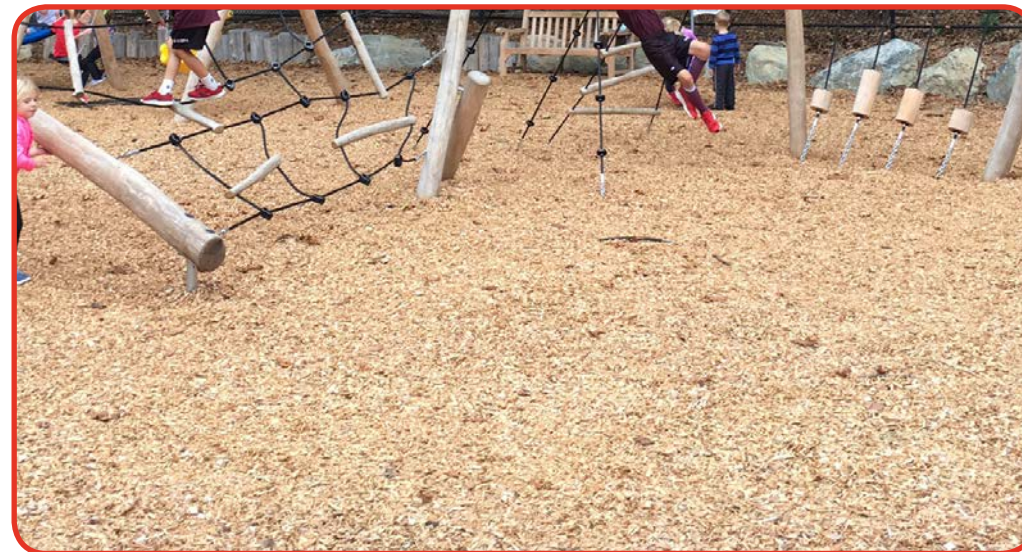
Wood Fiber - $30/cy* (about ($0.50/sf))