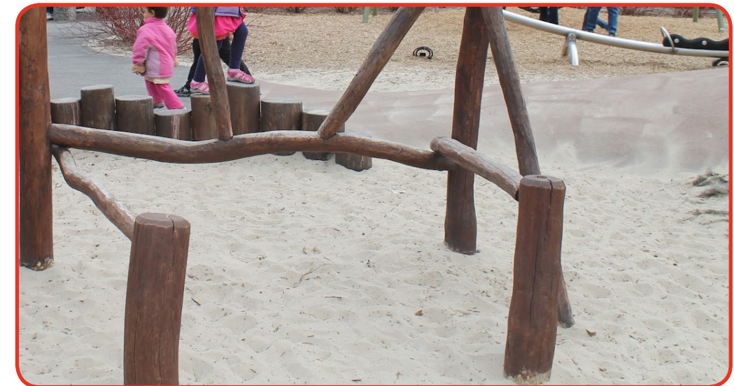
Sand* - $30/cy (about ($0.50/sf))