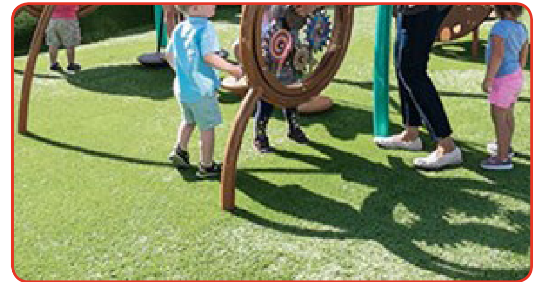
Artificial Turf ($18/sf)