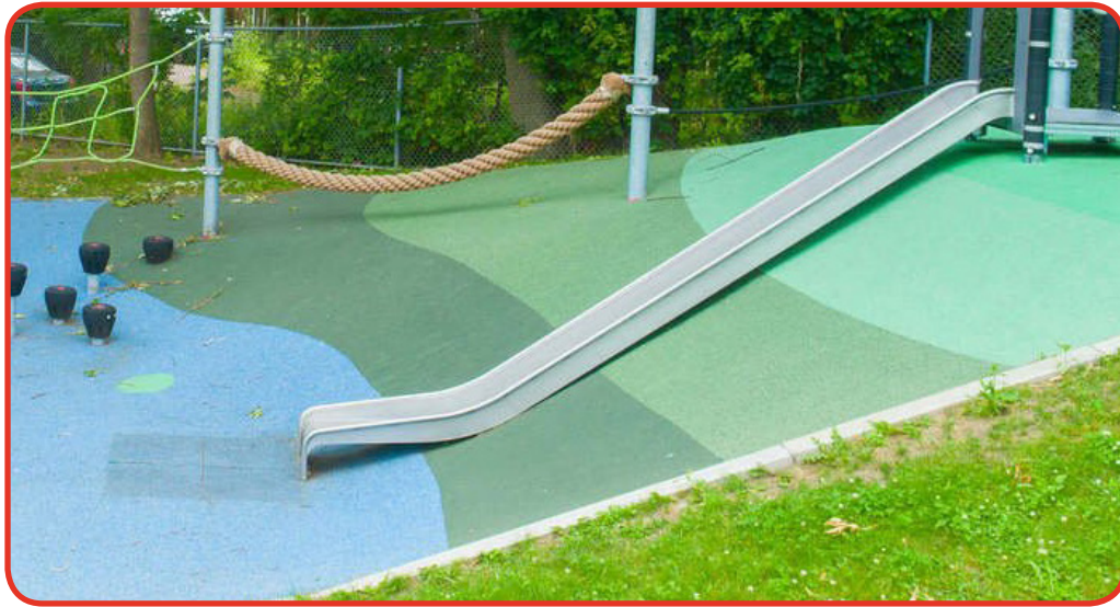
Pour-in-Place - $20/sf