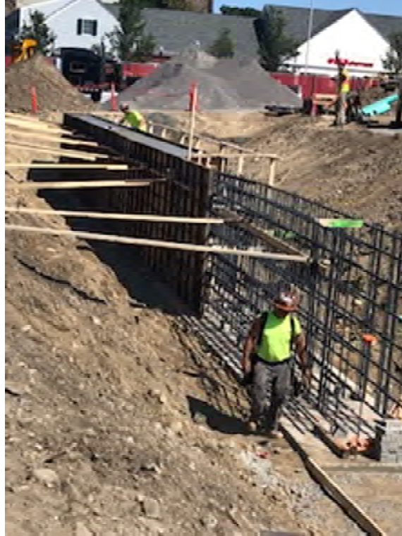
Photograph 1: Riggs placing and finishing “Deadman Wall” for Support of Excavation (SOE) in Front Lawn