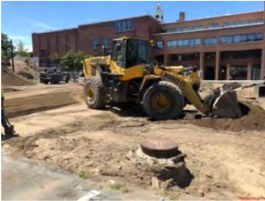
Photograph 3: Derenzo prepping back parking area east of Auditorium building