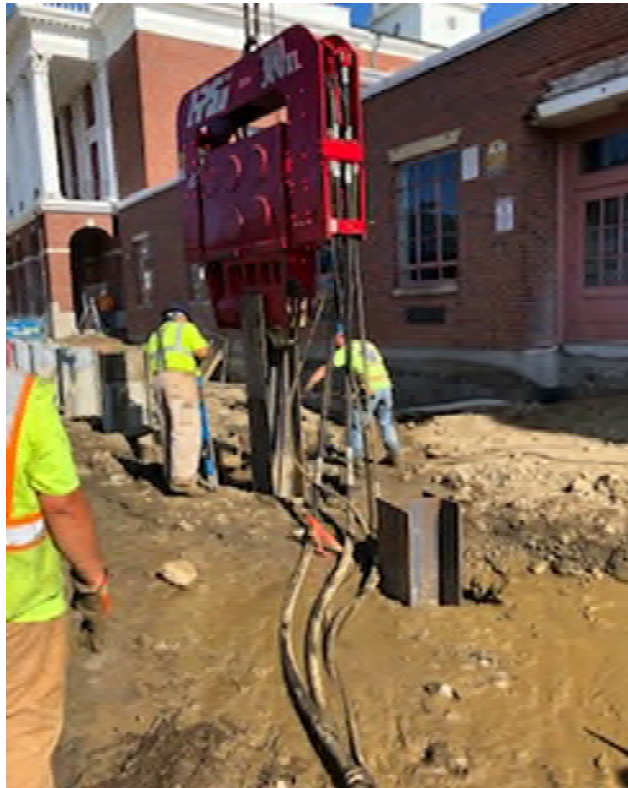
Photograph 2: Keller Vibrating SOE piles in front of school