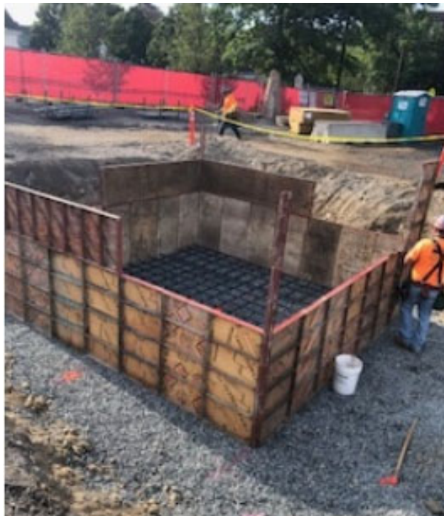
Photograph 2: Spread footings installation for Phase 1 Building