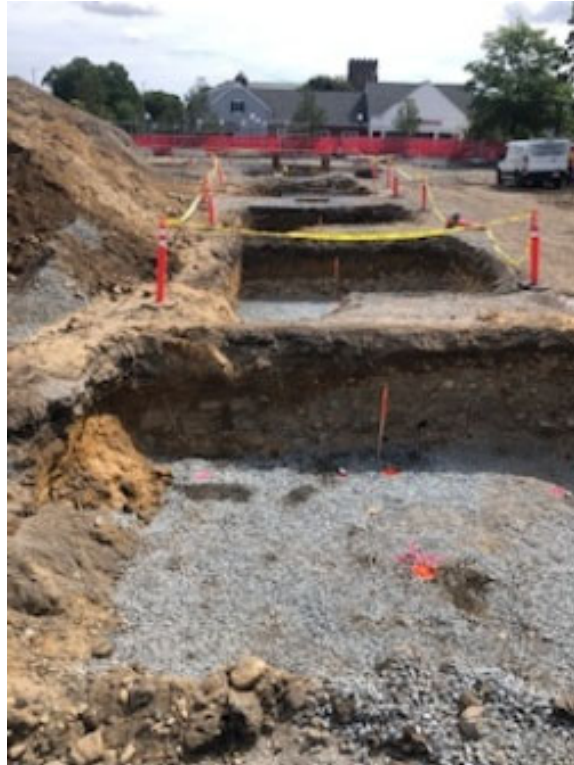
Photograph 3: Digging holes for more Phase 1 Building footings