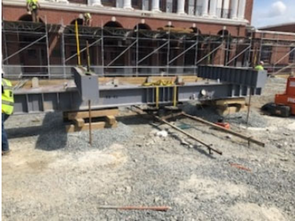
Photograph 5: Performing load tests on piers