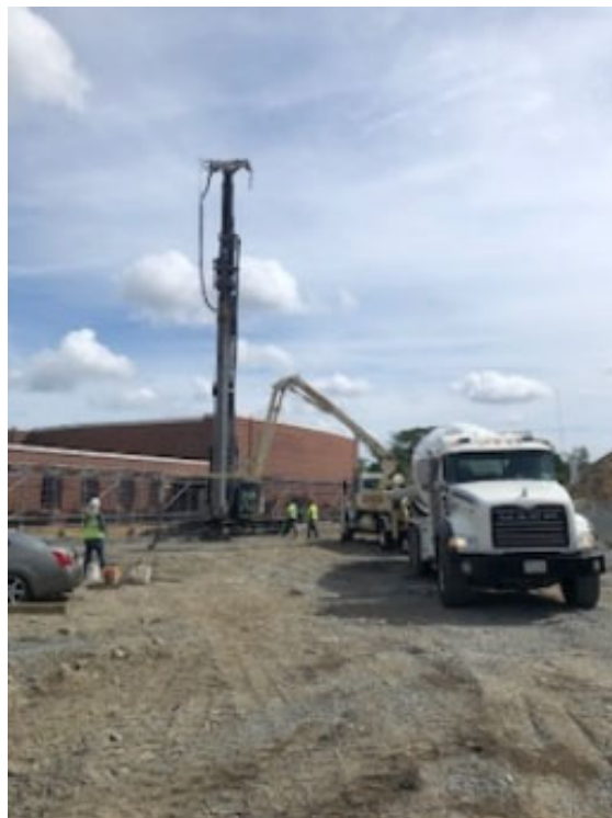
Photograph 4: Installing GCC's for Phase 1 Building