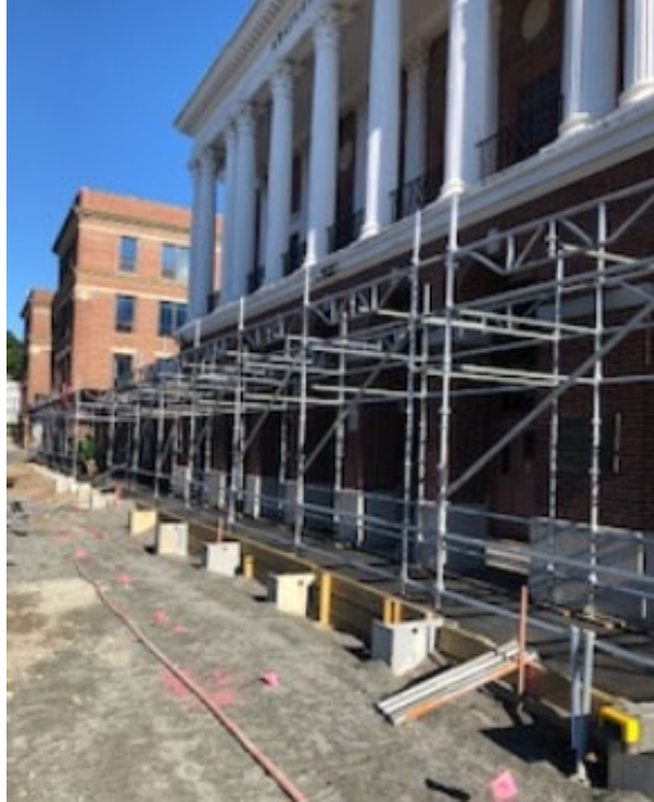
Photograph 1: Installation of overhead protection along the new temporary covered sidewalk