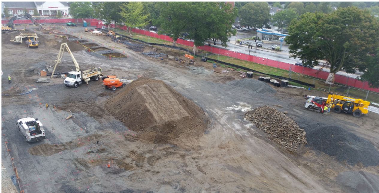
Photograph 6: View of Phase 1 Site Work in Progress (9/3/20)