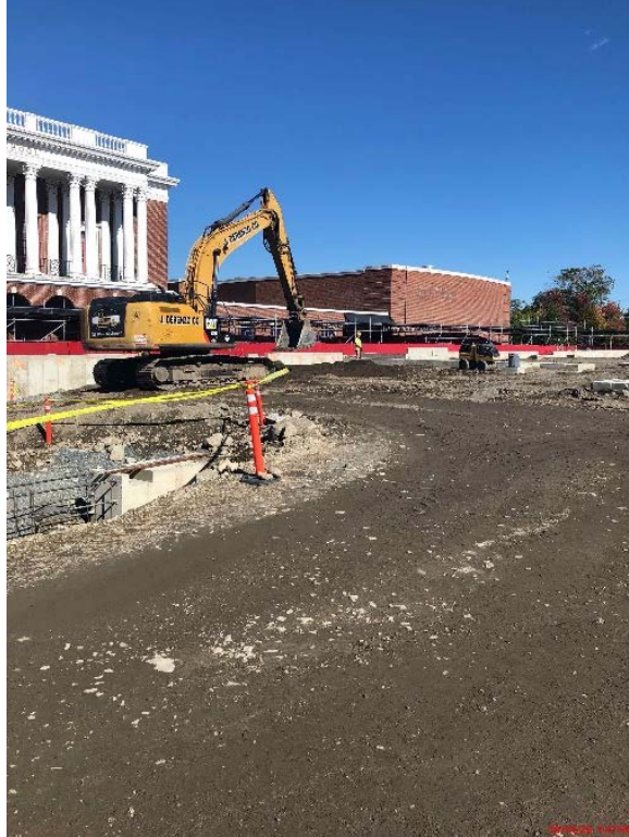
Photograph 1: Back filling Phase 1 New Building foundation wall