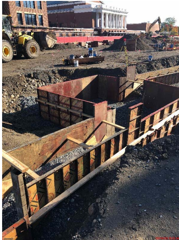
Photograph 2: Forming footings for Phase 1 New Building foundation south wall