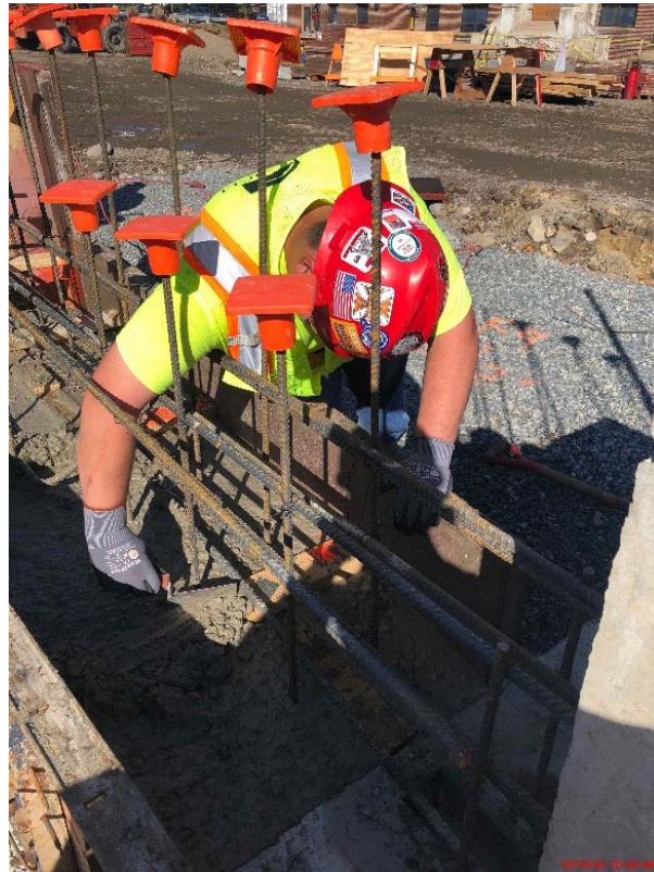
Photograph 5: Troweling footings being placed for Building Phase 1 New Building