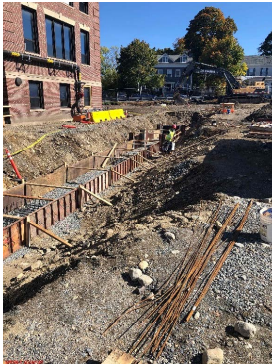
Photograph 2: Forming and tying steel for footings for Phase 1 New Building north wall