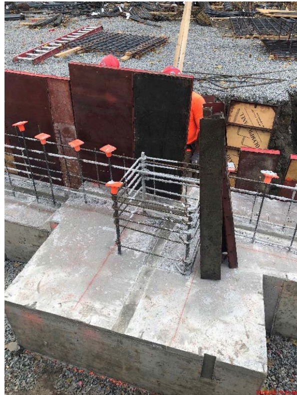
Photograph 6: Forming walls for Phase 1 New Building foundation