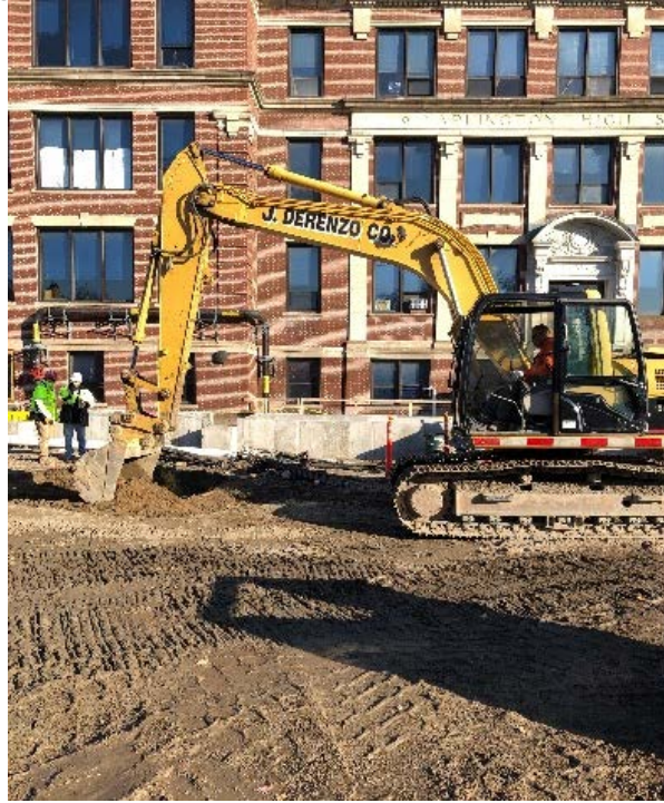
Photograph 1: Derenzo excavating spread footings for Phase 1 New Building