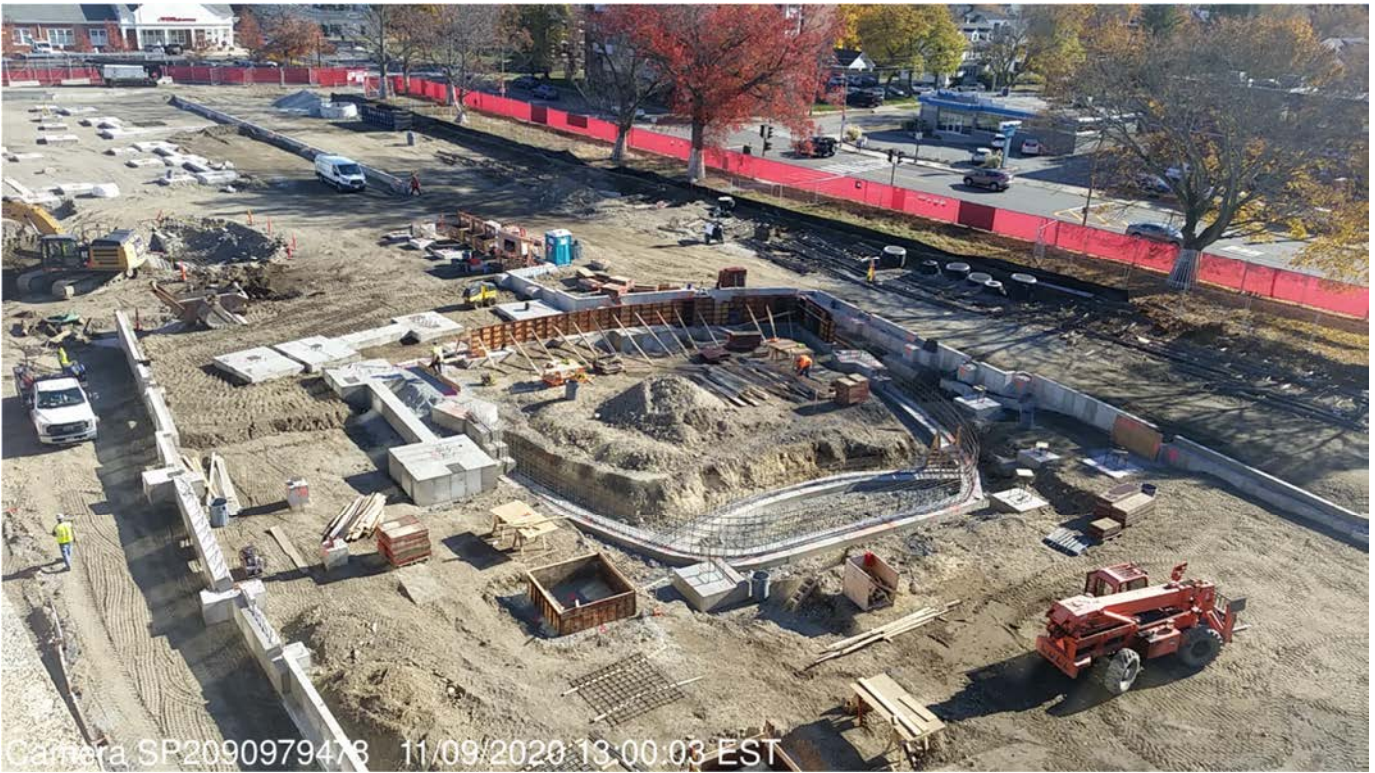
Photograph 3: Aerial shot of Phase 1 New Building foundations in progress