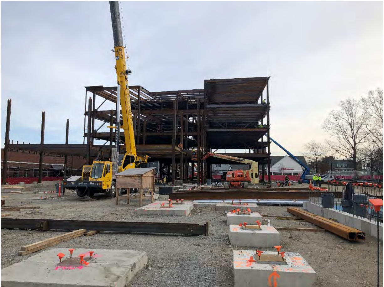
Photograph 2: Building D Steel Erection progress photo

WEEKLY UPDATE – WEEK OF DECEMBER 28, 2020- JANUARY 4, 2021