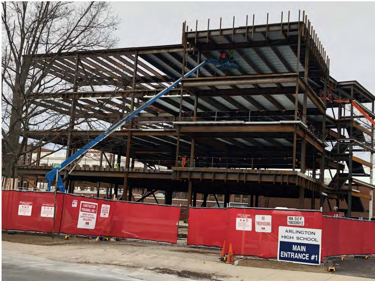
Photograph 2: Building D Steel Erection progress photo from Mass Ave.