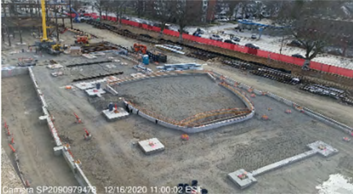
Photograph 1: Fusco Camera Aerial View of the Site