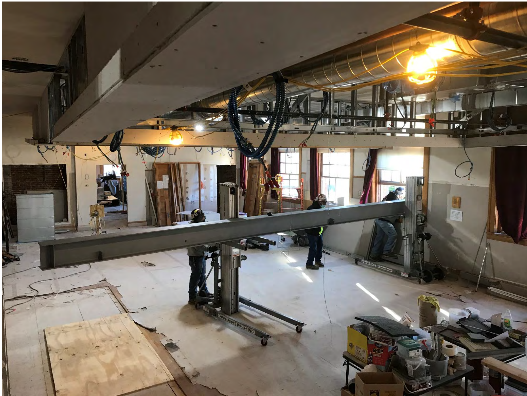
Rigging steel beam for operable partition through 1 st Floor window.