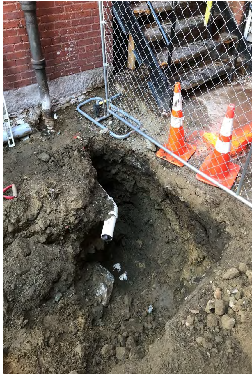
Existing downspout drainage piping at new north entry canopy