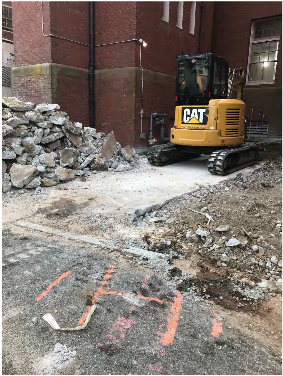
Demolition at north entry concrete walkway area