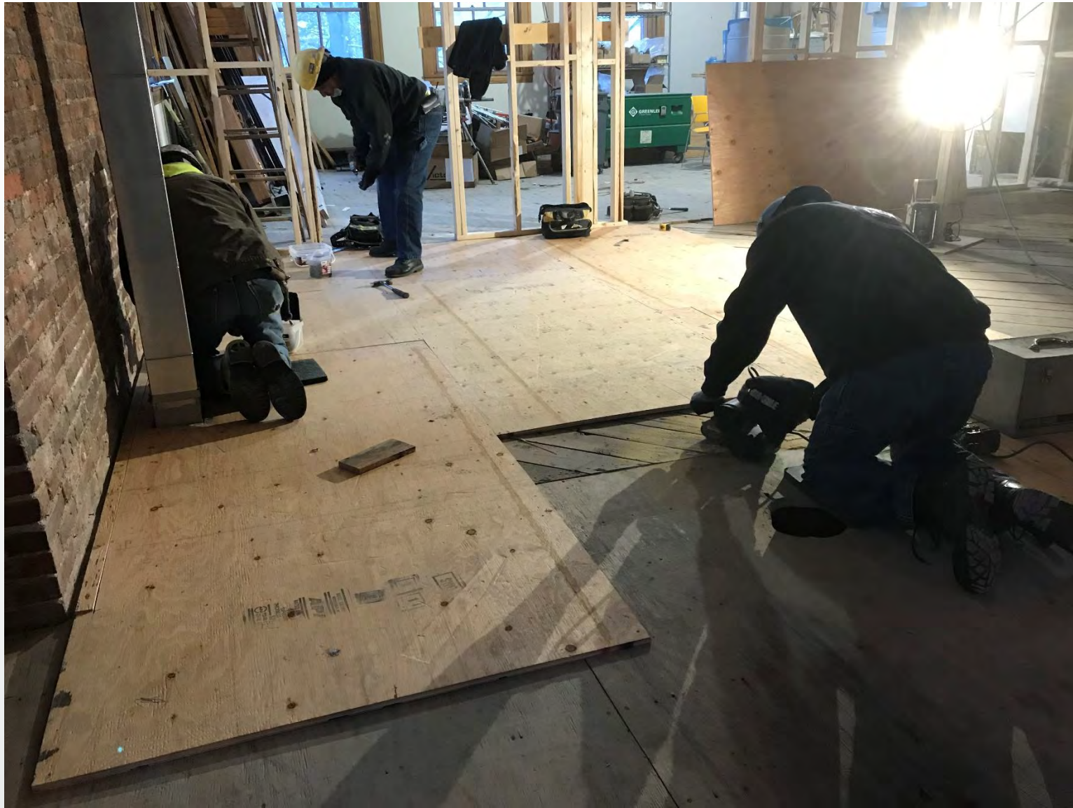
Plywood underlayment at removed wood flooring at 1 st Floor