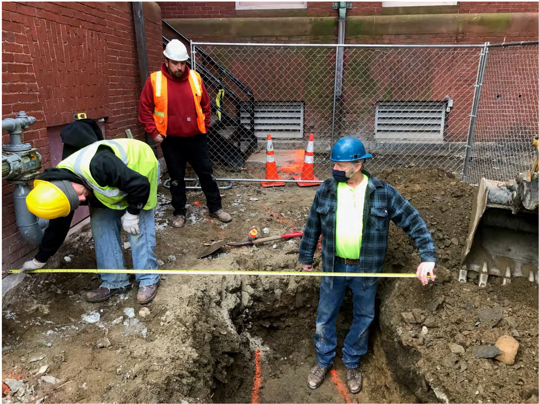
Test pit to uncover secondary wiring ductbank at new north entry canopy