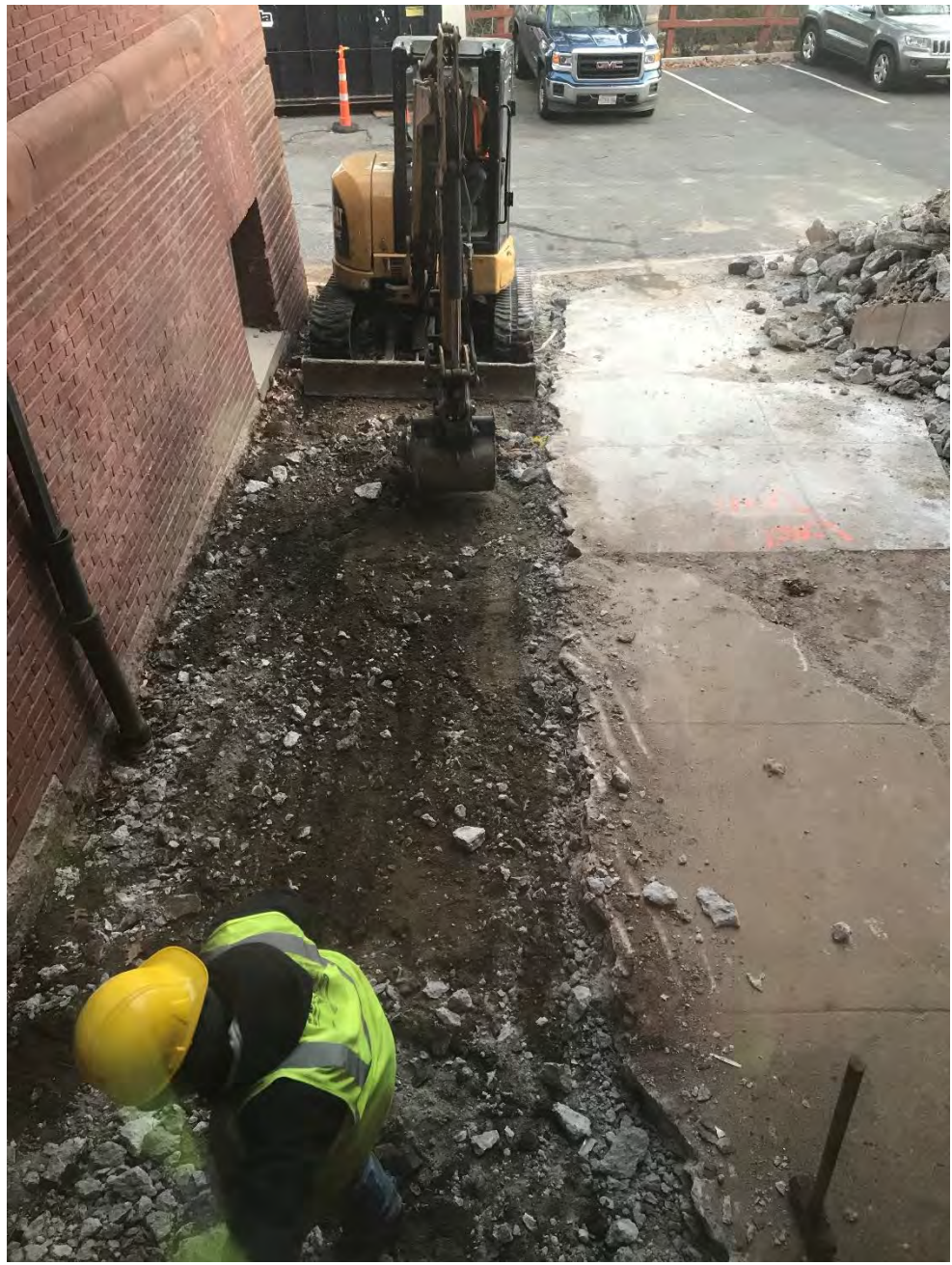
Demolition at former cooling tower pad.