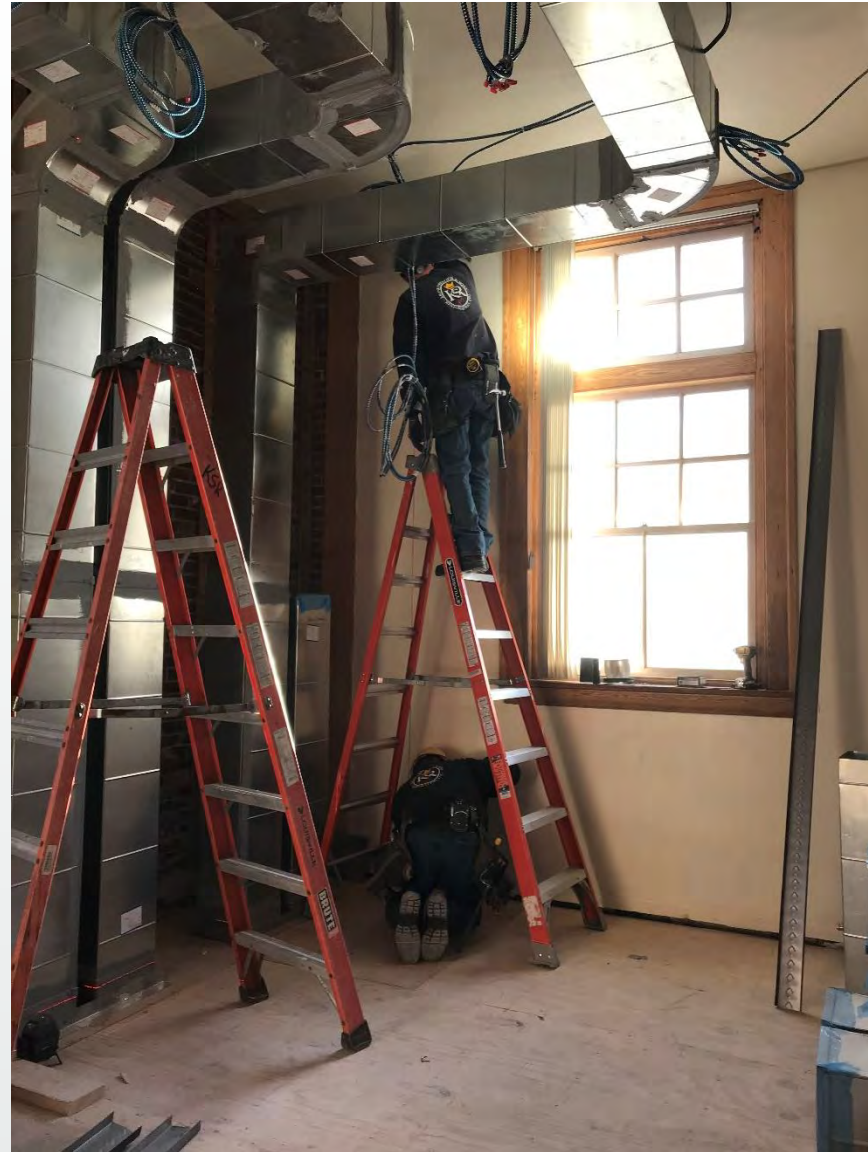
Ductwork on 1 st Floor