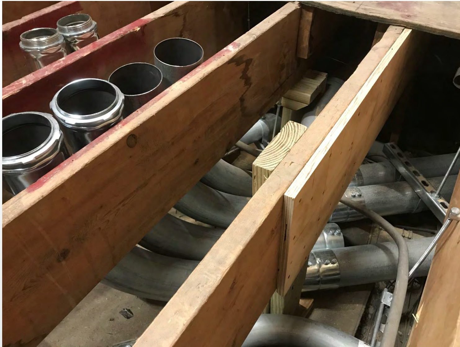
Repaired joists at raised floor at new switchgear in mechanical room