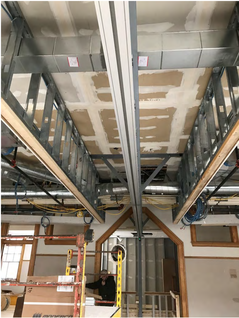
Operable partition track on 1 st Floor