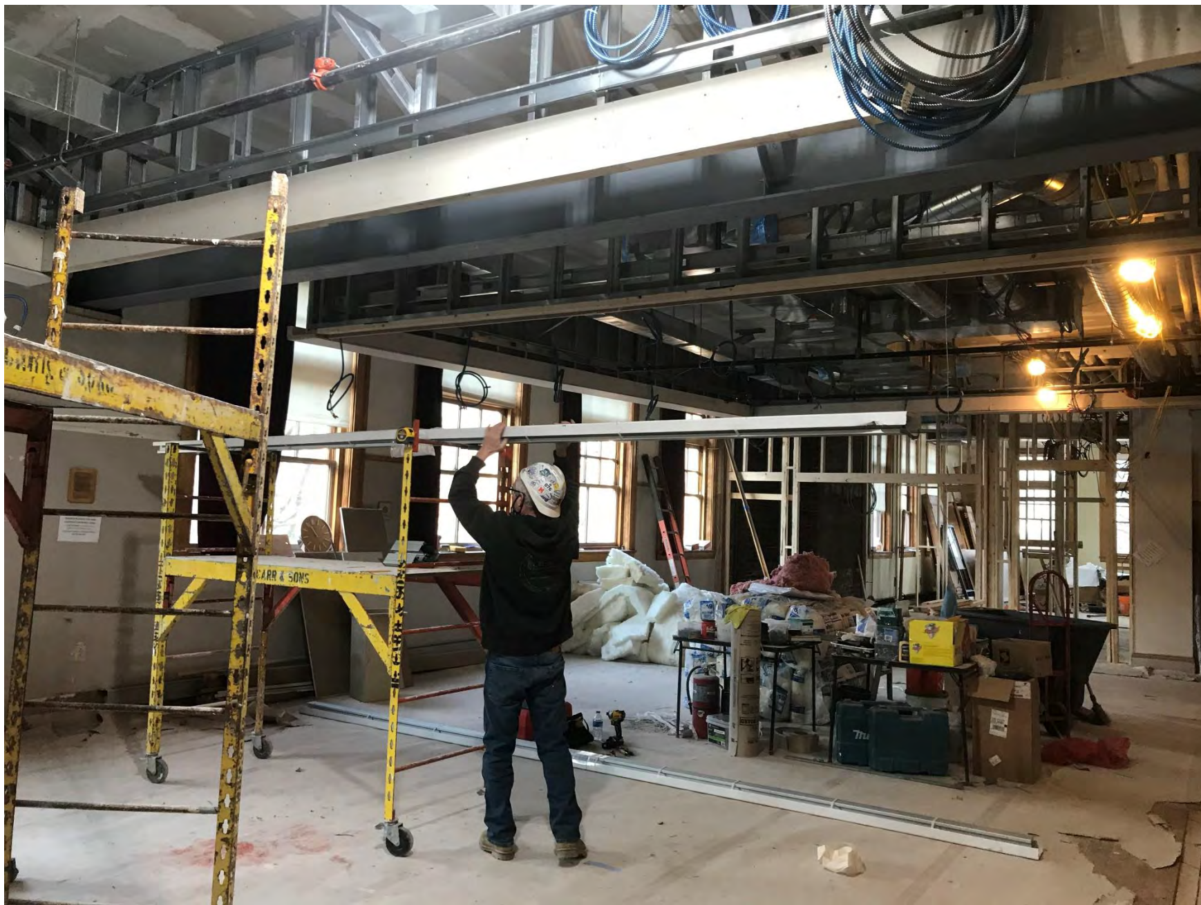
Operable partition track installation