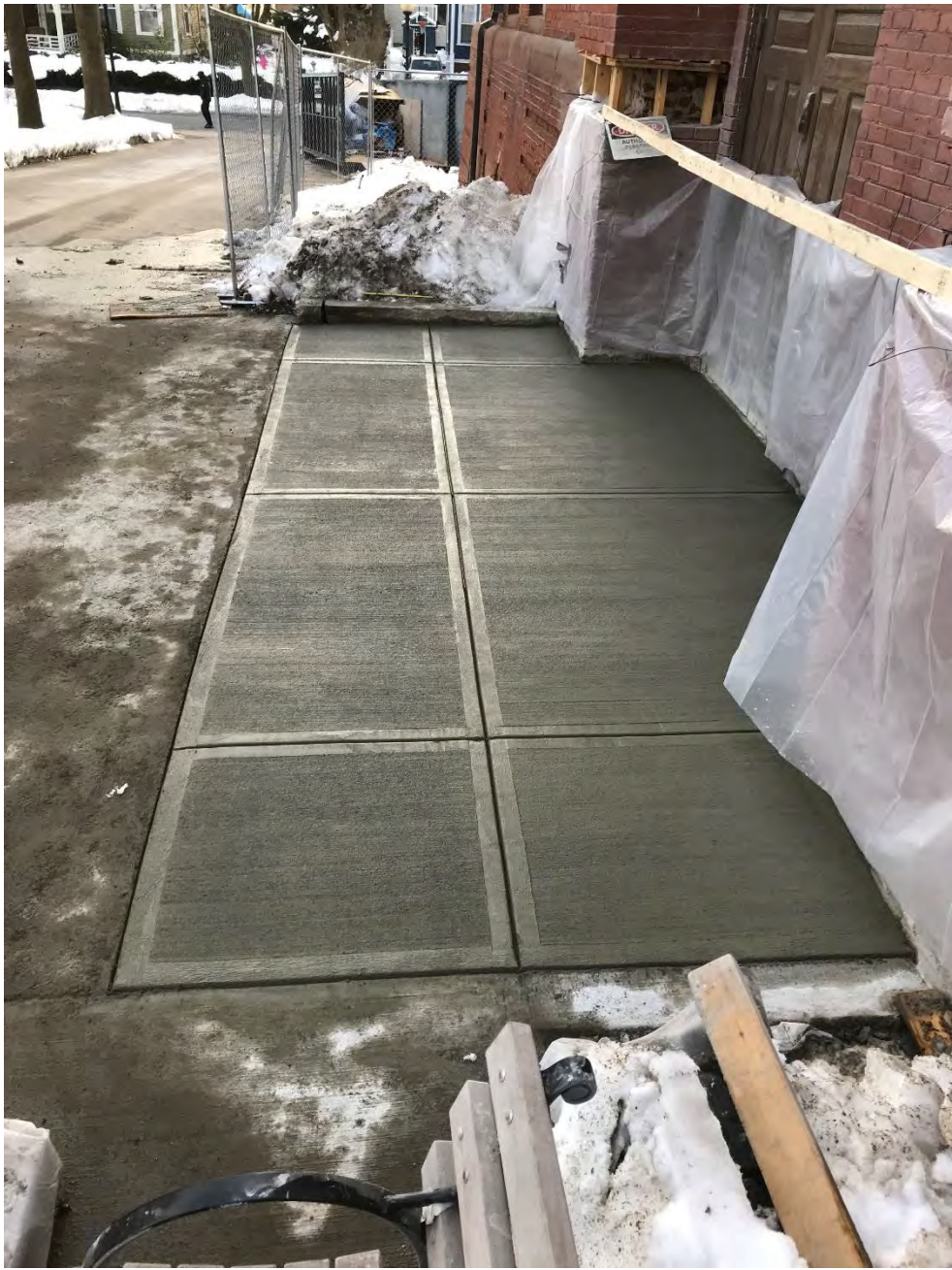
Second pour of new concrete pad at east entry