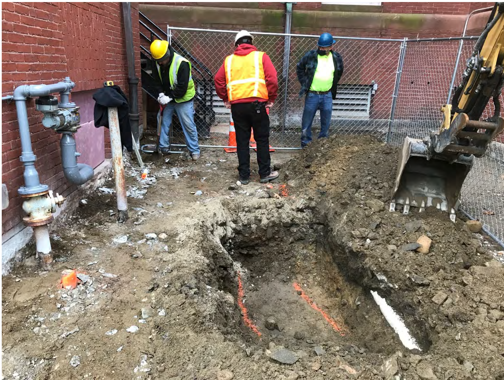
Test pit to uncover secondary wiring ductbank at new north entry canopy