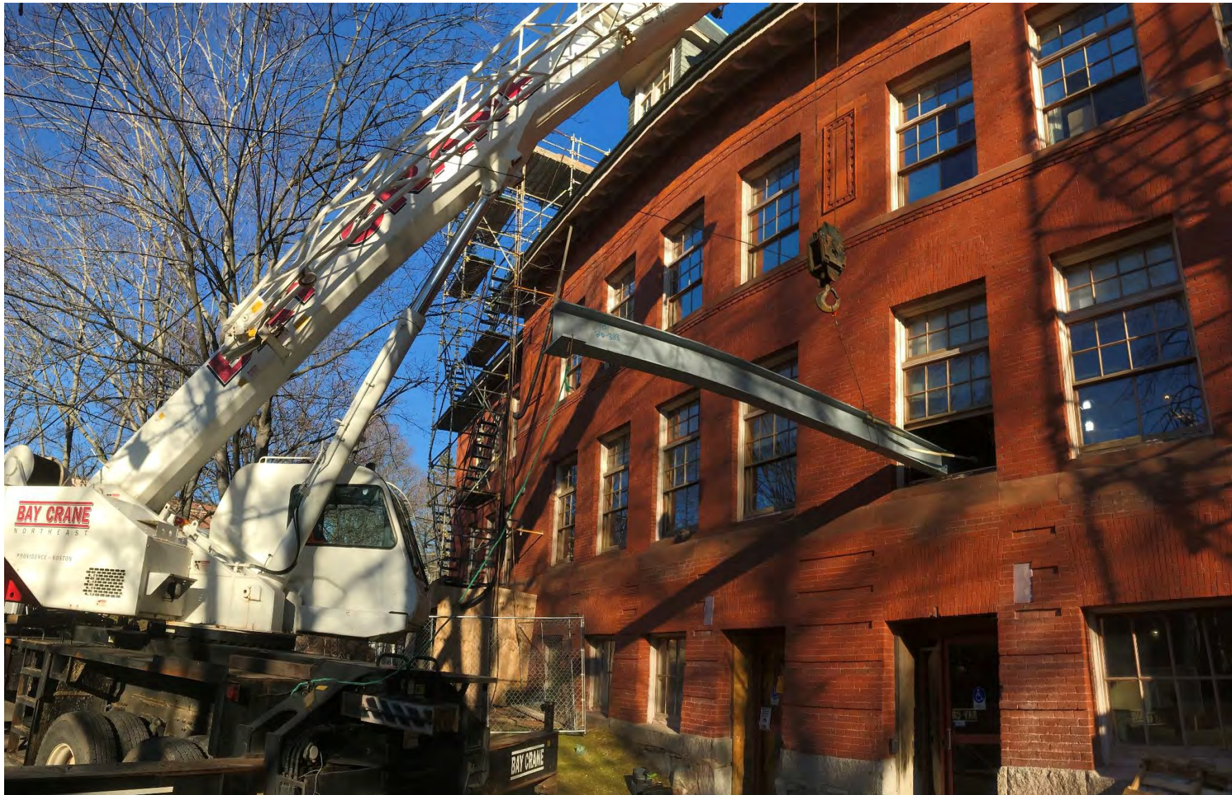
Rigging steel beam for operable partition through 1 st Floor window.