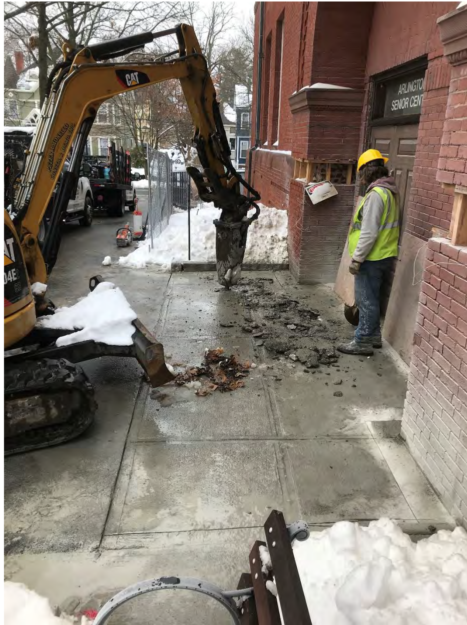
Removal of rejected east entry concrete pad