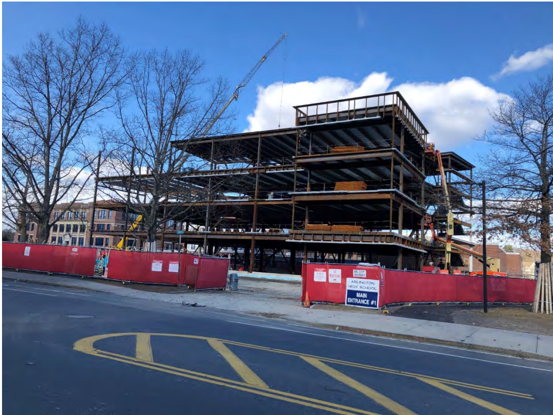
Photograph 2: Building D Steel Erection progress photo from Mass Ave