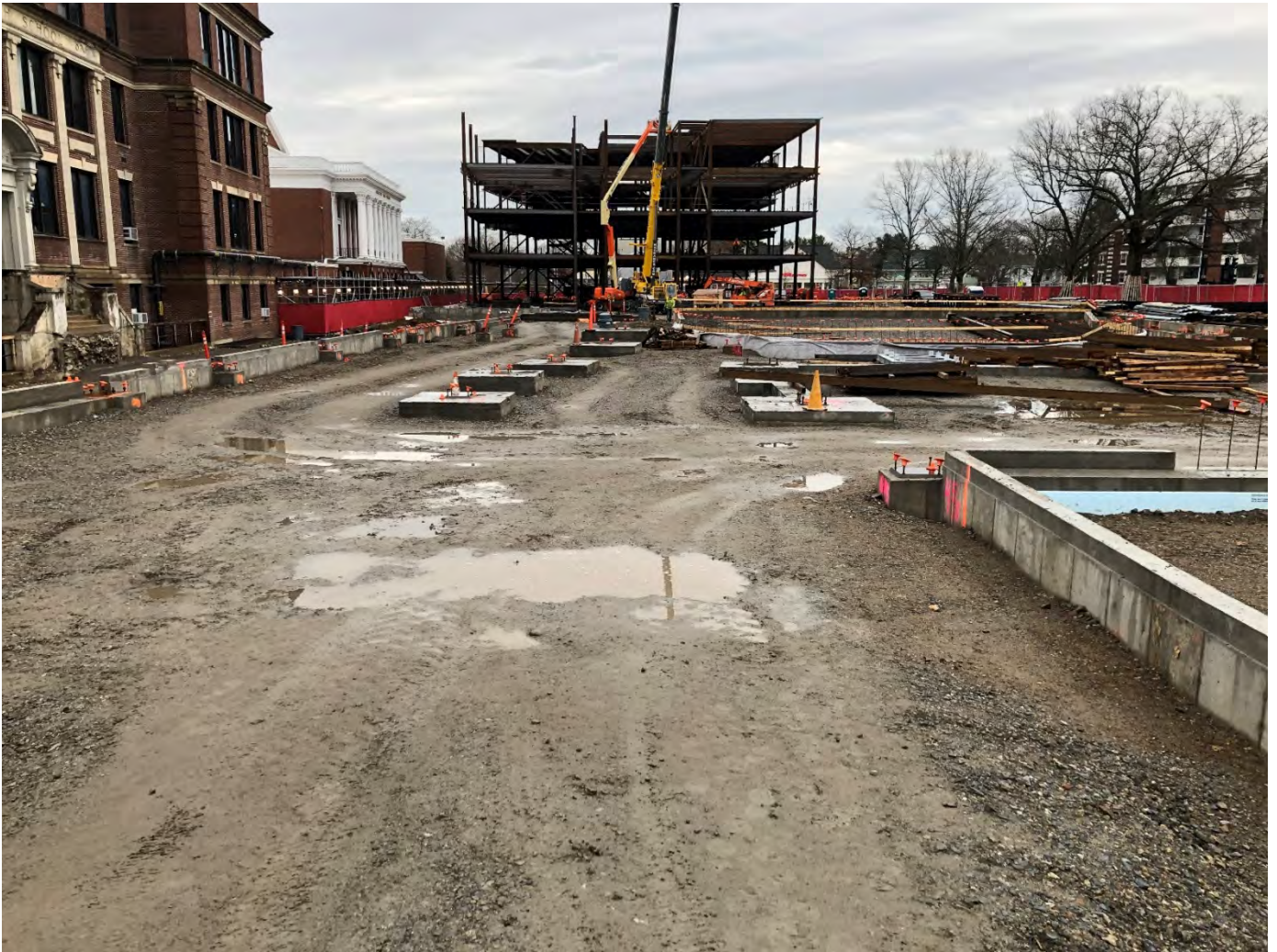
Photograph 3: Building D Steel Erection progress photo