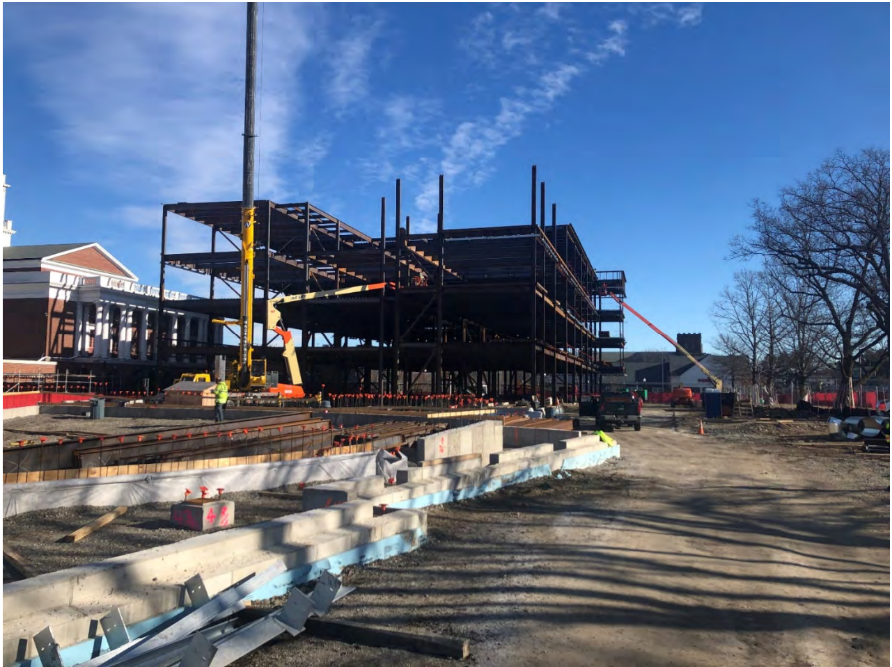
Photograph 3: Building D Steel Erection progress photo