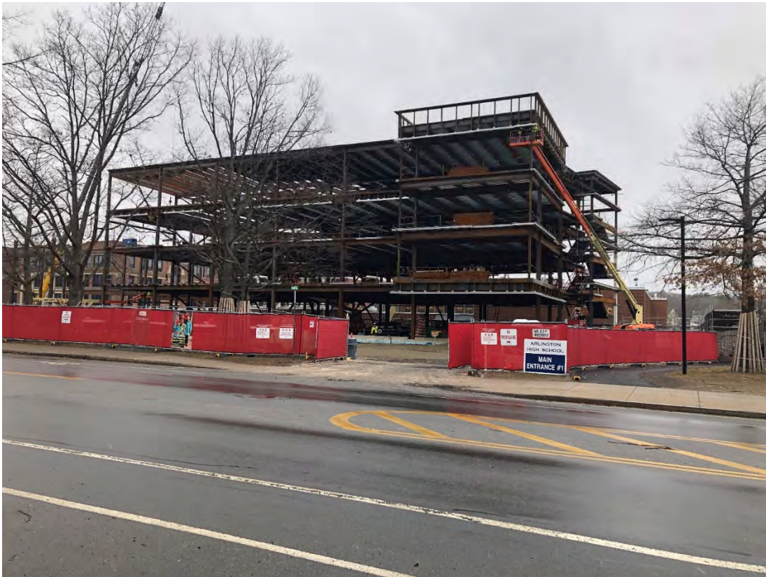
Photograph 2: Building D Steel Erection progress photo from Mass. Ave.