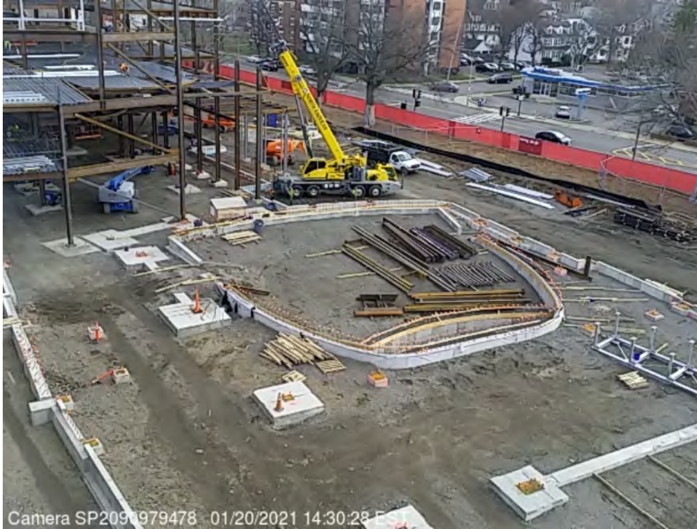
Photograph 1: Fusco Camera Aerial View of the Site