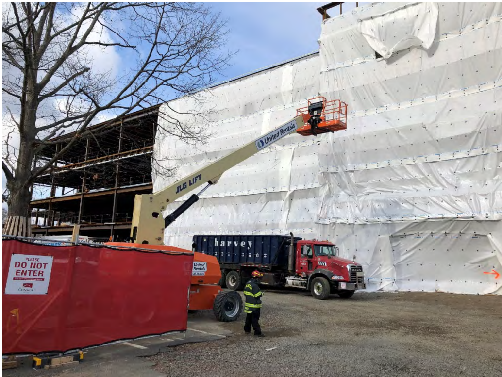
Photograph 2: Building D Steel Erection progress photo from Mass. Ave.