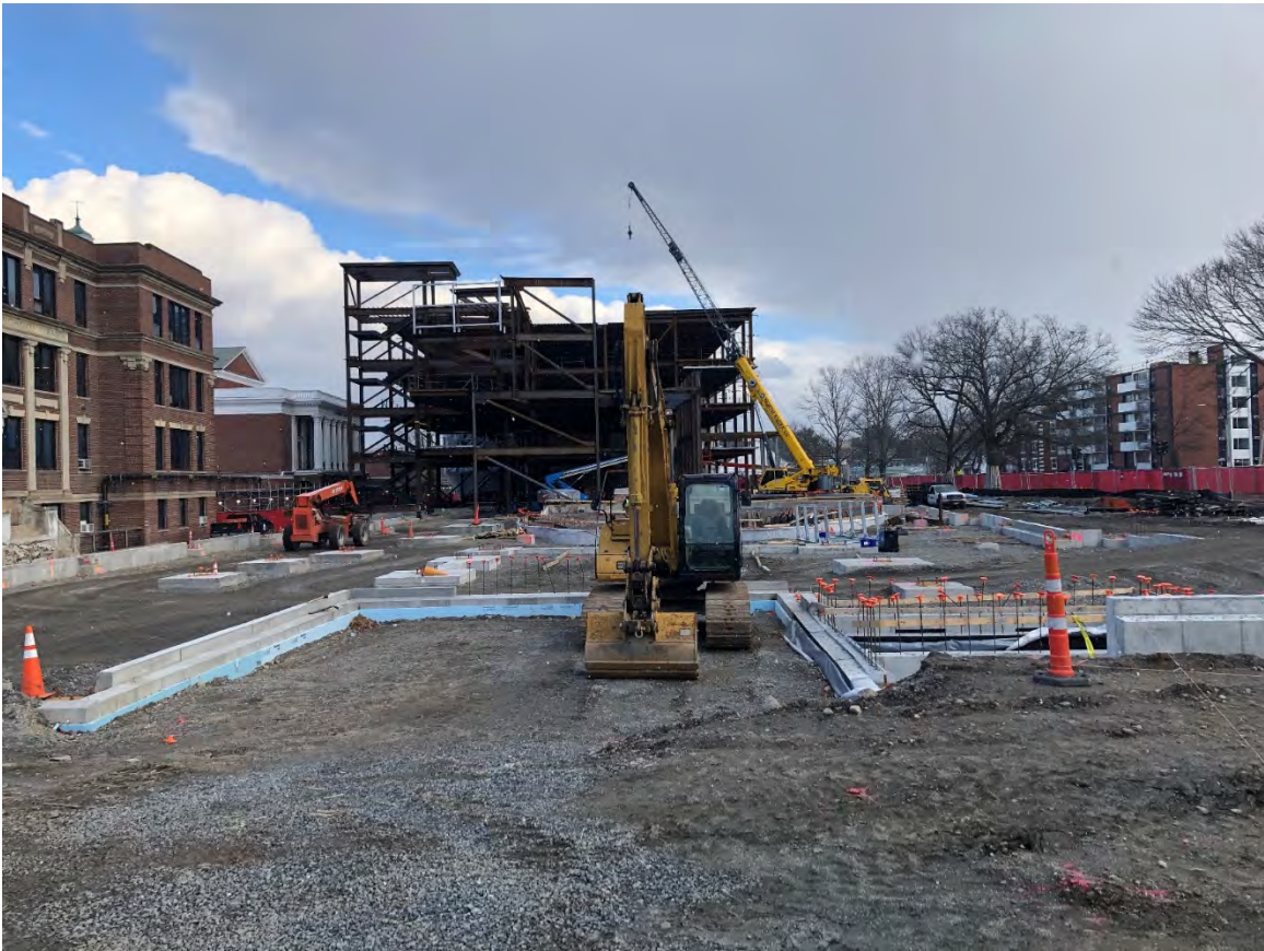
Photograph 3: Building D Steel Erection progress photo