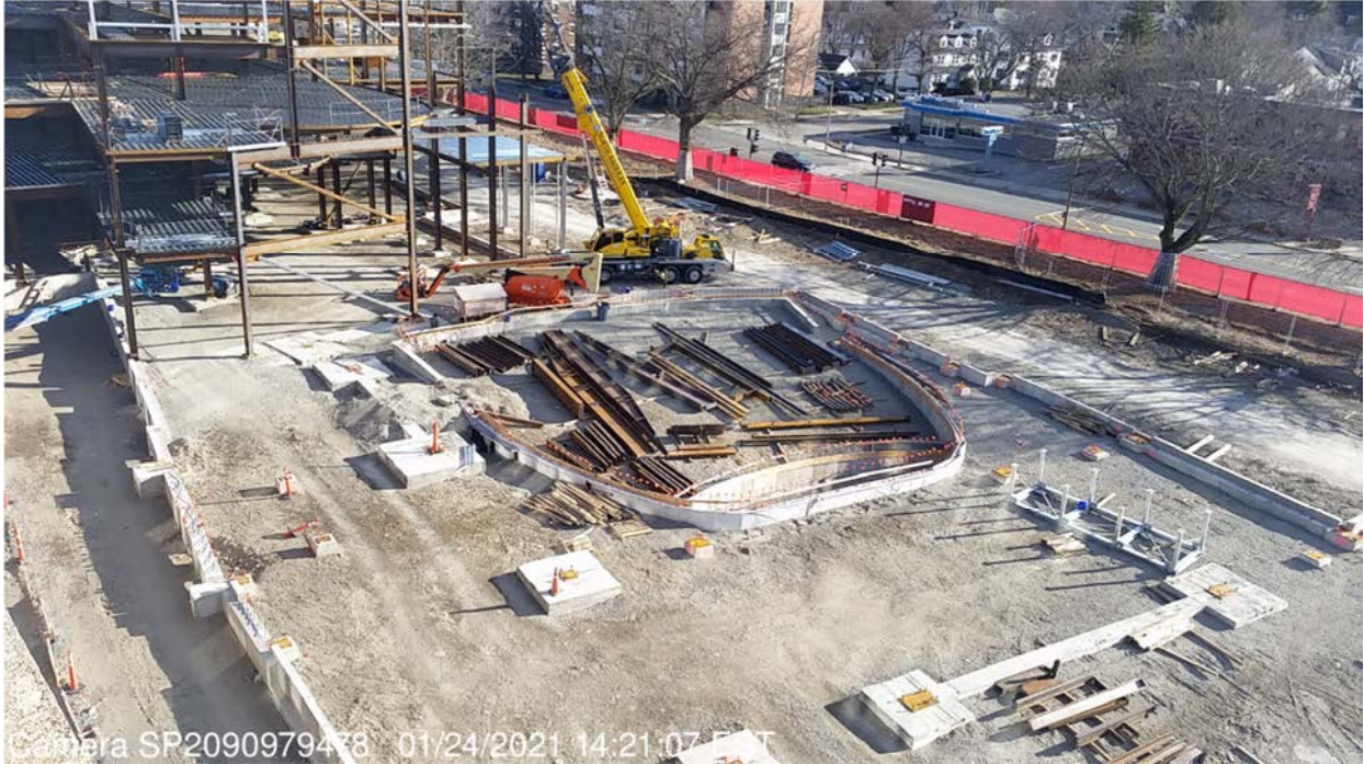
Photograph 1: Fusco Camera Aerial View of the Site