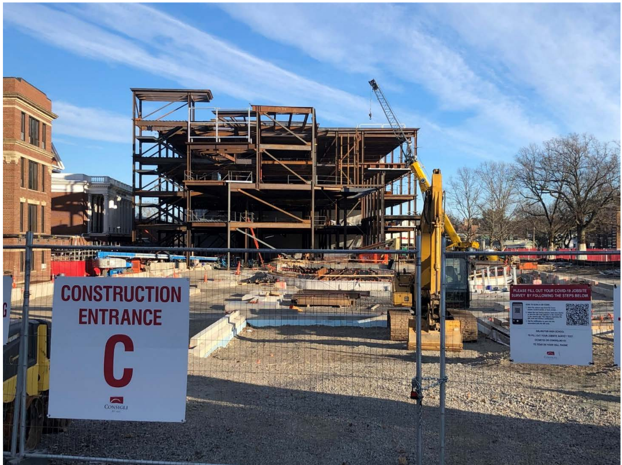
Photograph 3: Building D Steel Erection progress photo