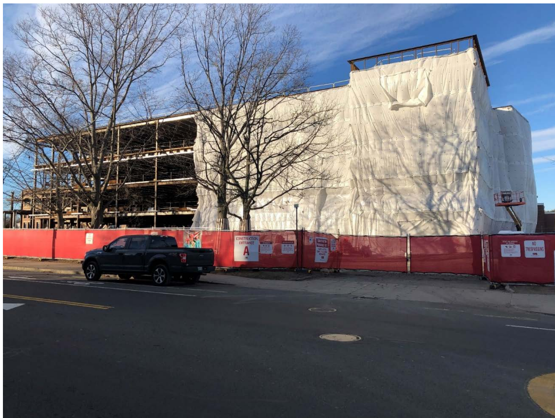
Photograph 2: Building D Steel Erection progress photo from Mass. Ave.