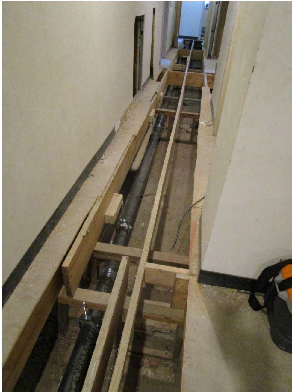
Floor deck removal for access to Ground Floor crawlspace.