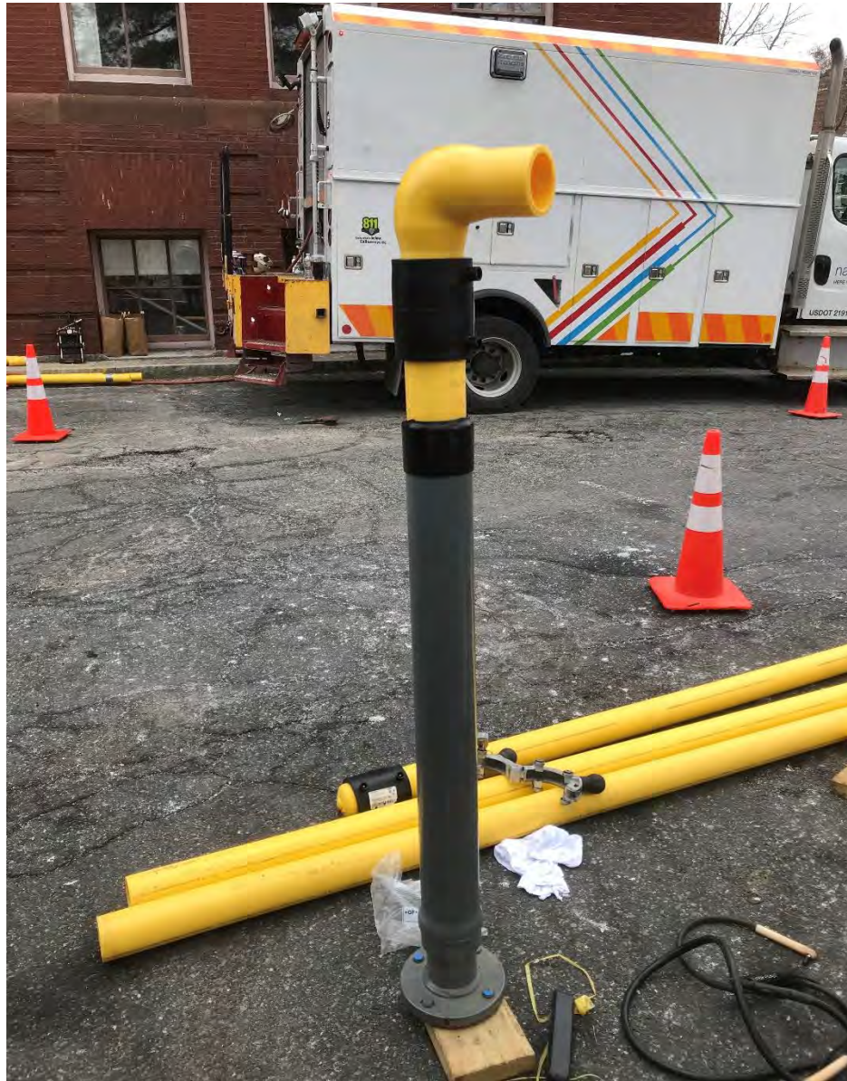
NGrid Gas prefabricating new gas service line for north entry