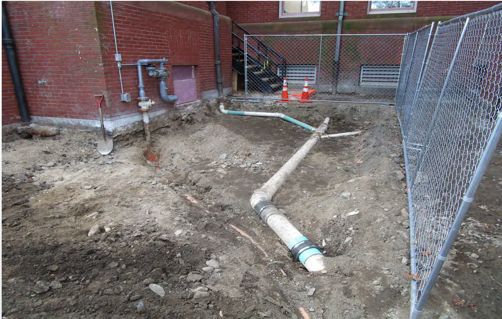
North entry with shallow gas line and gutter downspout drain piping conflicts