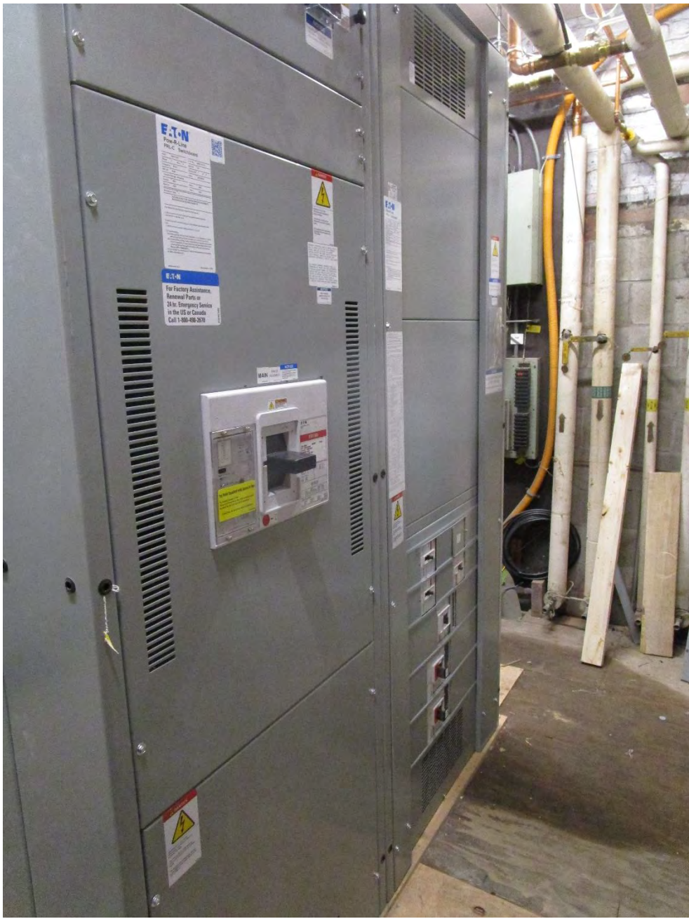
New switchgear panel