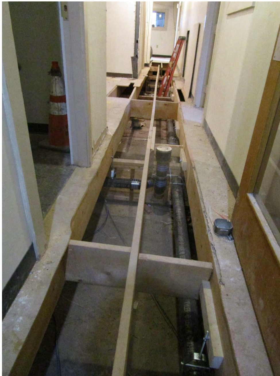
Floor deck removal for access to Ground Floor crawlspace.