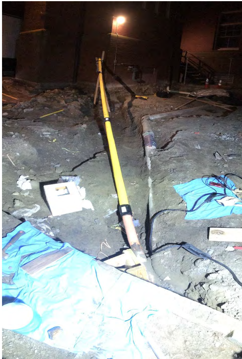
NGrid Gas installing new gas service and piping