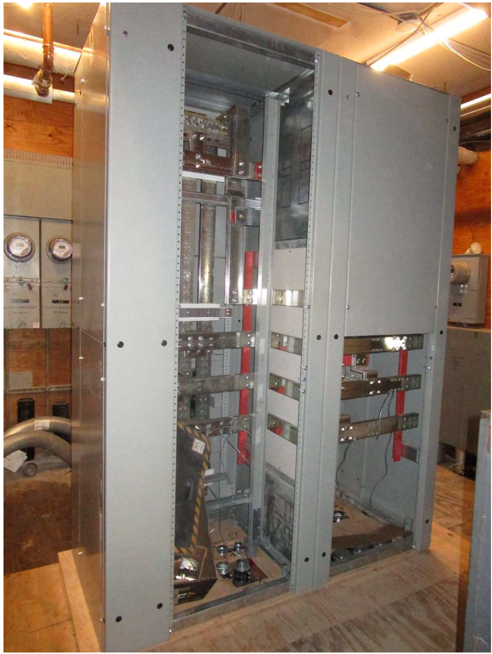
New switchgear panel