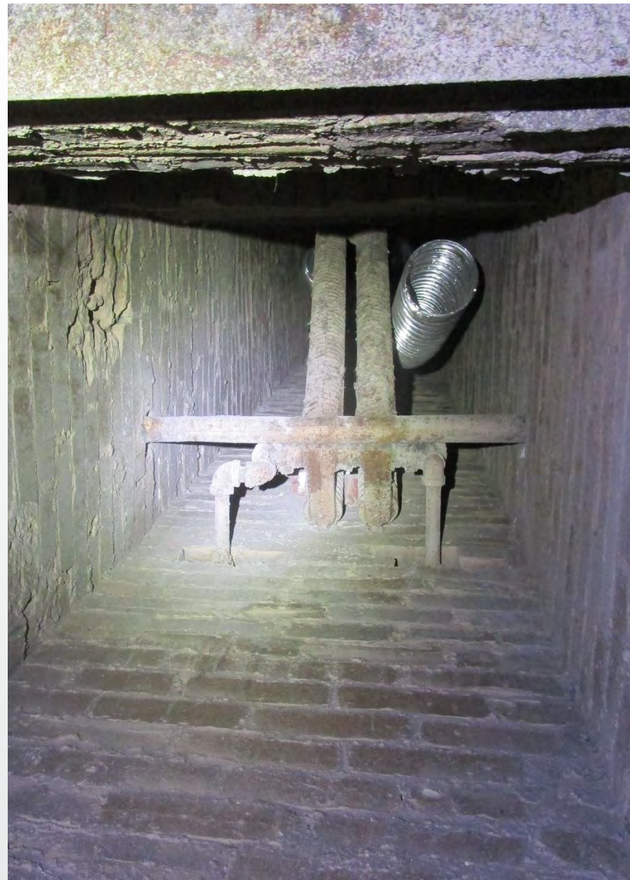
Abandoned steam radiator obstruction in Chimney B flue