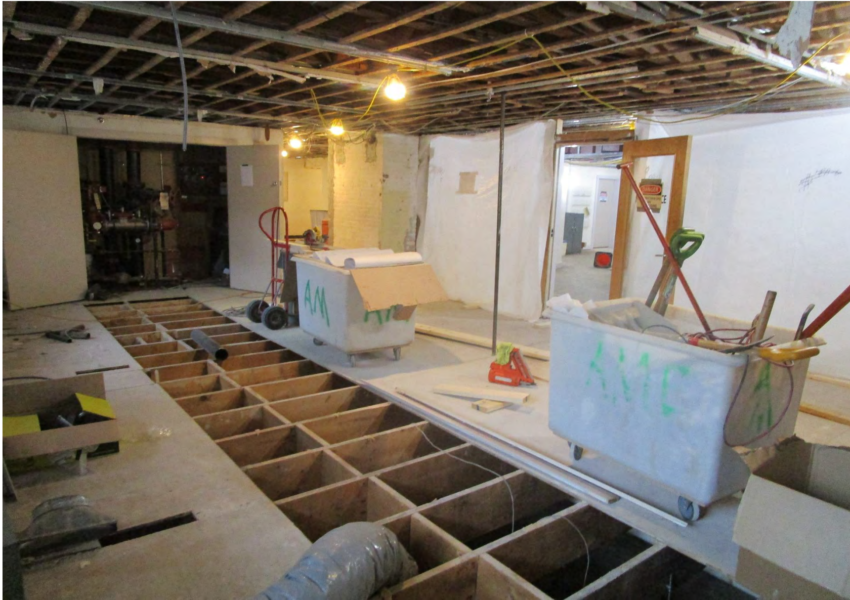
Floor deck removal for access to Ground Floor crawlspace.