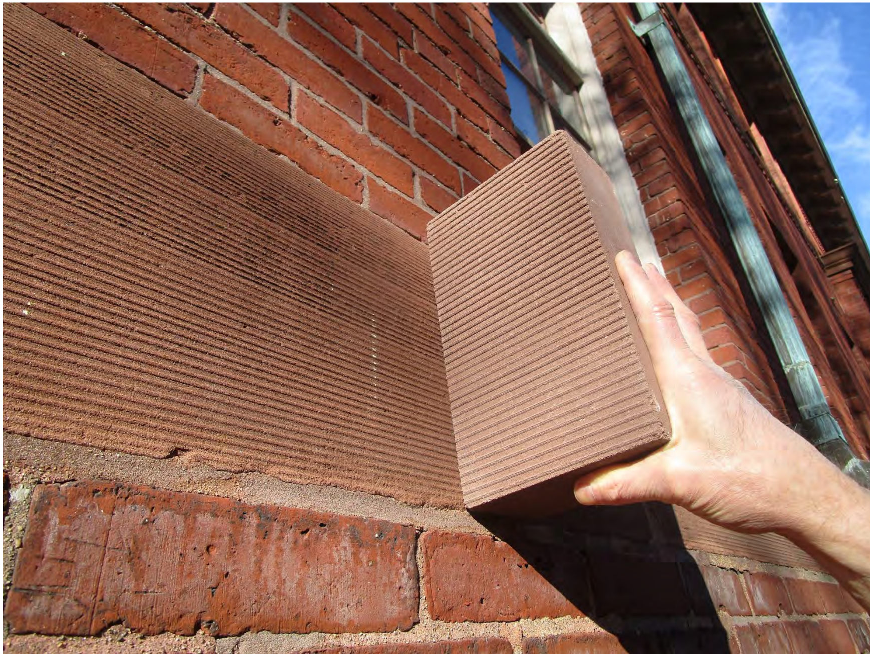
Precast stone sample with mis-matched fluting.