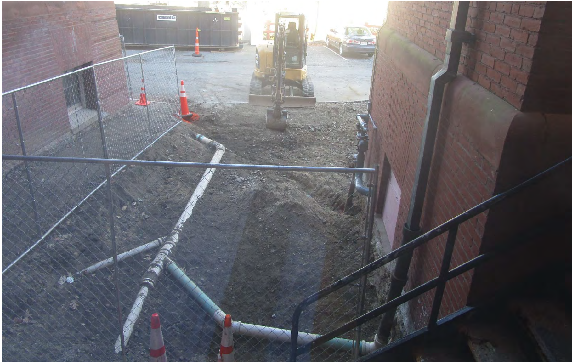
North entry with shallow gas line and gutter downspout drain piping conflicts