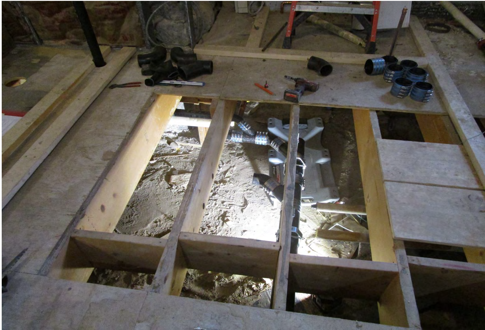
Floor deck removal for access to Ground Floor crawlspace.