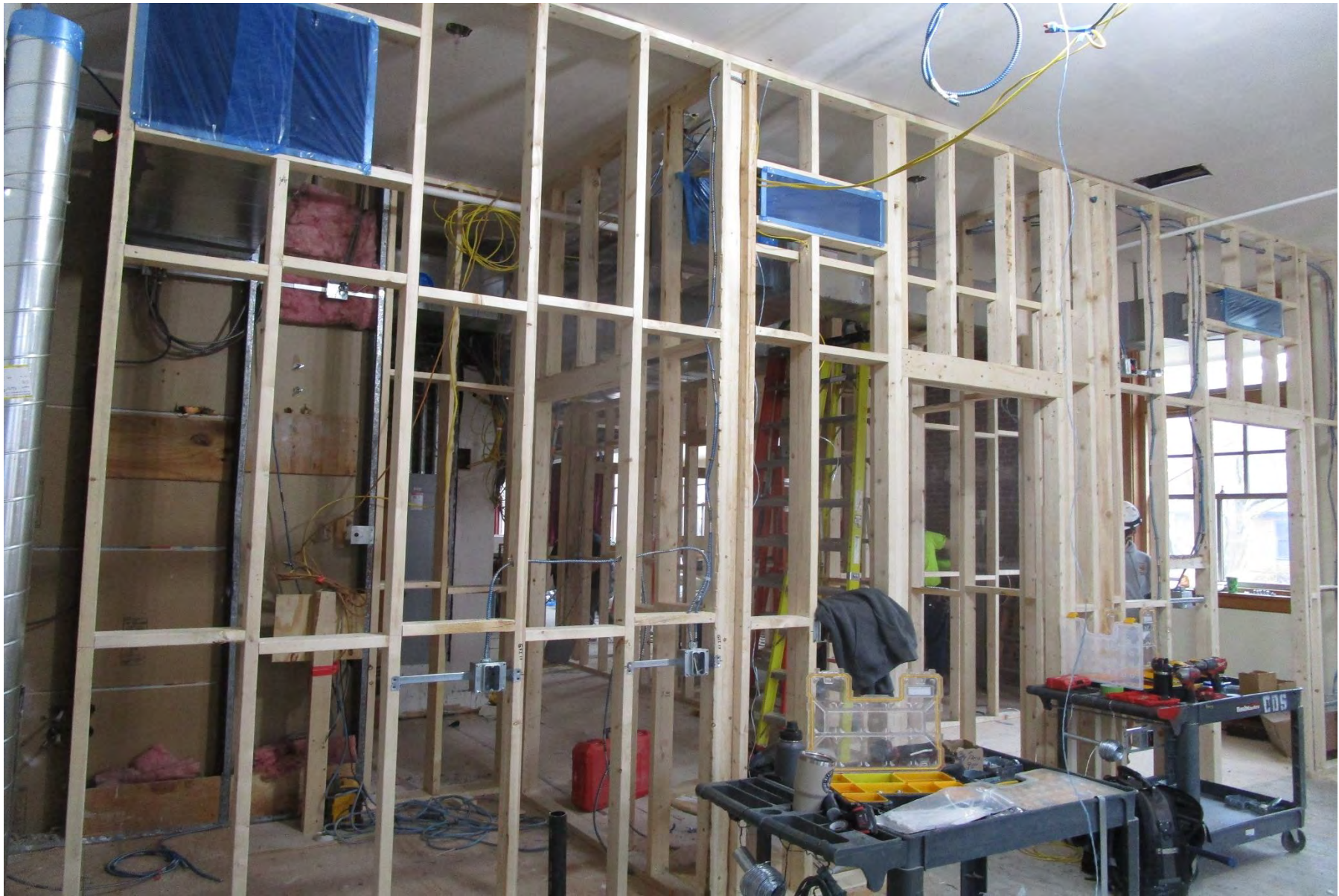
New wall framing on 1 st floor