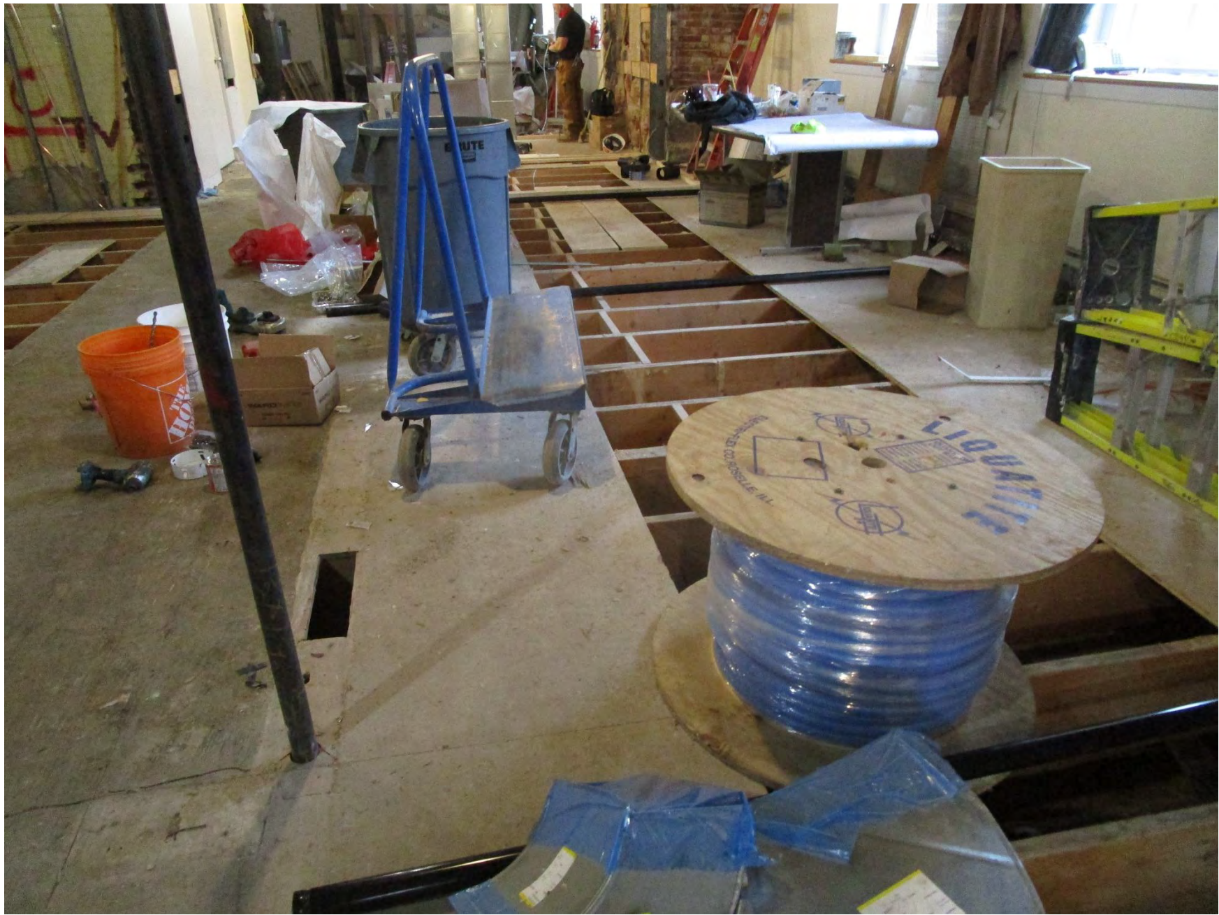
Floor deck removal for access to Ground Floor crawlspace.