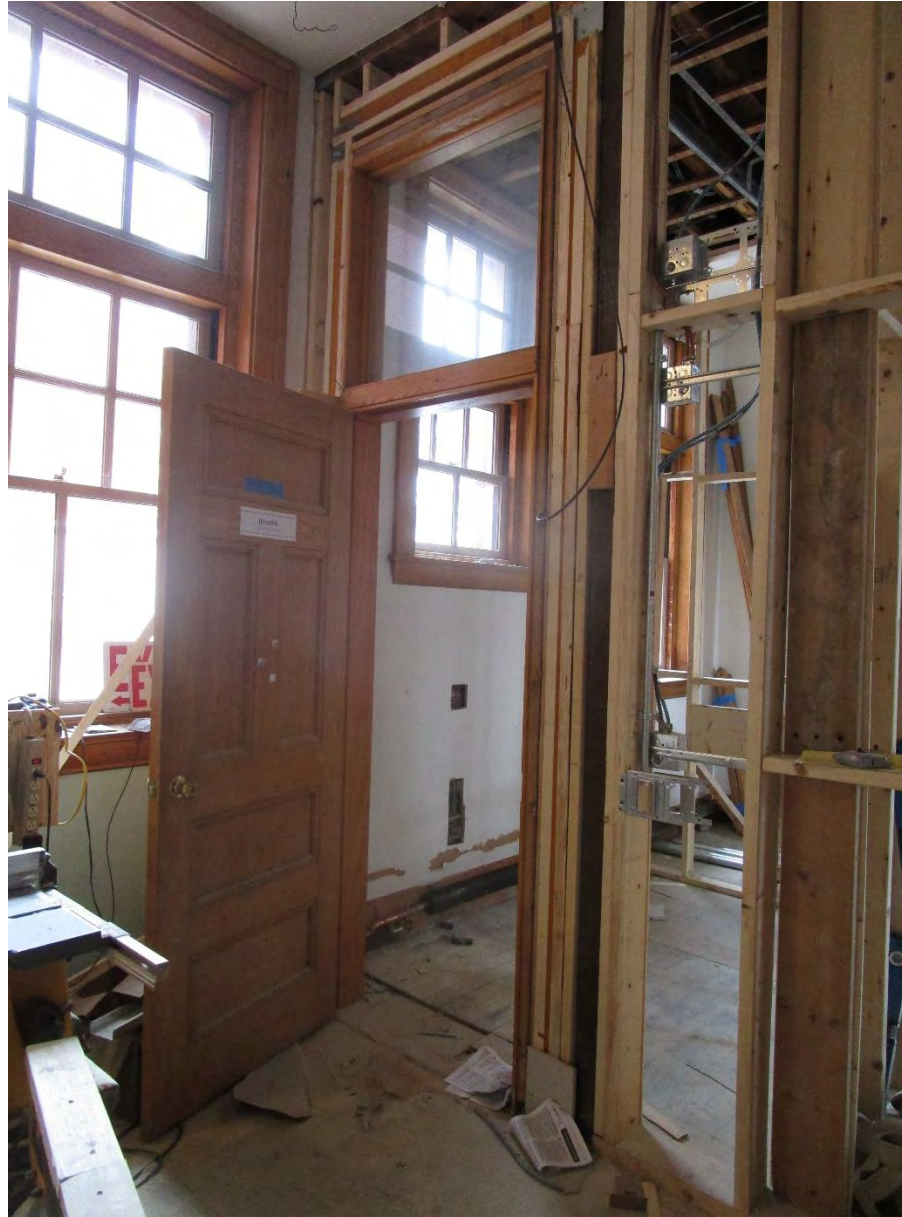
Reuse of existing door and frame in new framed wall of 1 st floor. New framing required vertical shim due to throat width of door frame.