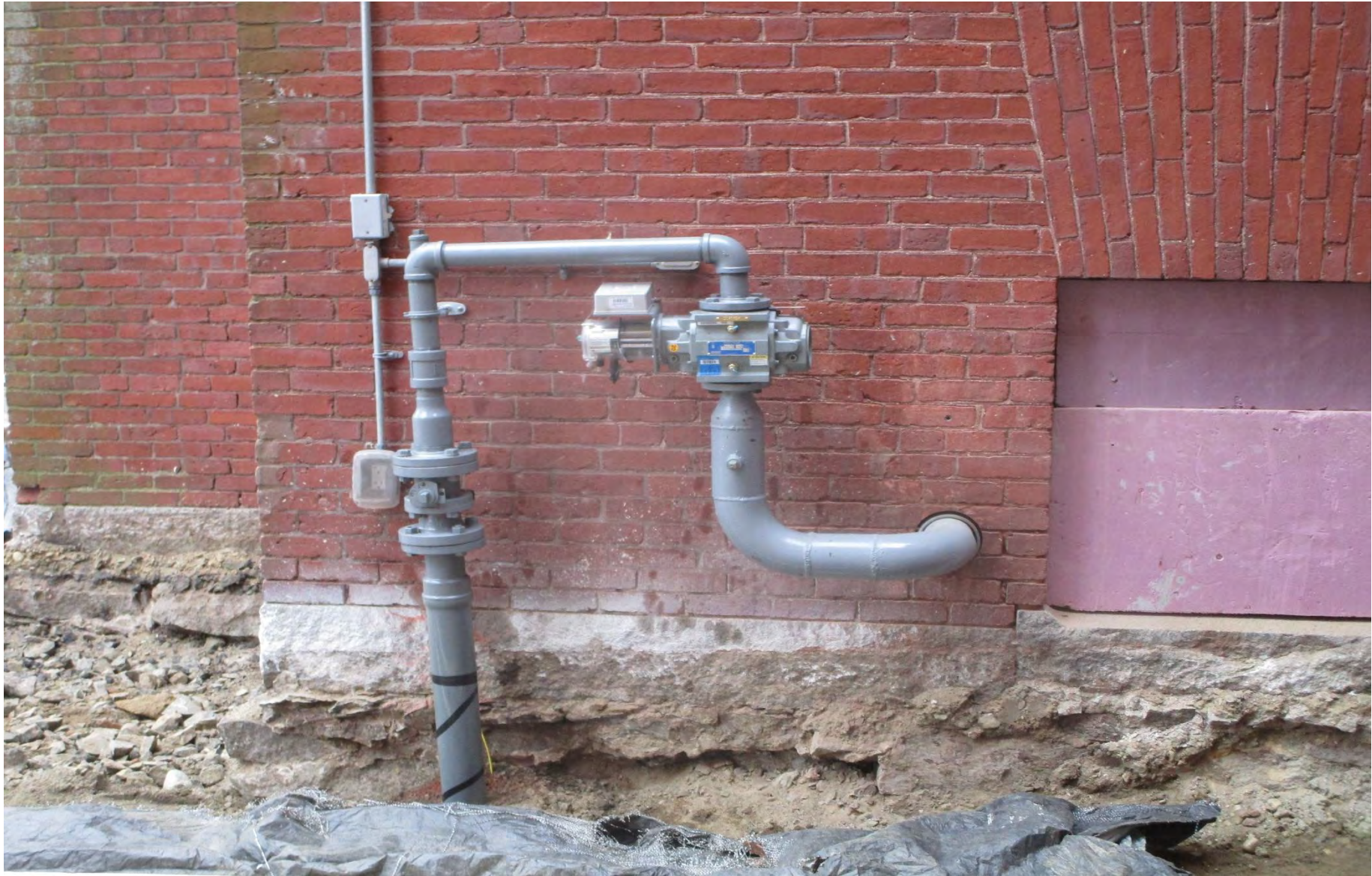
New gas meter