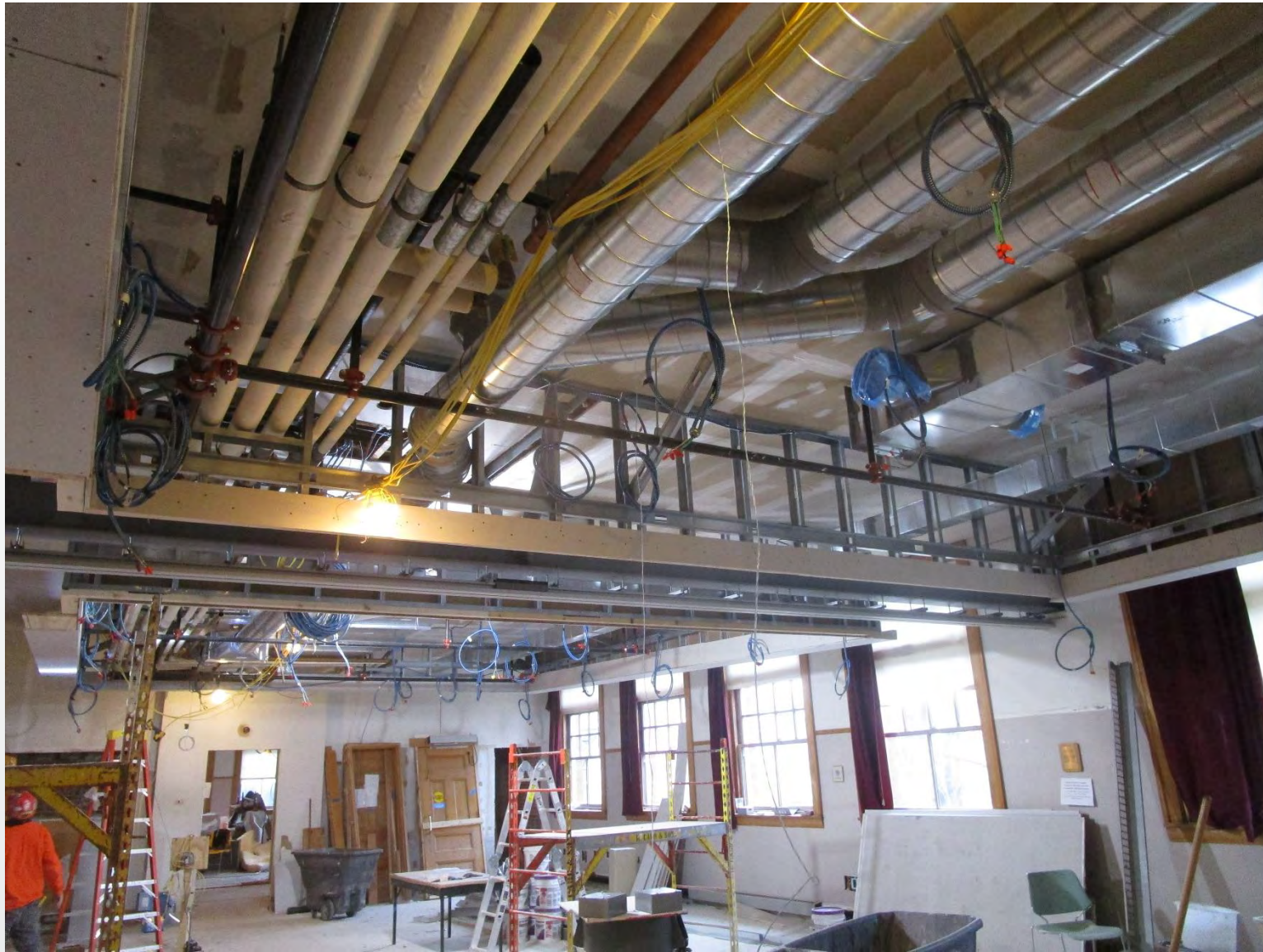
Utility installation at ceiling in multipurpose room on 1 st floor.