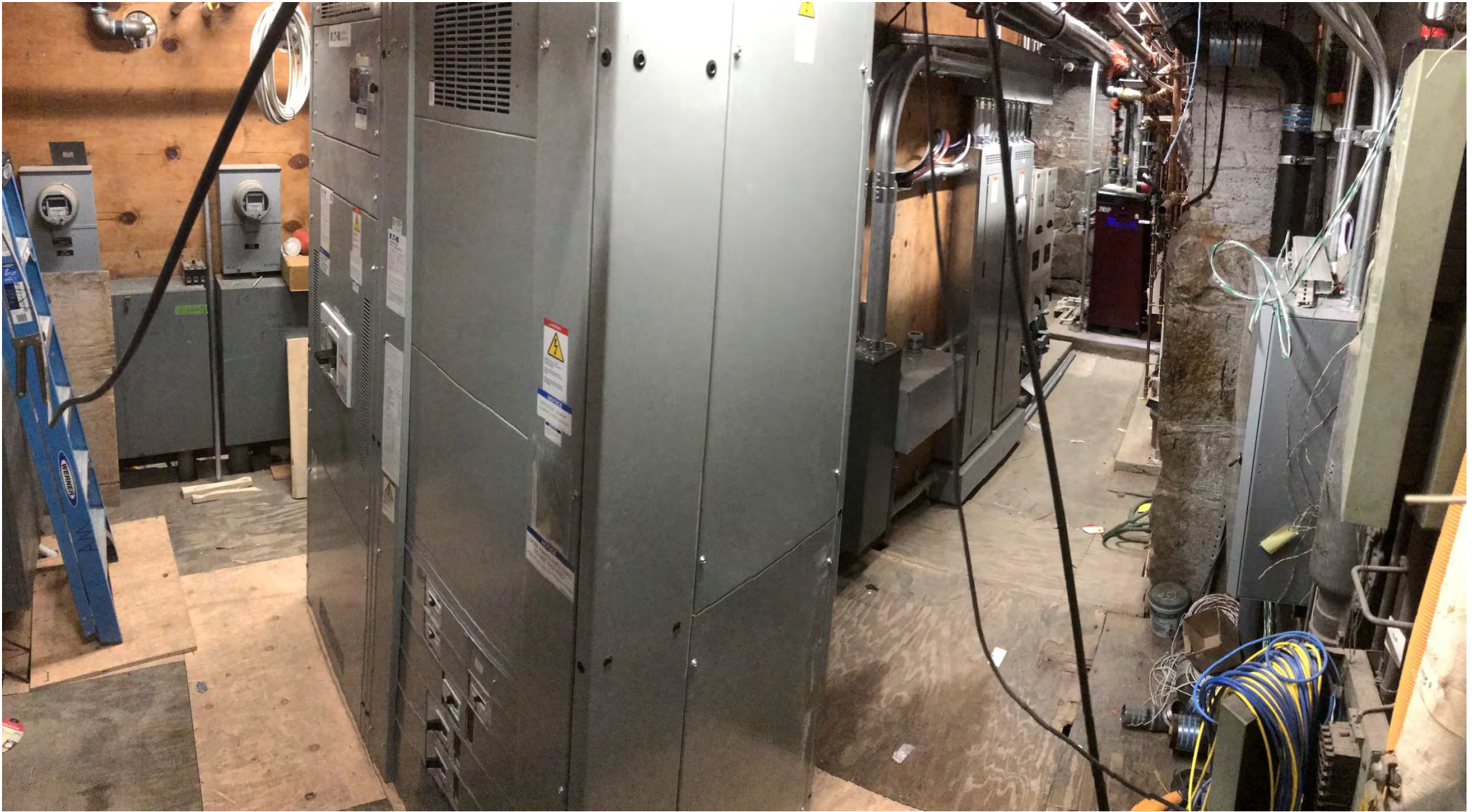
Panoramic view of switchgear panels, electric panels and boilers.