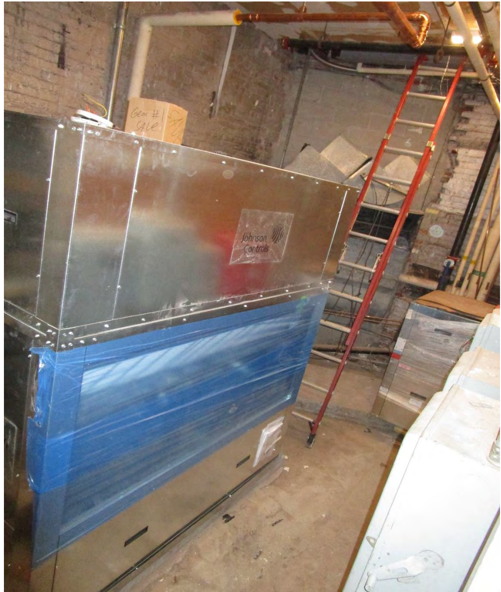
HV units in Basement mechanical room