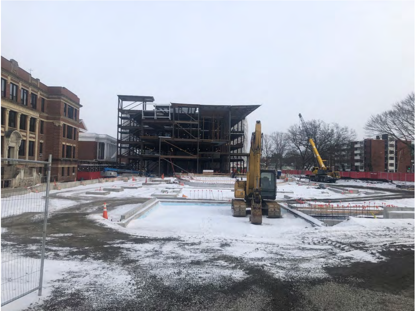
Photograph 3: Building D Steel Erection progress photo