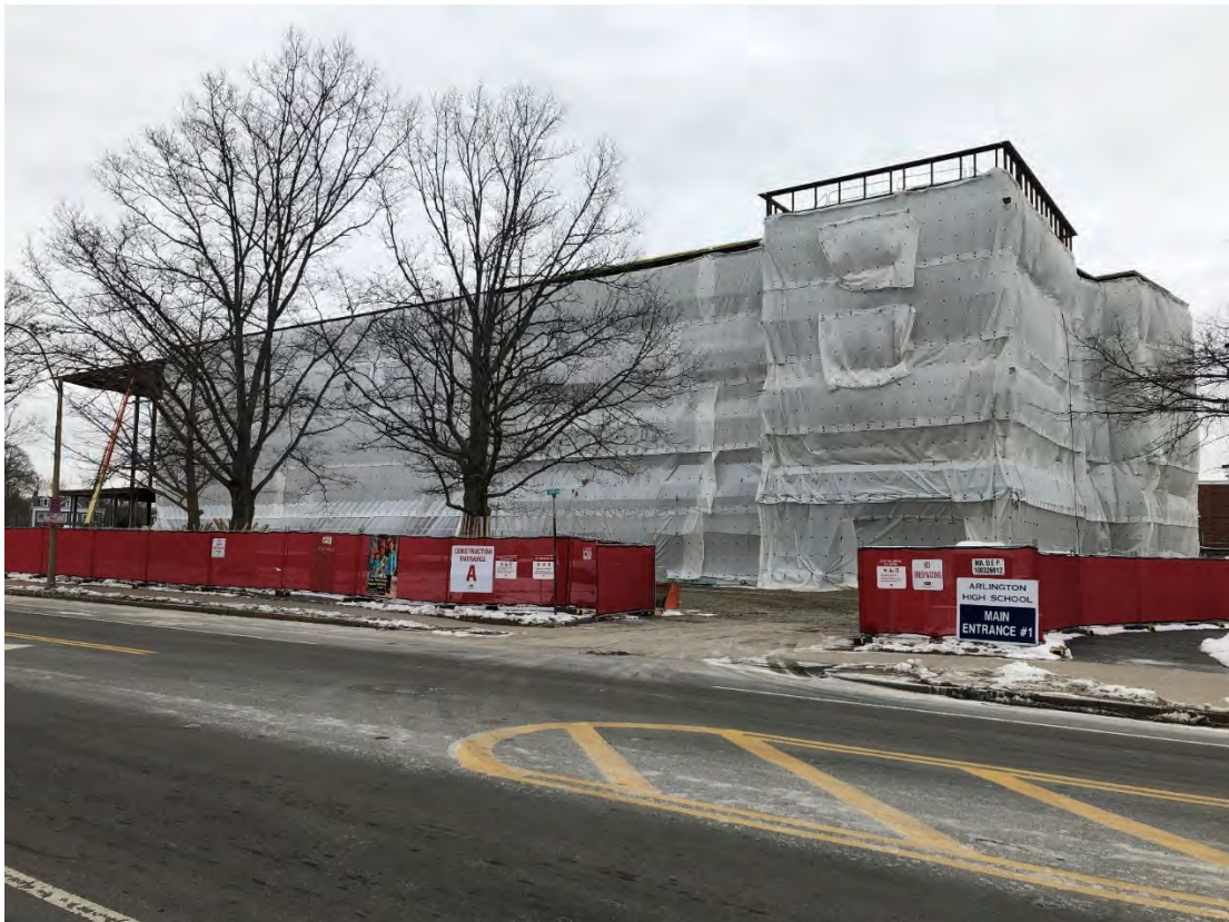
Photograph 2: Building D Steel Erection progress photo from Mass Ave