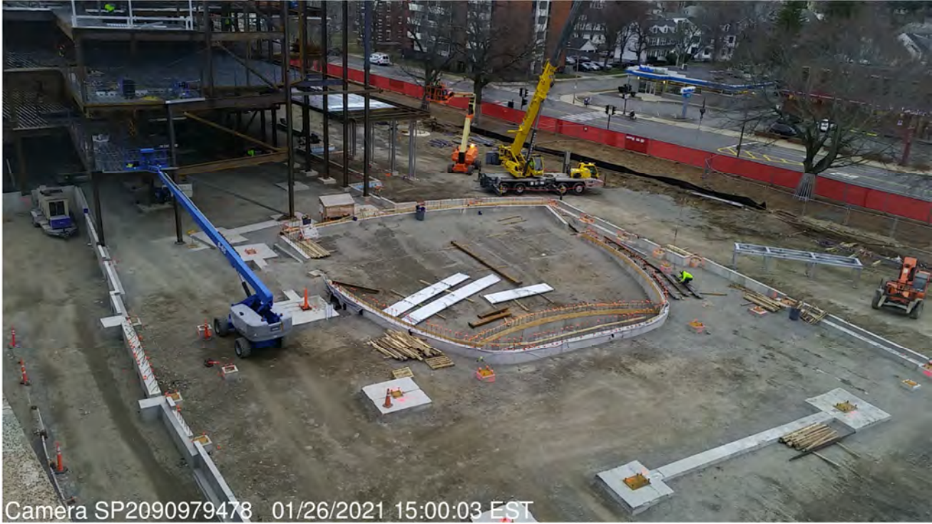
Photograph 1: Fusco Camera Aerial View of the Site