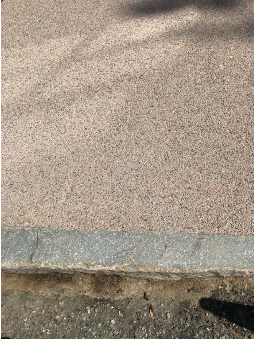
Fig. 1: Image showing appearance of exposed aggregate concrete pad at Academy St. Entrance to Arlington Town Hall.