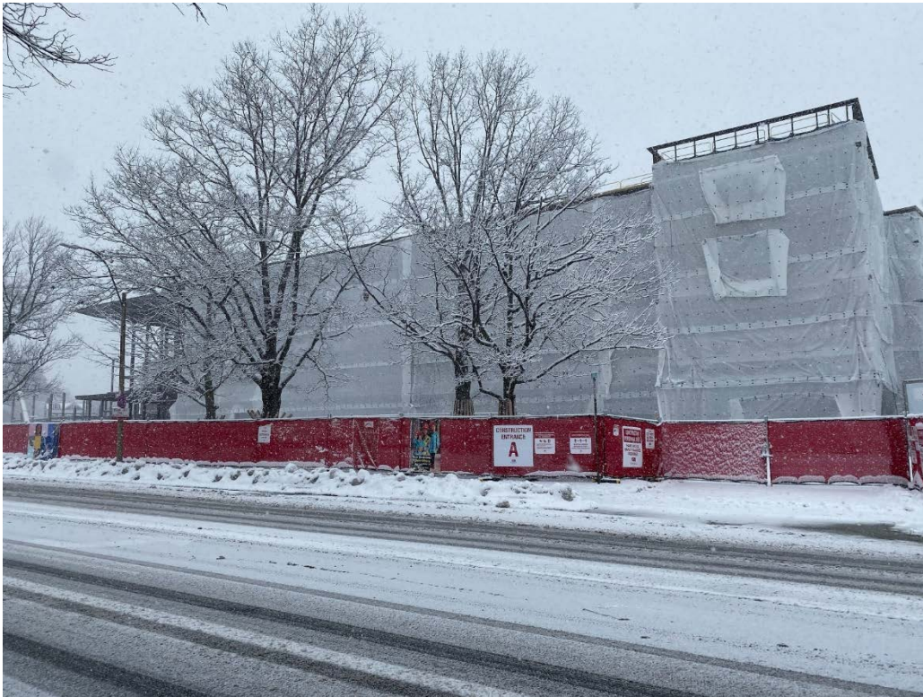
Photograph 2: Building D Steel Erection progress photo from Mass Ave