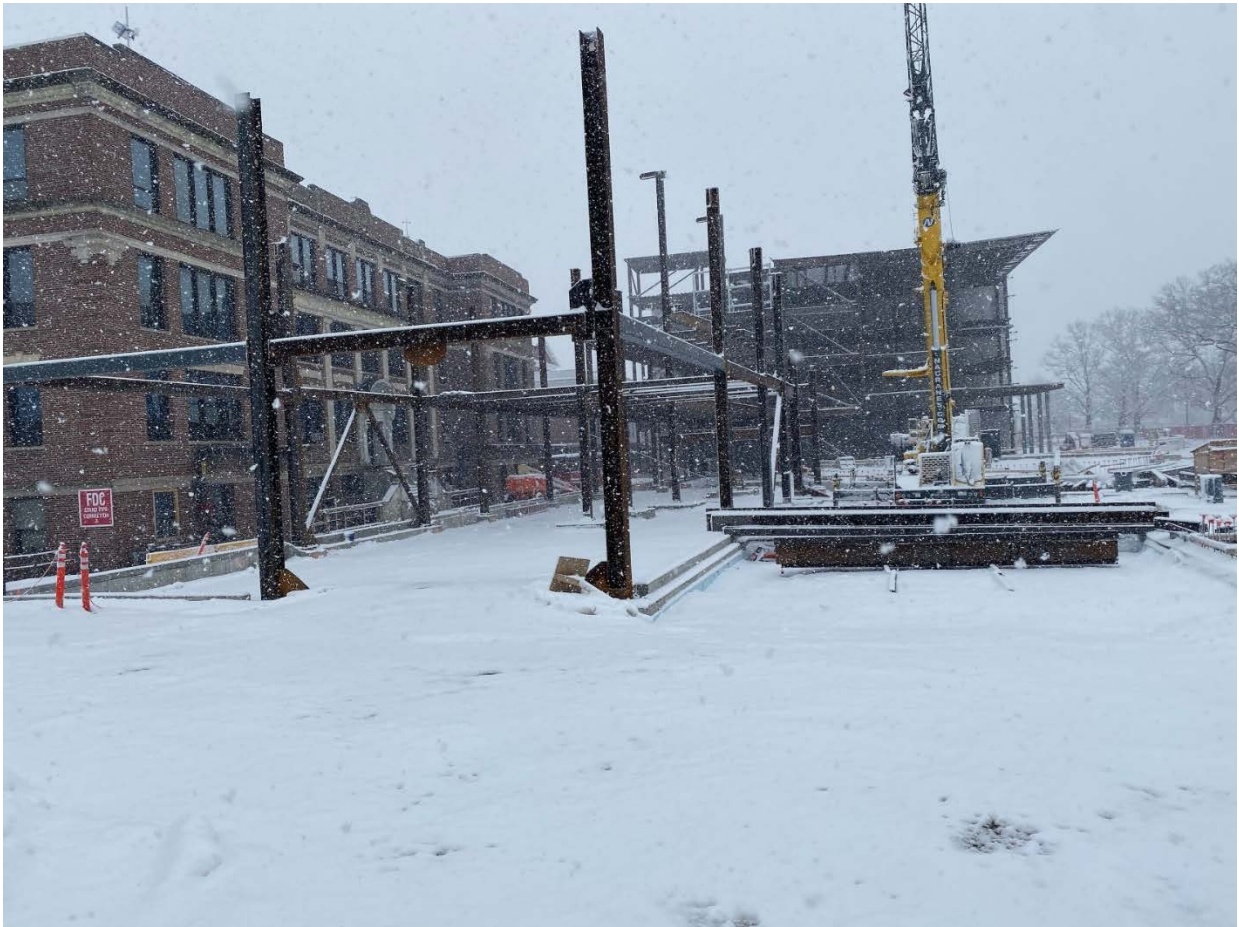
Photograph 3: Building E Steel Erection progress photo