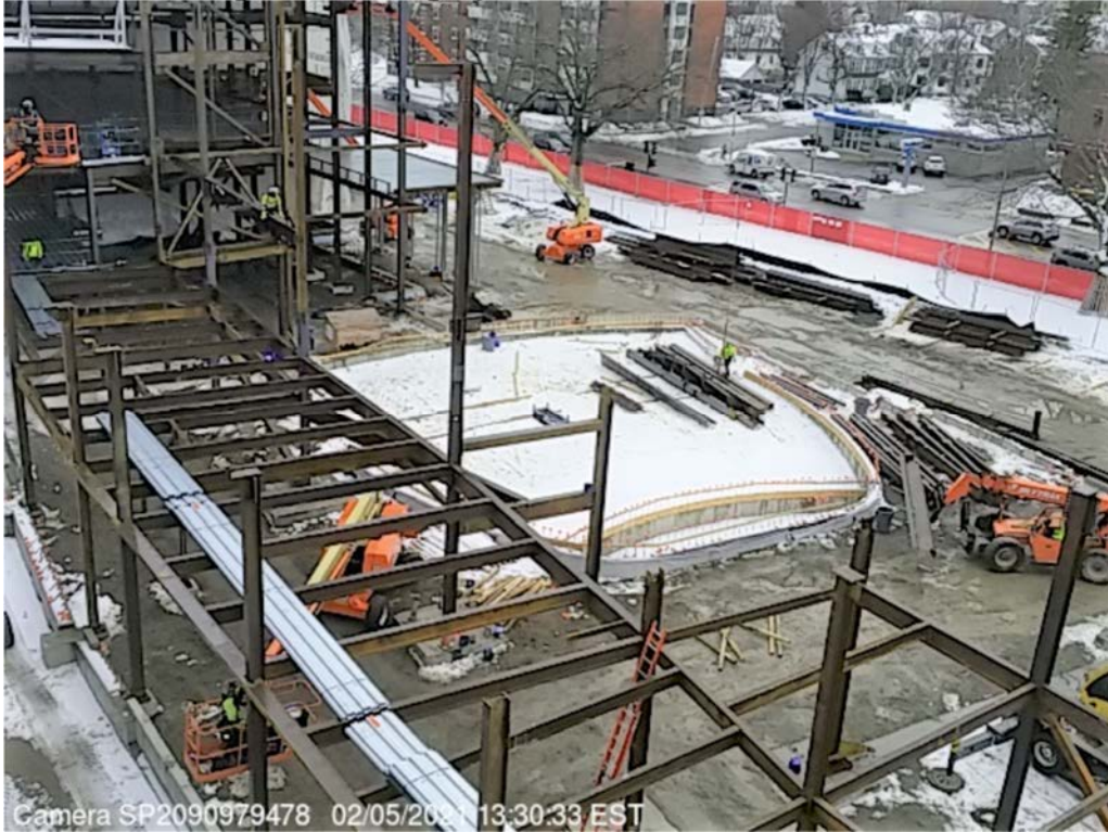
Photograph 1: Fusco Camera Aerial View of the Site