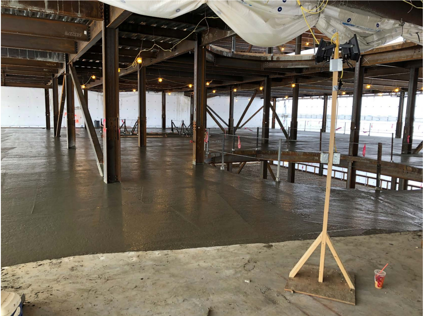
Photograph 4: Concrete Slab Placements