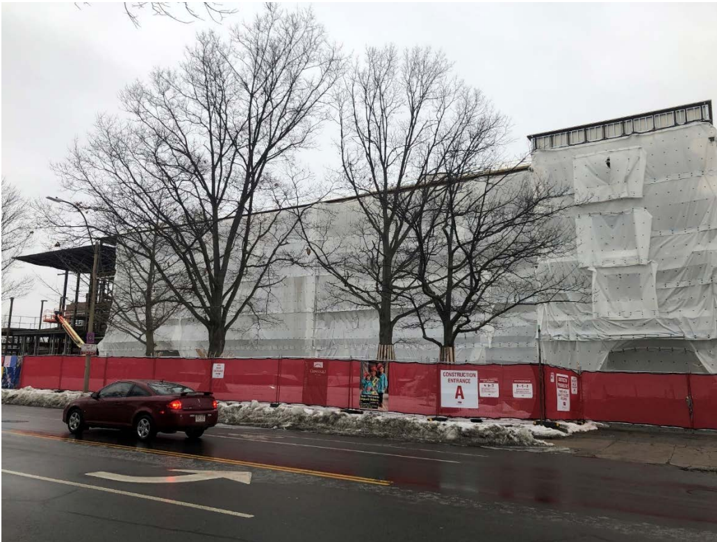
Photograph 2: Building D Steel Erection progress photo from Mass Ave