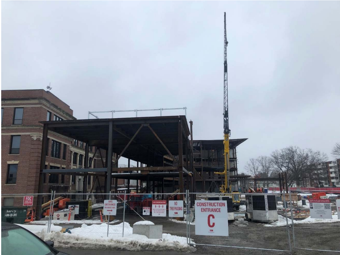
Photograph 3: Building E Steel Erection progress photo