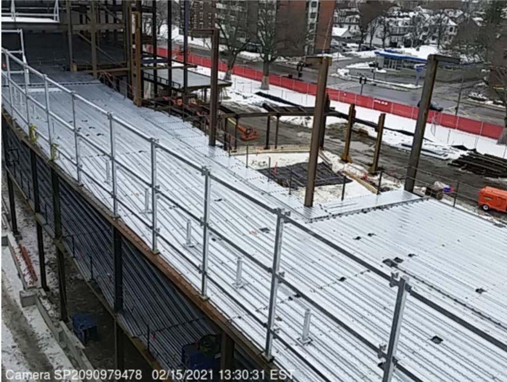
Photograph 1: Fusco Camera Aerial View of the Site