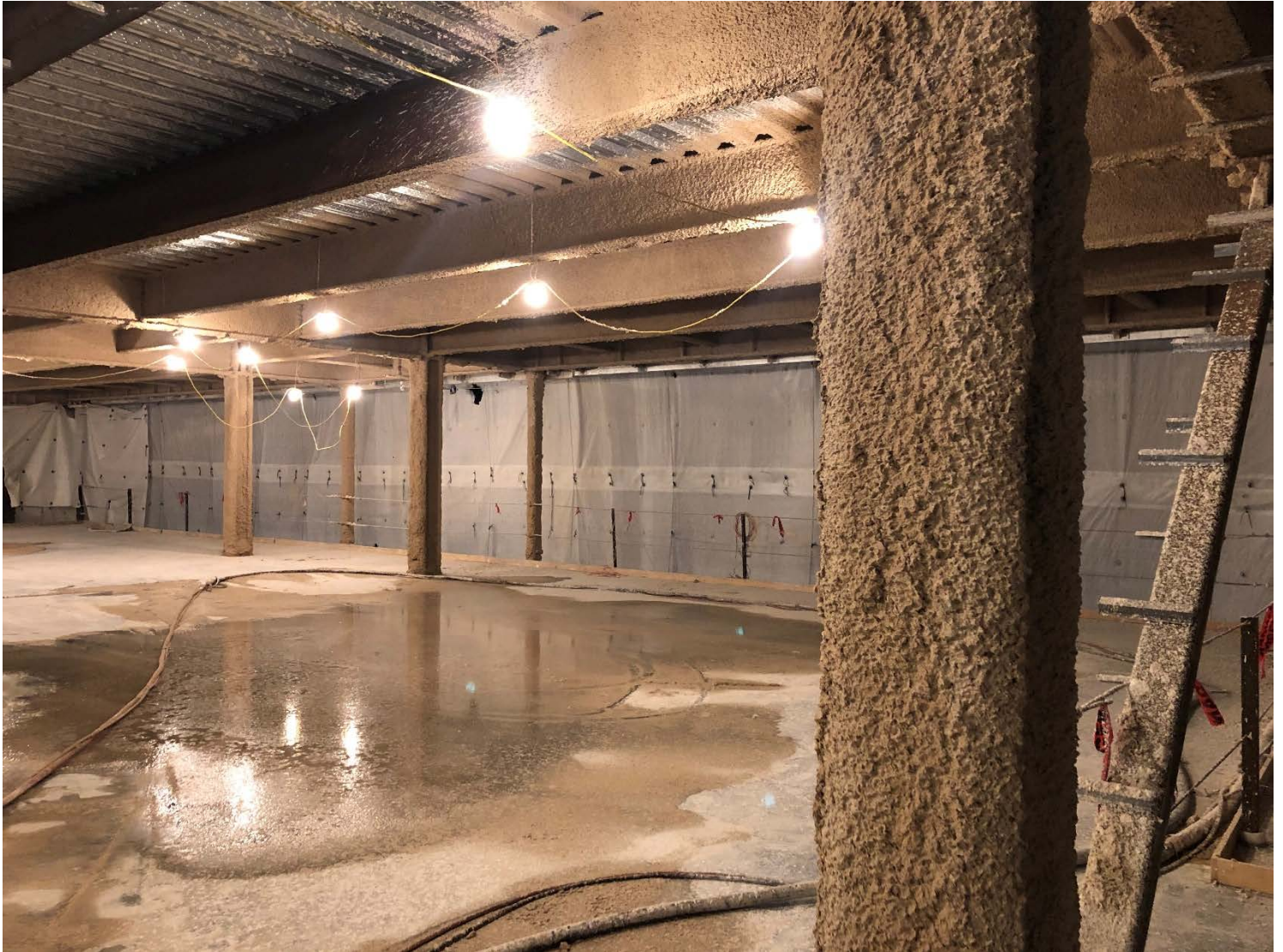
Photograph 5: Fire Proofing Steel Columns