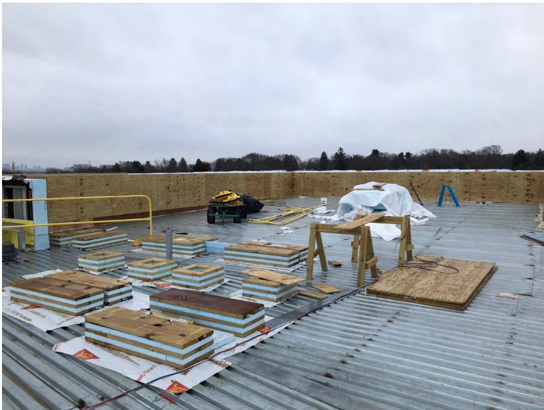
Photograph 4: Parapet Framing and Sheathing