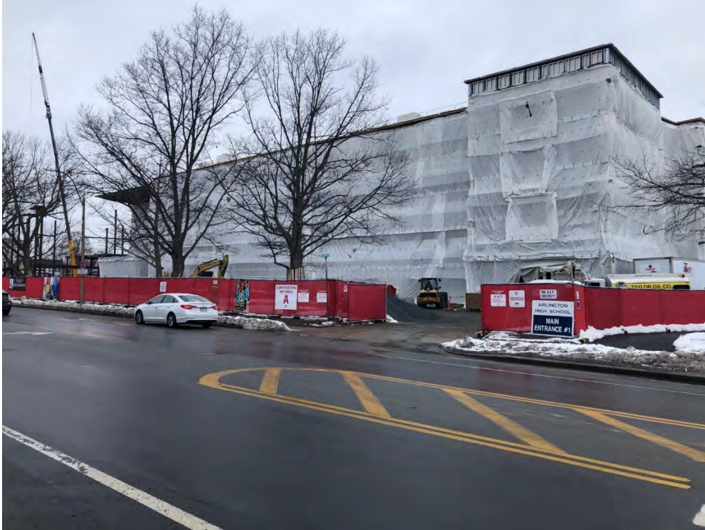
Photograph 1: Building D Steel Erection progress photo from Mass Ave