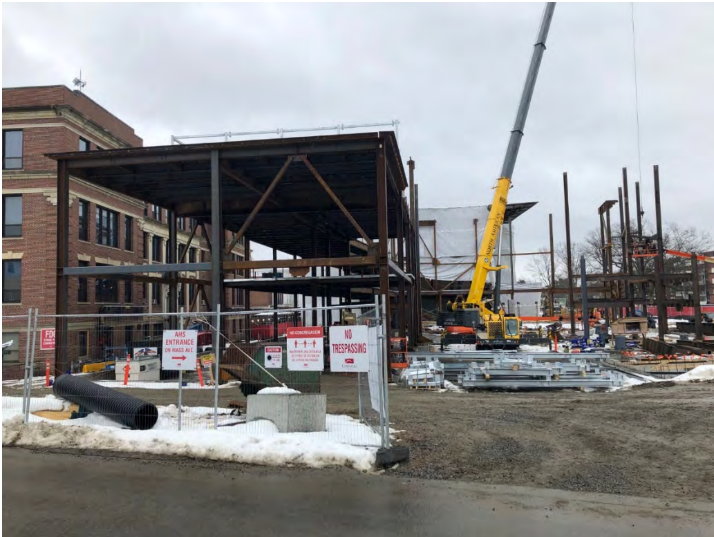
Photograph 2: Building E Steel Erection progress photo