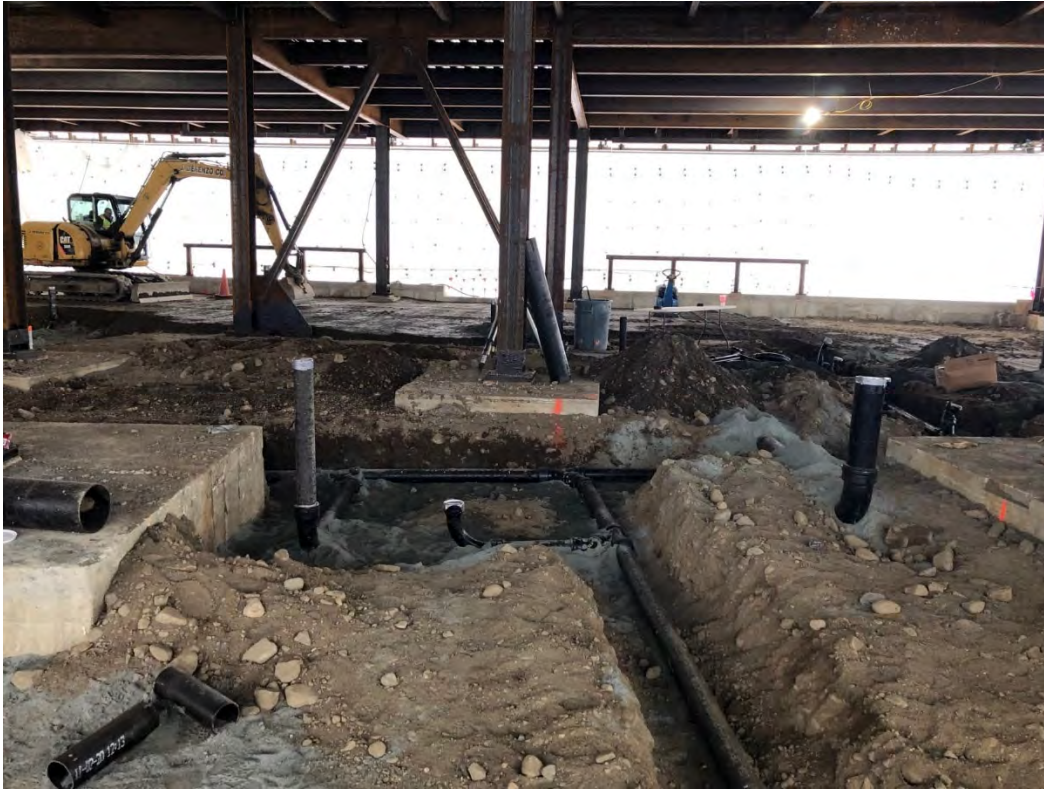
Photograph 3: Underground Utility Installation