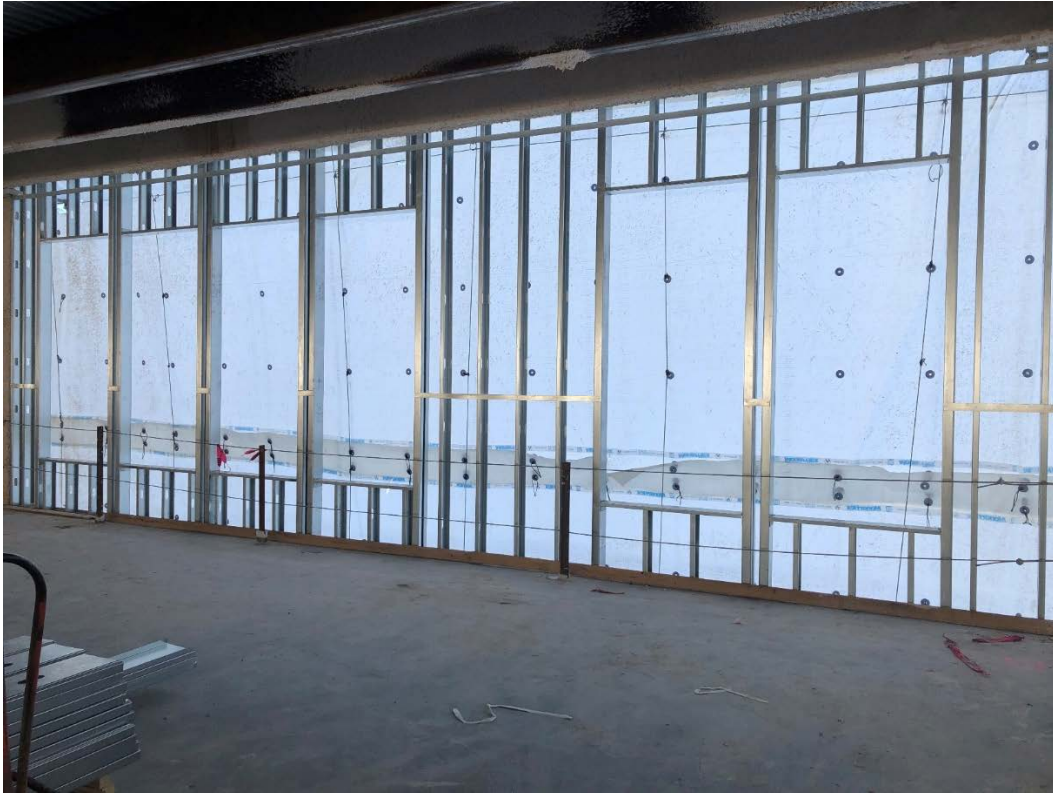
Photograph 3: 4 th Floor Exterior Framing