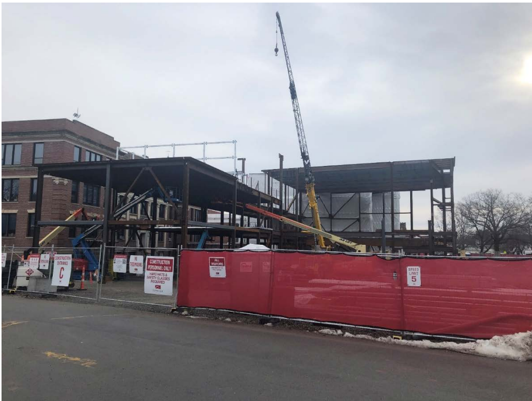
Photograph 2: Building E Steel Erection progress photo