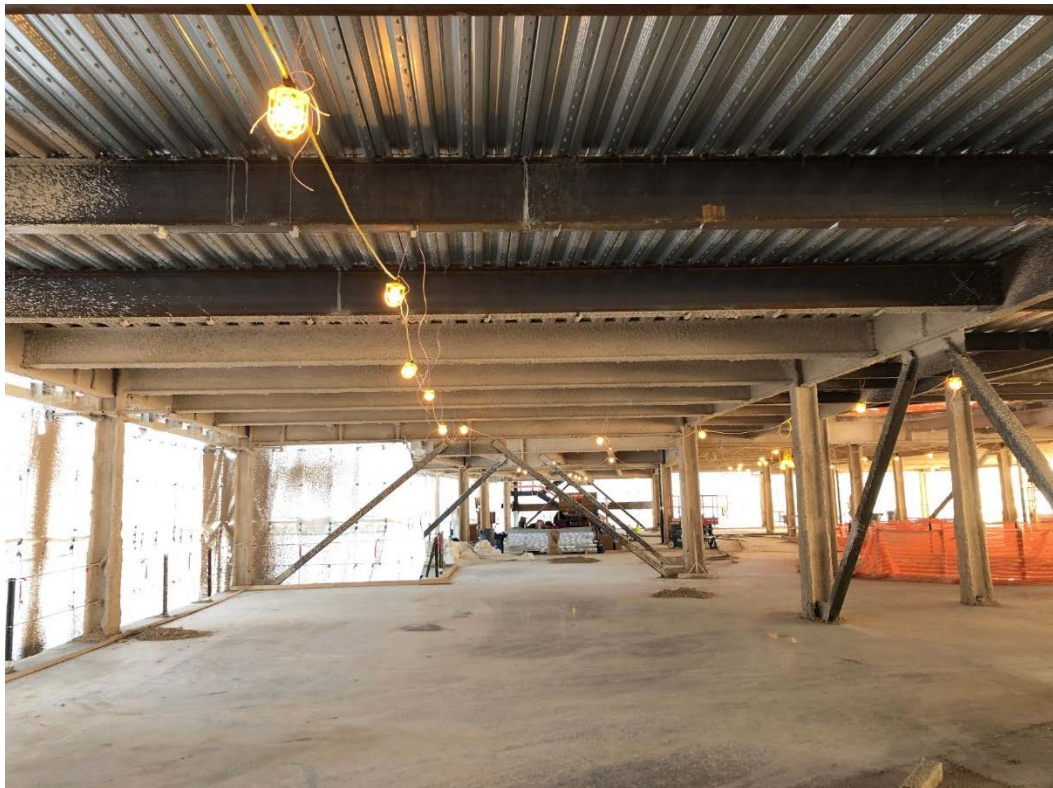
Photograph 5: Spray Fireproofing Level 4 Building D