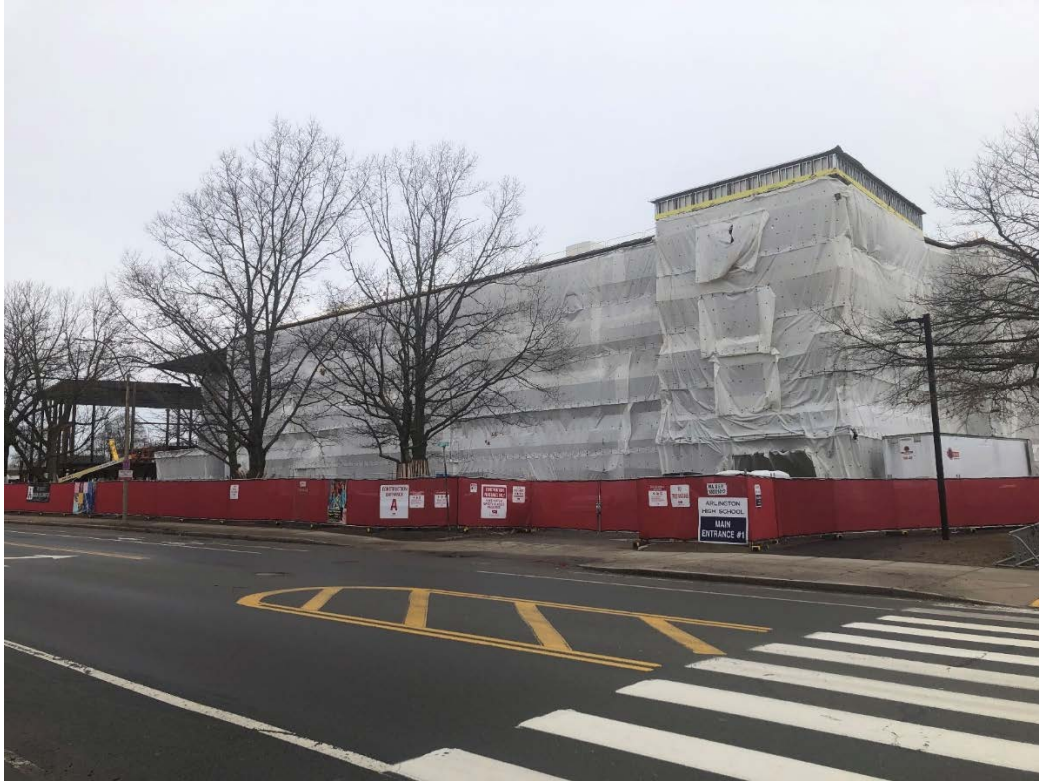
Photograph 1: Building D Steel Erection progress photo from Mass Ave