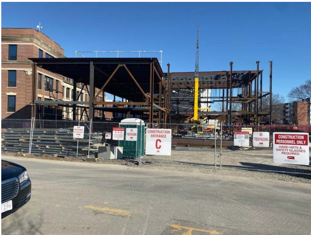
Photograph 2: Building E Steel Erection progress photo