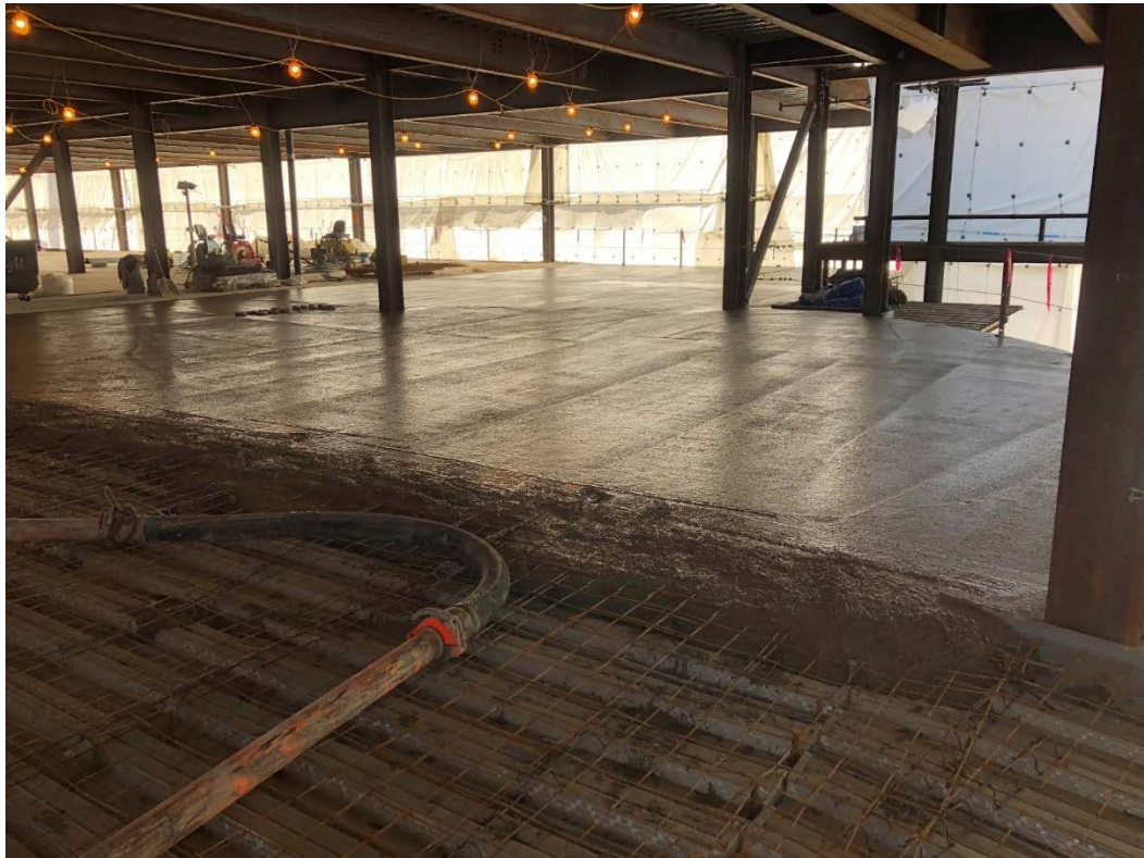
Photograph 4: 4 th floor slab on deck