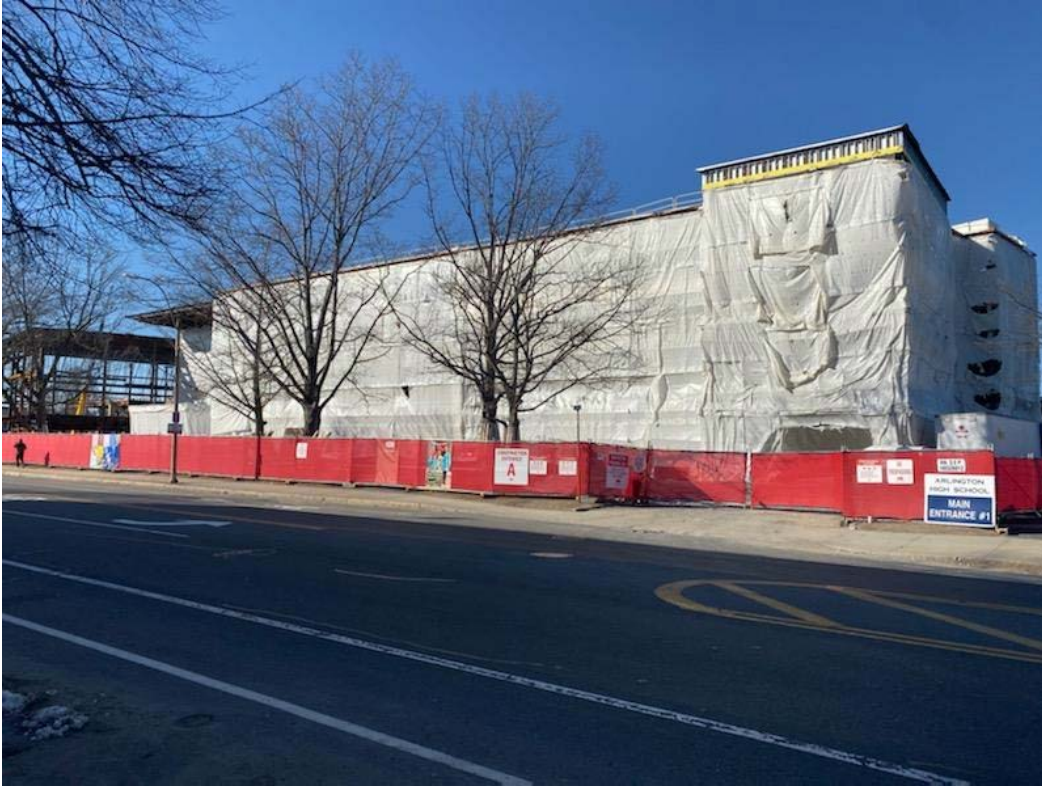
Photograph 1: Building D Steel Erection progress photo from Mass Ave