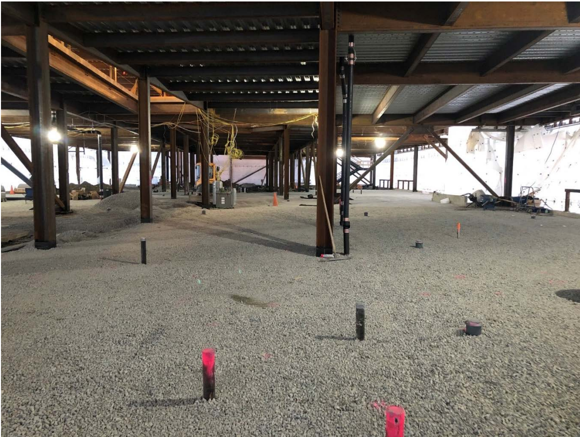
Photograph 5: Building D subgrade and MEP underground installation