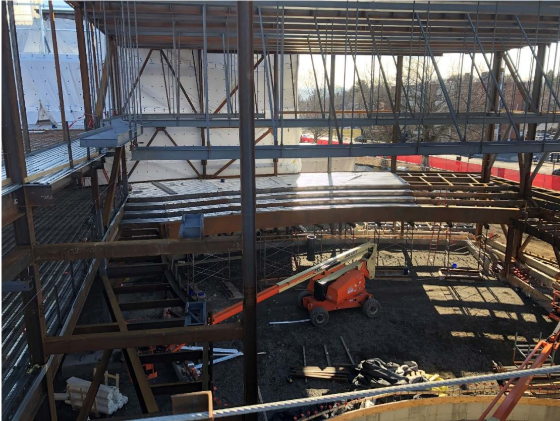
Photograph 3: Interior Auditorium

WEEKLY UPDATE – WEEK OF MARCH 22ND, 2021