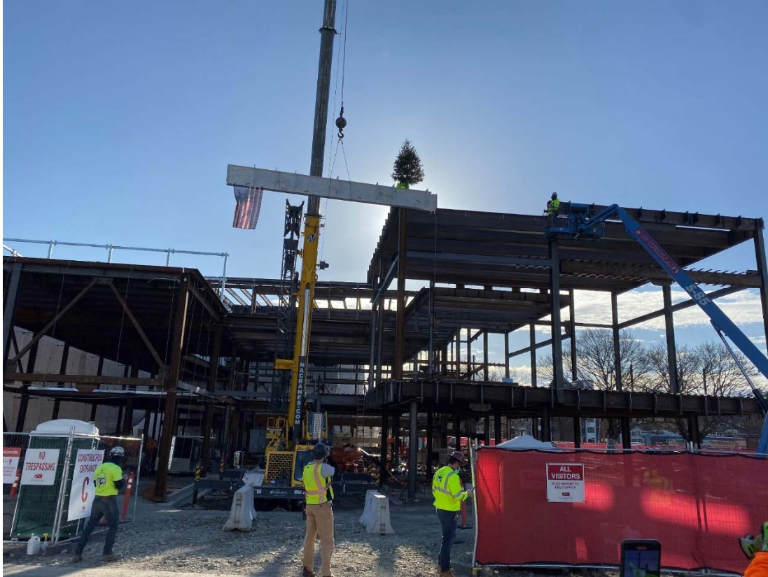
Photograph 1: Installation of Phase 1 Topping of Beam

Progress Photographs – Taken Week of 3/8/2021