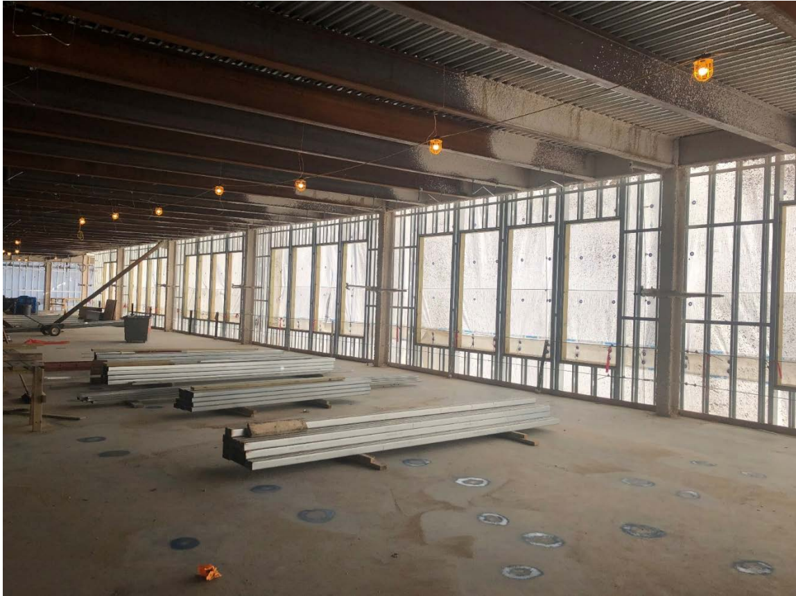
Photograph 6: Exterior Framing on Level 5 Building D