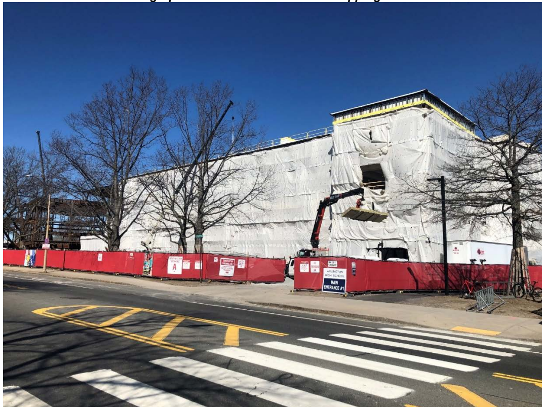
Photograph 2: Phase 1 Progress Photo Shot from Mass Ave