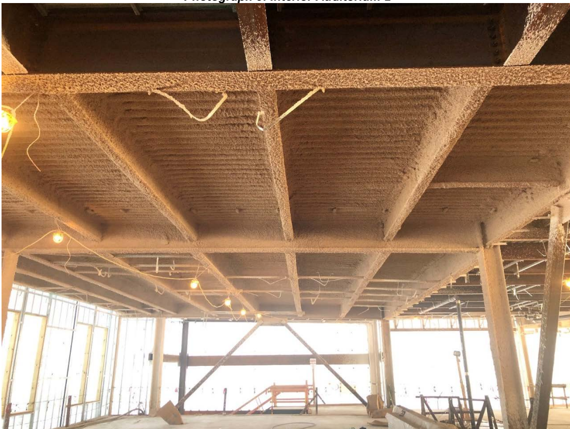
Photograph 5: Interior Spray Fireproofing Applied to Roof Deck