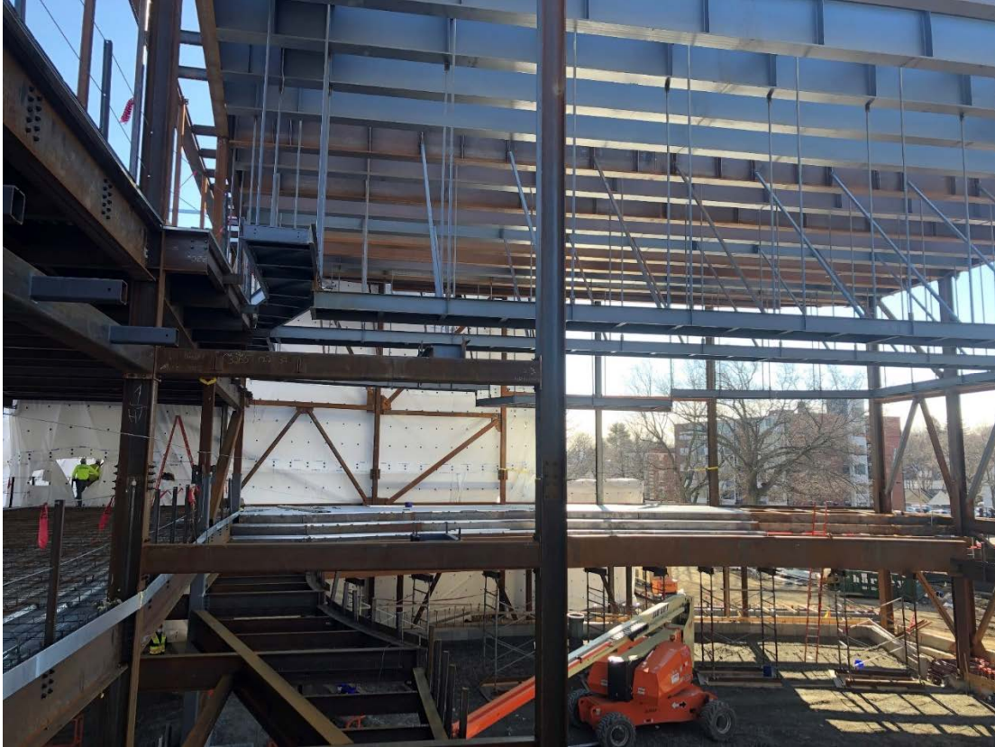
Photograph 5: Interior Auditorium 2

WEEKLY UPDATE – WEEK OF MARCH 22ND, 2021