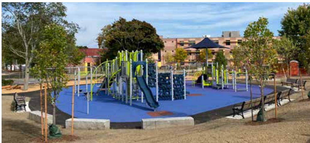
New North Union / Lussiano Playground at Thompson Elementary School

The Department has a number of projects scheduled for 2021 including ADA upgrades at the Hills Hill Field, the Reservoir Phase II Project, a new ADA lift for the Ed Burns Arena, and continued playground upgrades in regards to the 2019 playground audit.