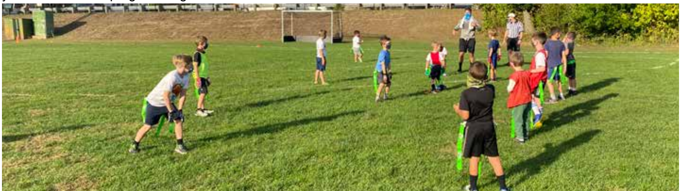
Arlington youth playing viking flag football while complying with COVID-19 safety protocols.

Overall the participation numbers in recreational programs has fluctuated over the last few years with a major drop in FY20 due to the COVID-19 pandemic. Through the pandemic Arlington Recreation was able to offer a base level of programming and was able to keep the Ed Burns Arena open whenever state and local guidelines allowed for youth recreational programming.