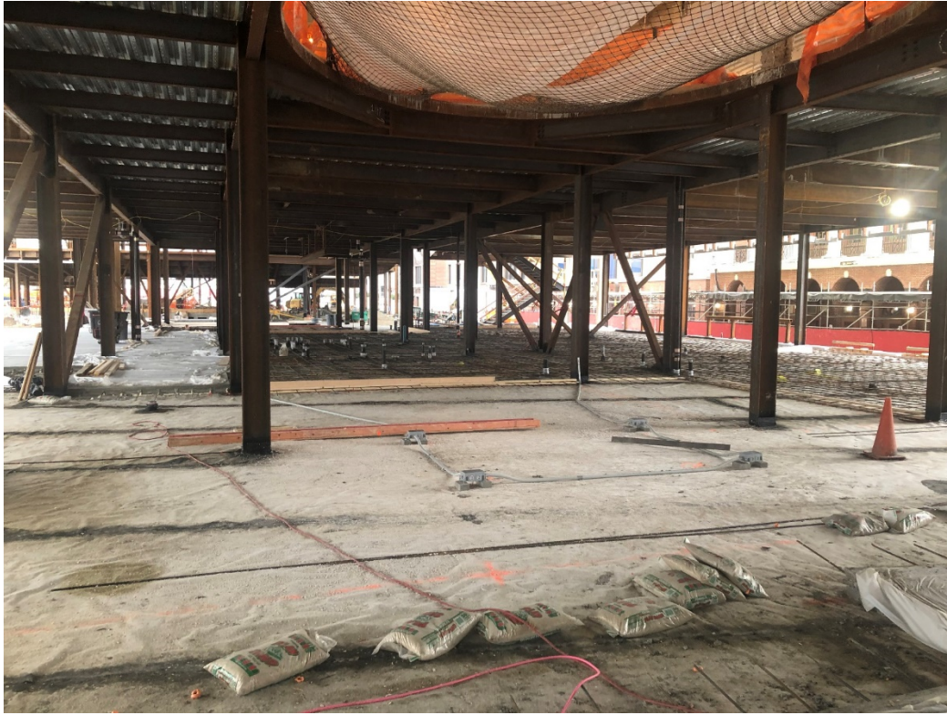
Photograph 3: Building D Slab on Deck