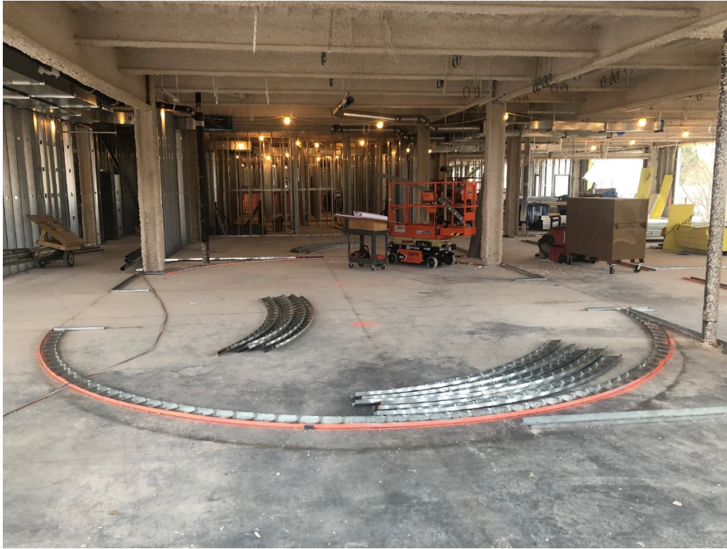
Photograph 5: Building D 4 th locker floor framing