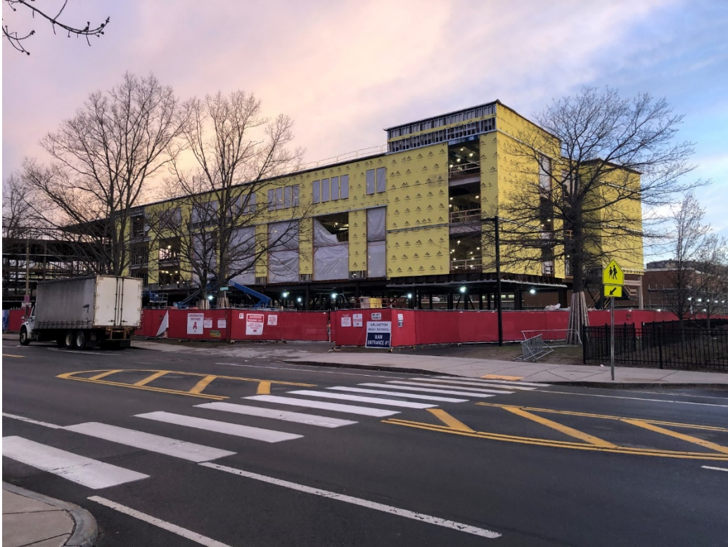
Photograph 1: Phase 1 Progress Photo from Mass Ave