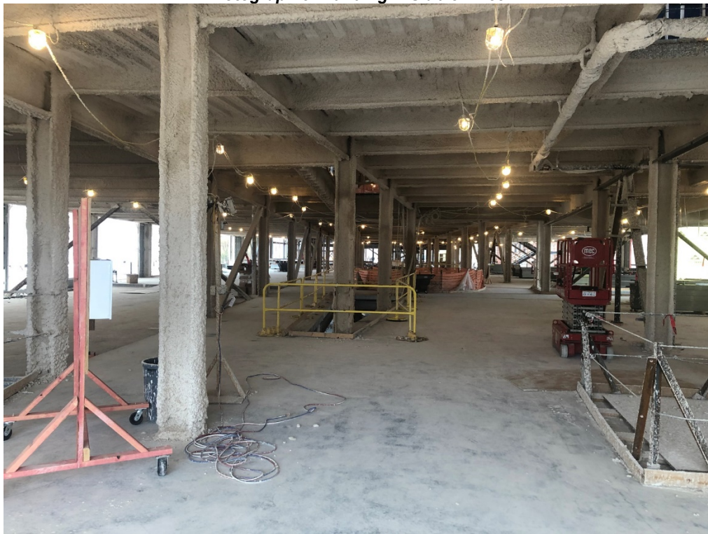
Photograph 4: Building D Level 3 Fireproofing