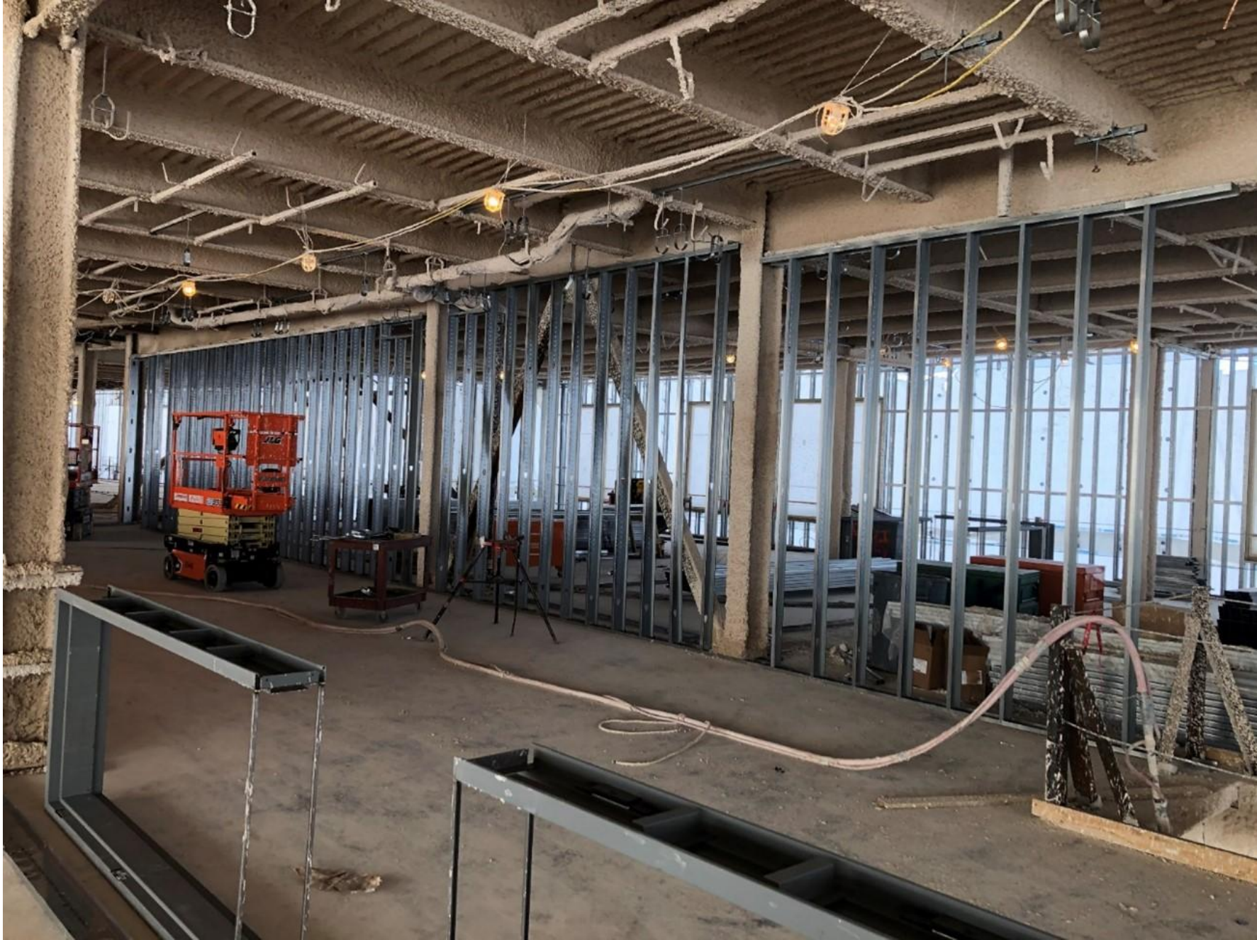
Interior Work April 2021