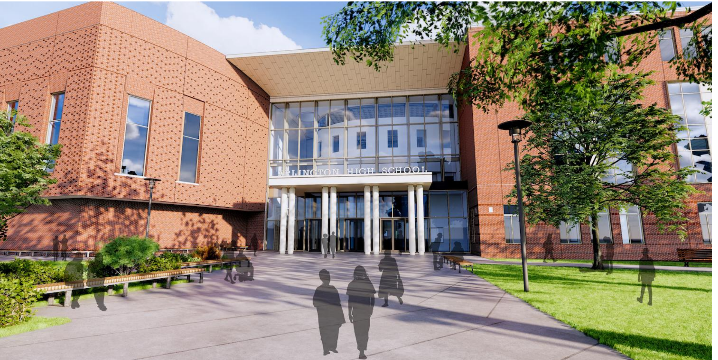
Massachusetts Avenue Entrance