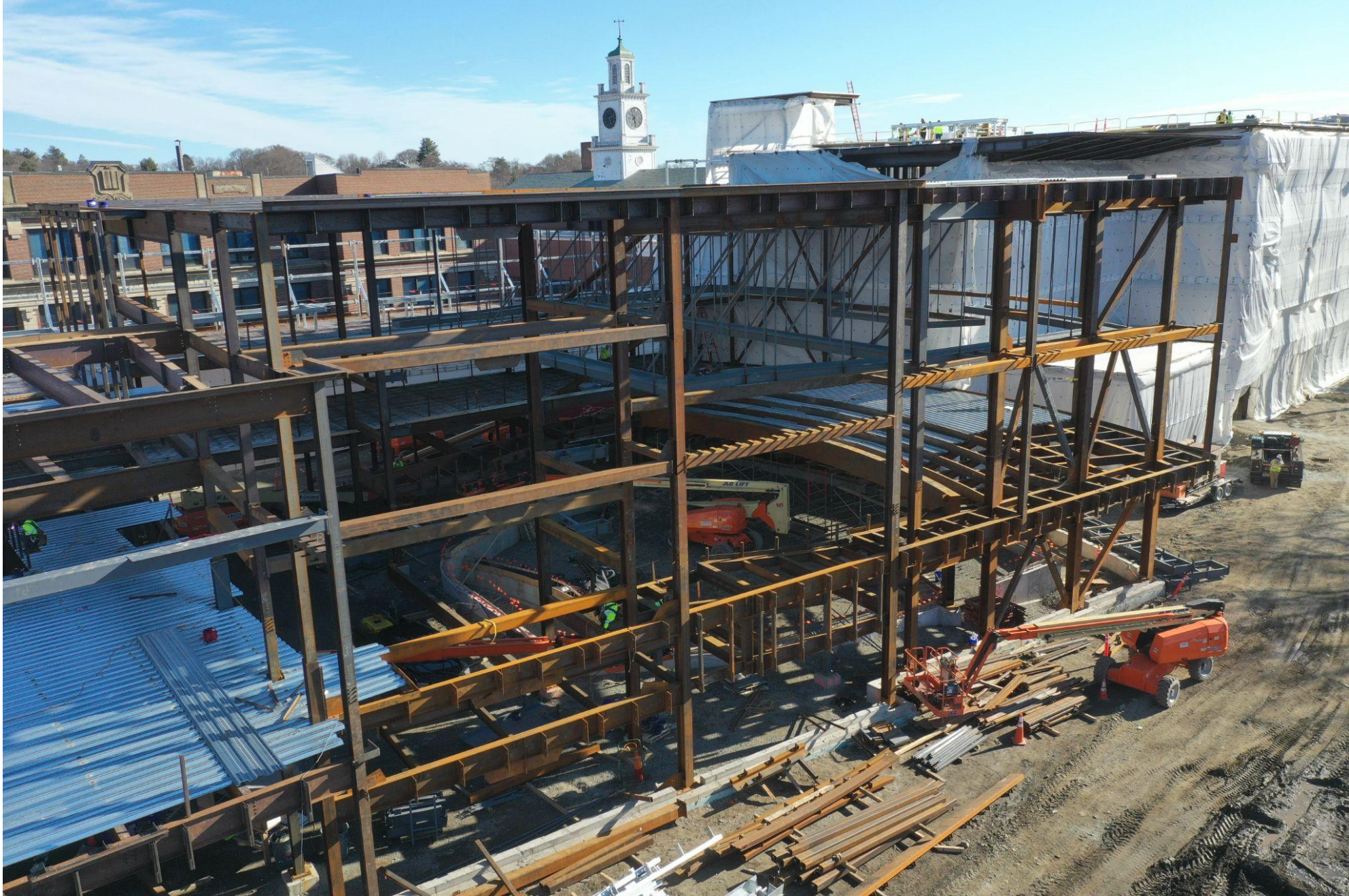
Mass. Ave View of the Performing Arts Wing March 2021