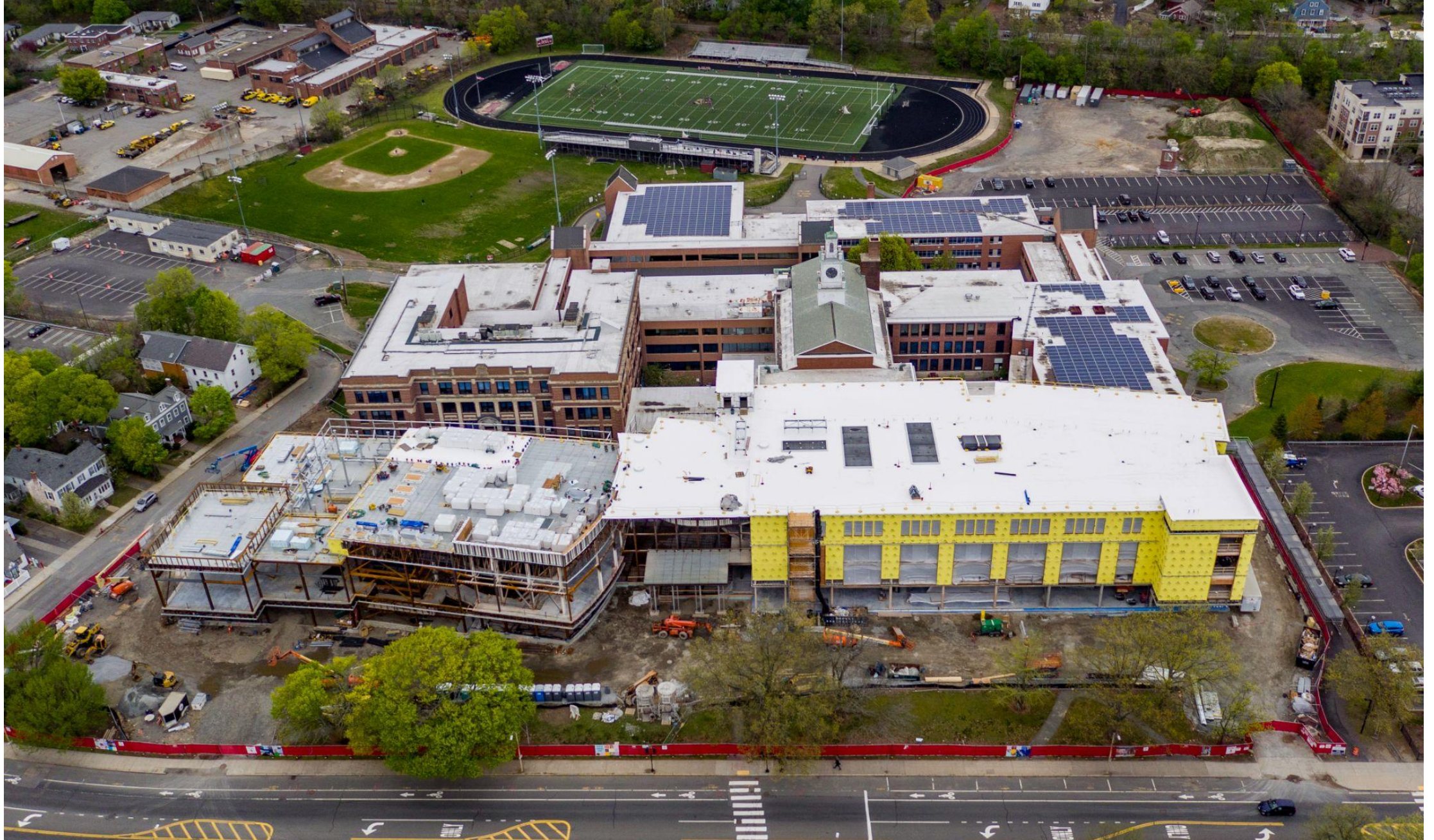
Aerial View May 2021