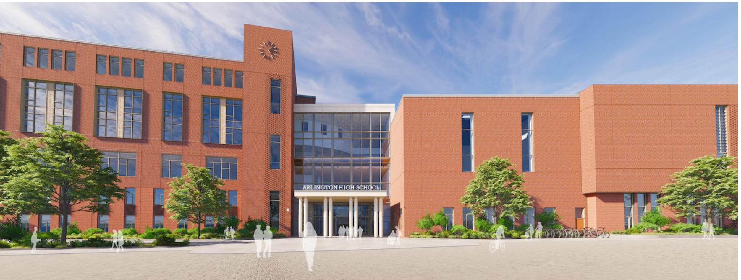
Athletic Field Entrance