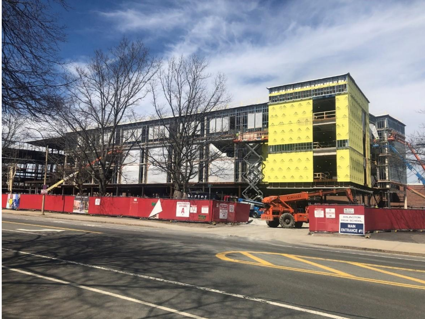
Mass. Ave View of the STEAM Classroom Wing April 2021