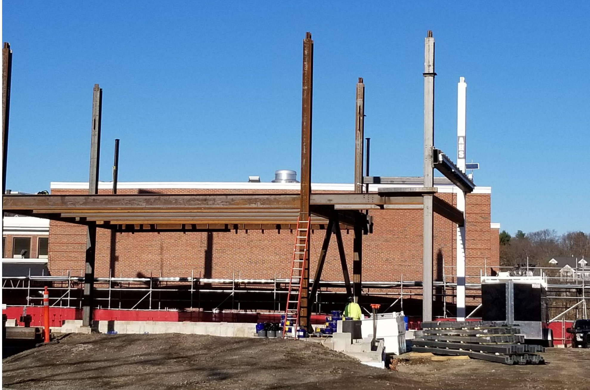
First Steel Raised November 2020