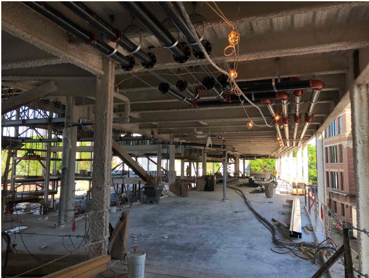
Photograph 6: Building E Level 3 HVAC Mains