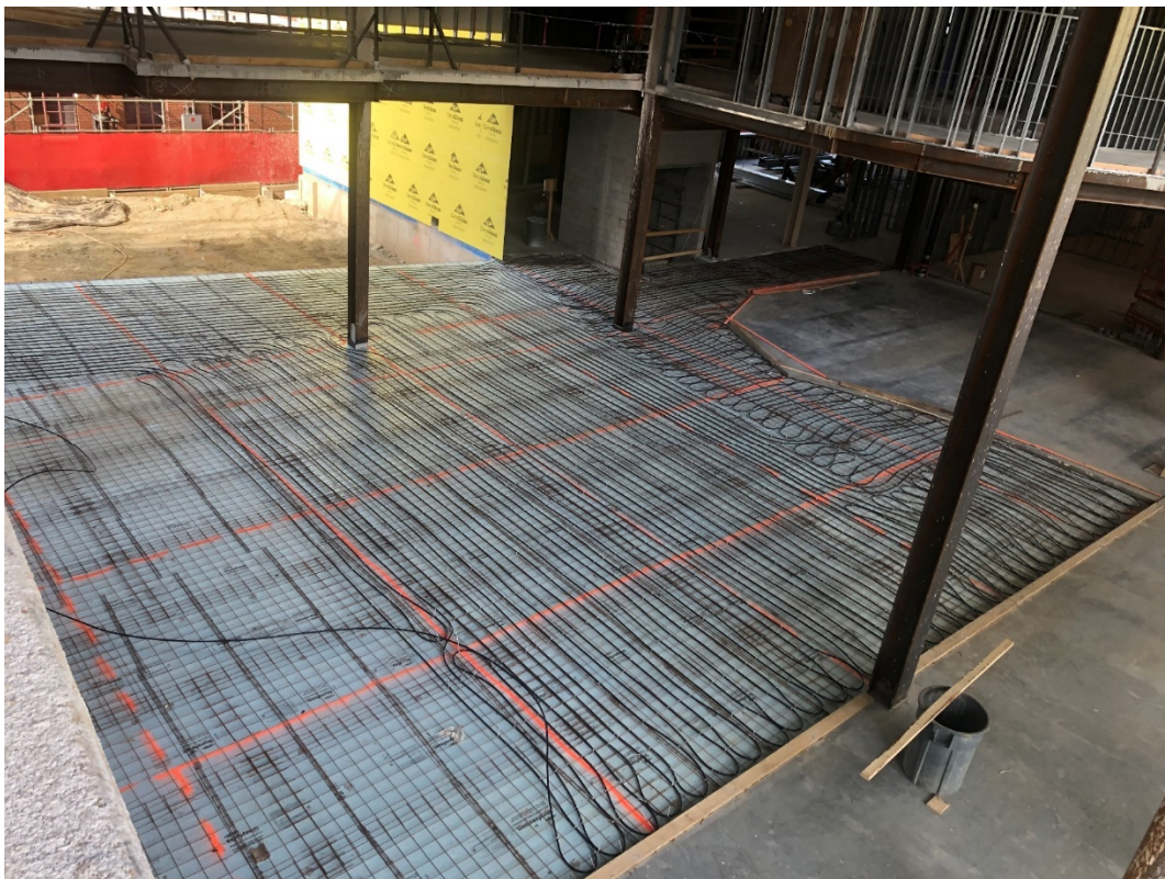
Photograph 4: Building D Radiant Heat