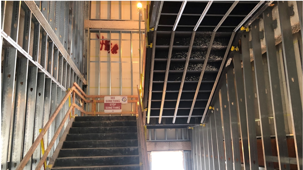
Photograph 5: Building D Stair 3 Interior Framing