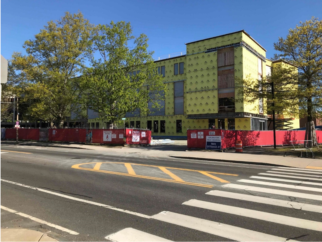
Photograph 1: Phase 1 Progress Photo from Mass Ave