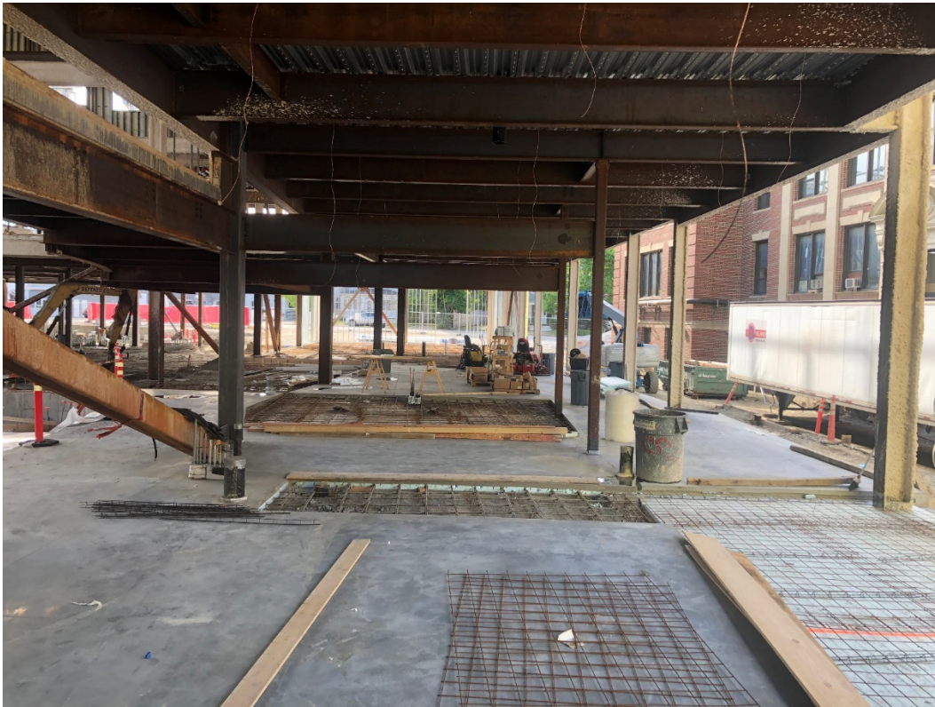
Photograph 3: Progress of Building E Slab on Grade