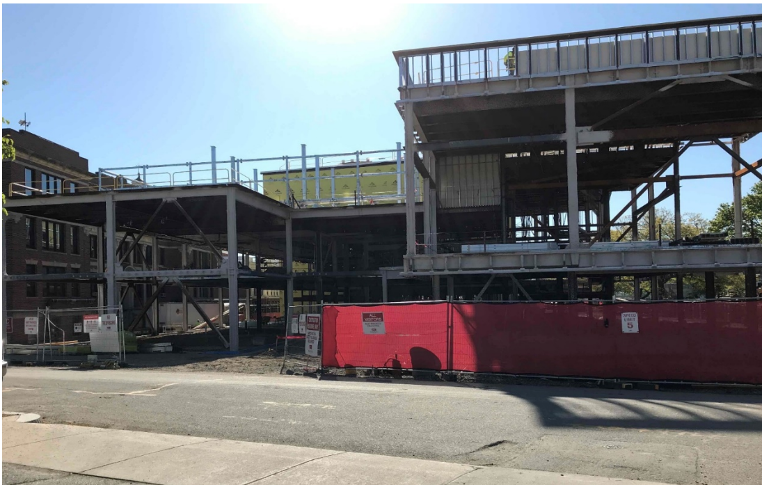
Photograph 2: Phase 1 Progress Photo from Schouler Court