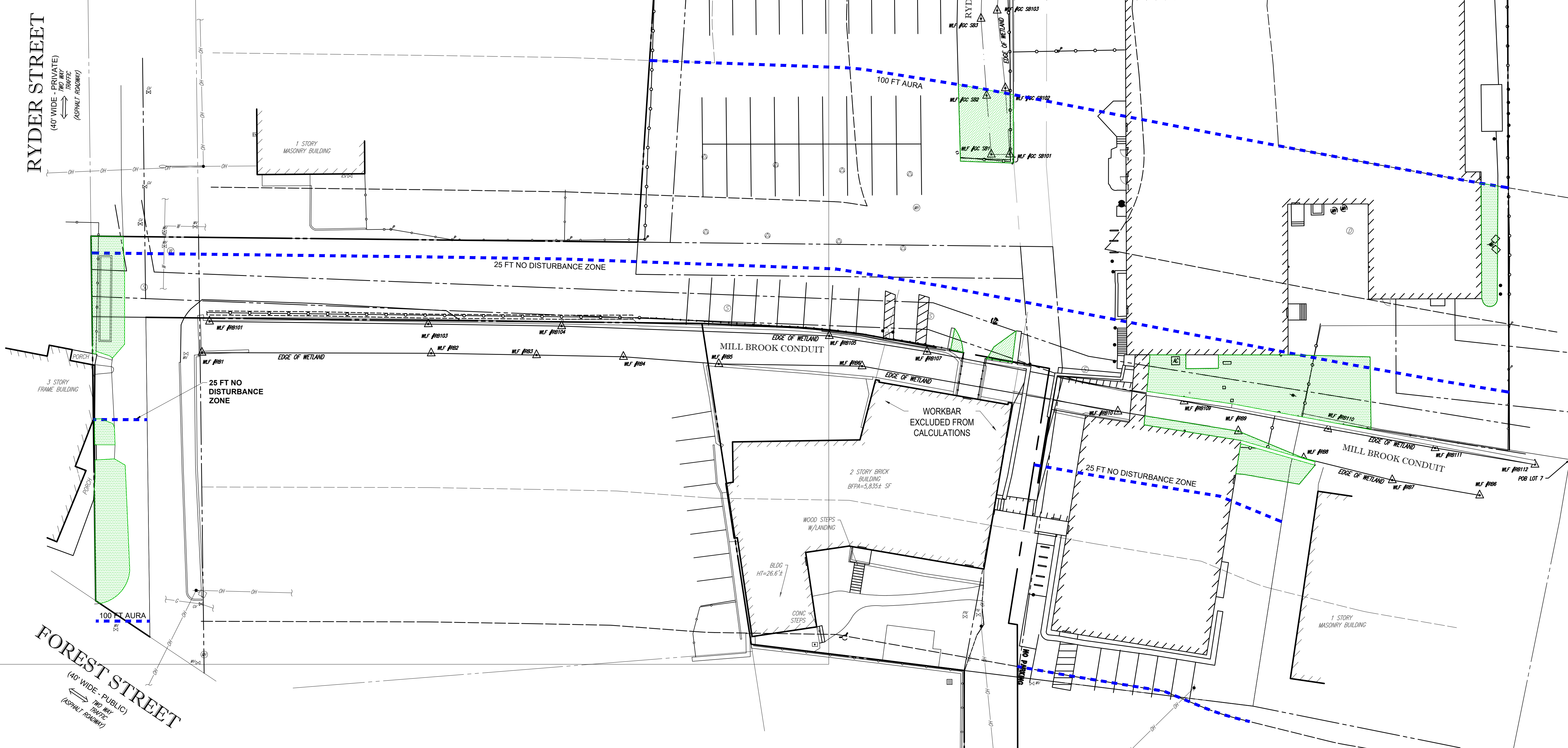
PERVIOUS AREAS WITHIN MILL BROOK AURA