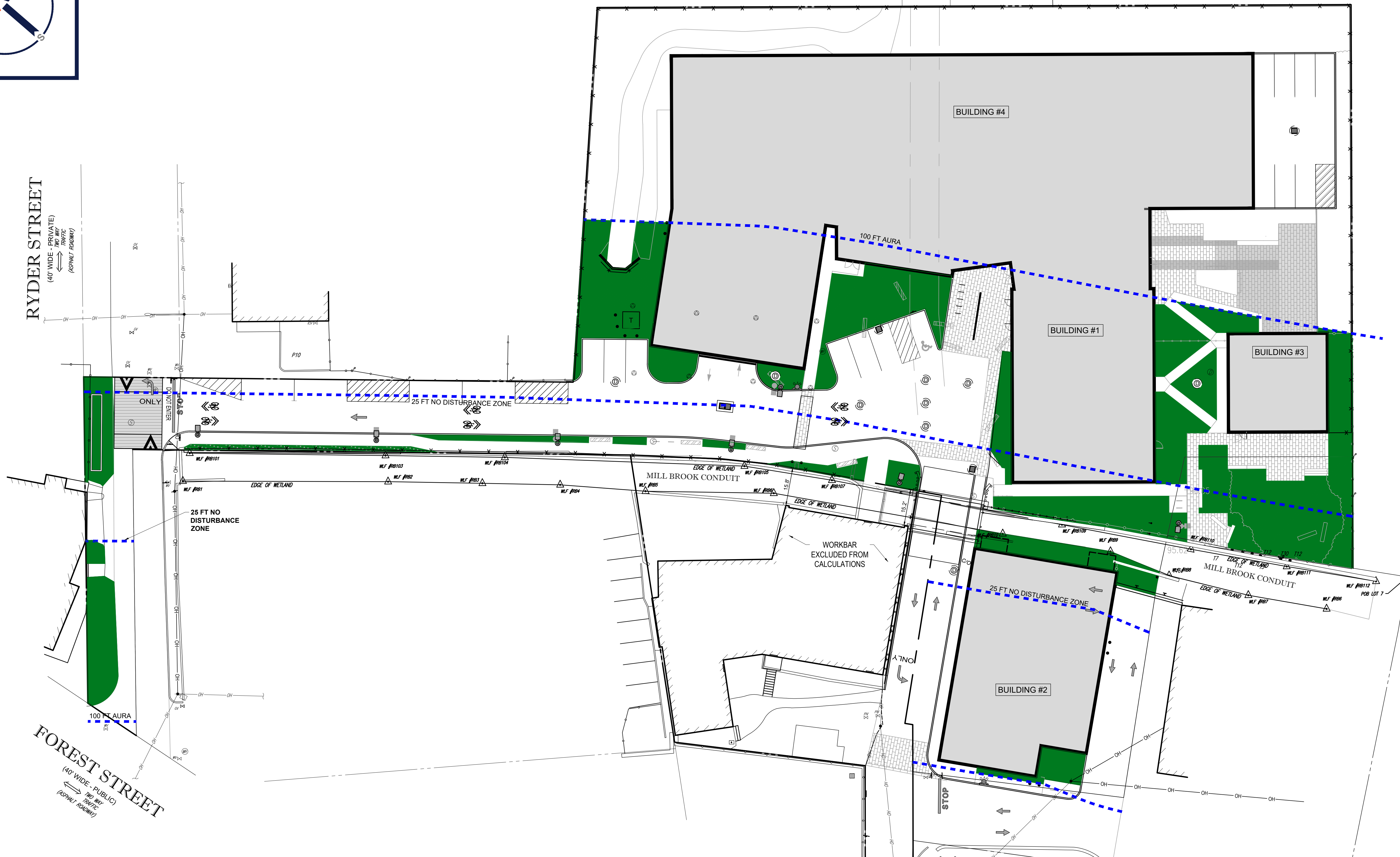
PERVIOUS AREAS WITHIN MILL BROOK AURA