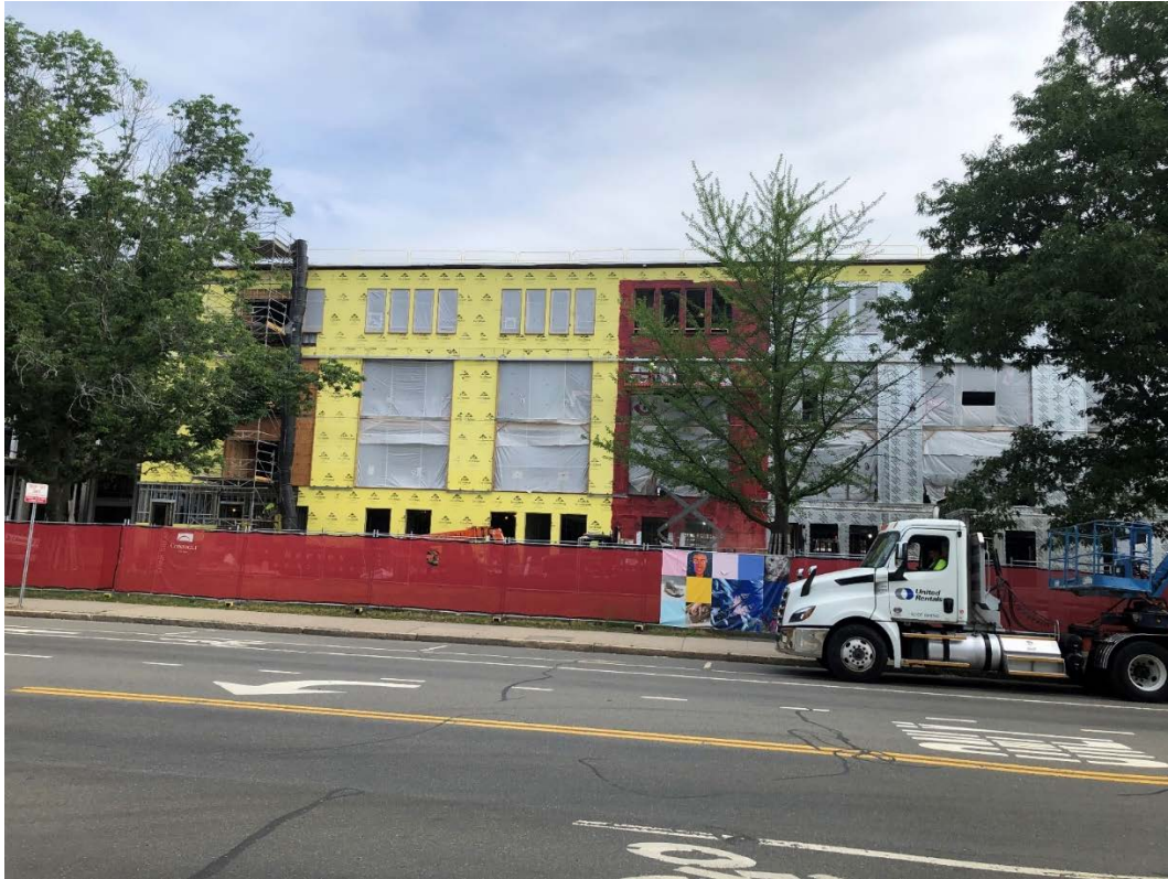
Photograph 3: Phase 1 South Elevation