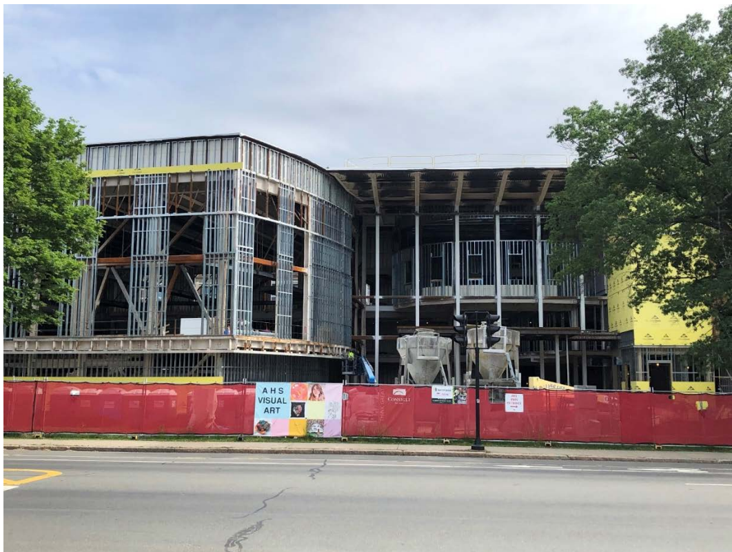
Photograph 4: Phase 1 South Elevation