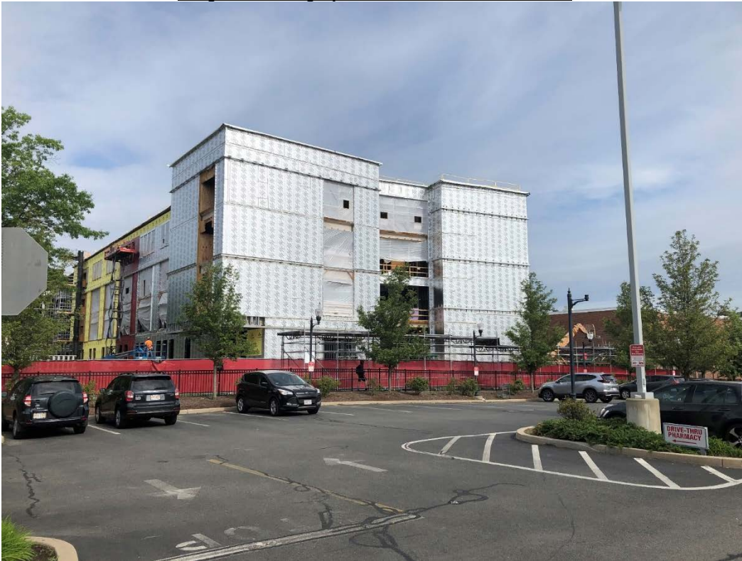
Photograph 1: Phase 1 East Elevation