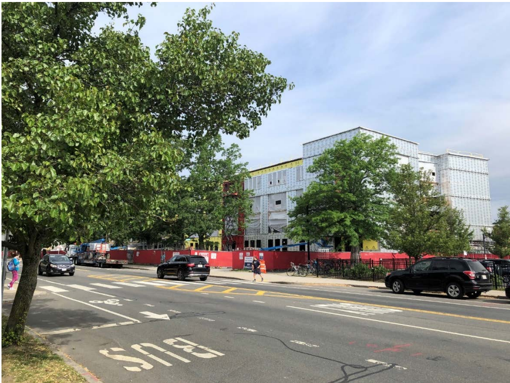
Photograph 2: Phase 1 South Elevation