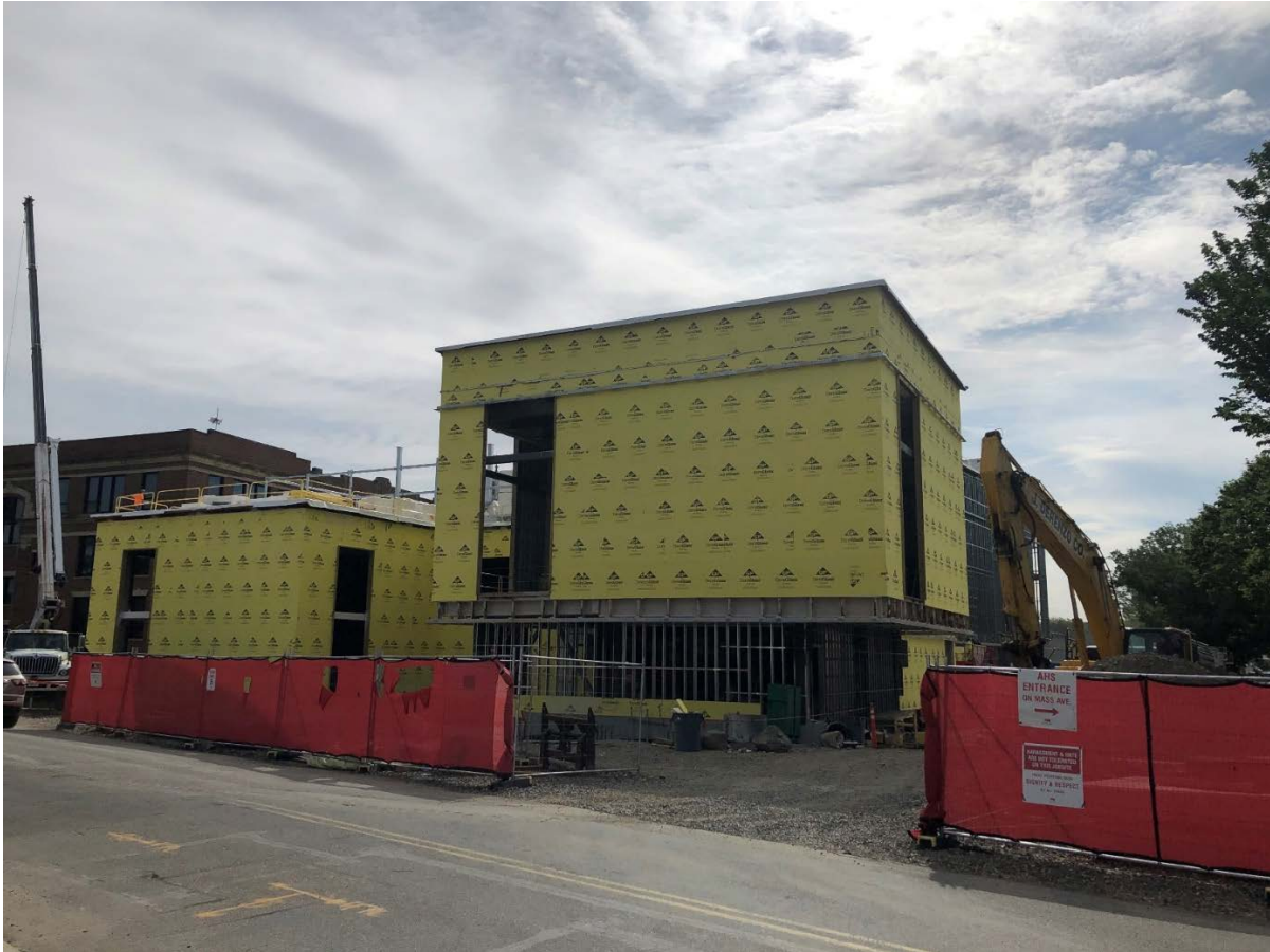
Photograph 5: Phase 1 West Elevation