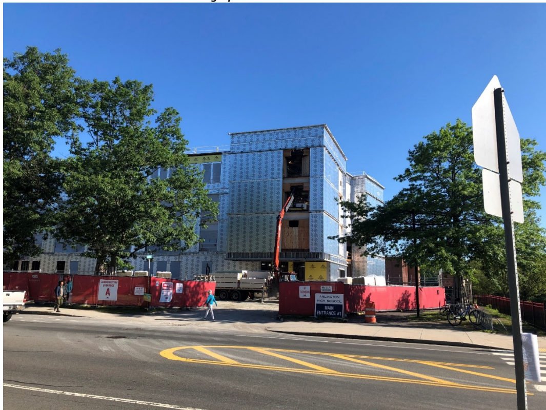
Photograph 2: Phase 1 South Elevation (Mass Ave)