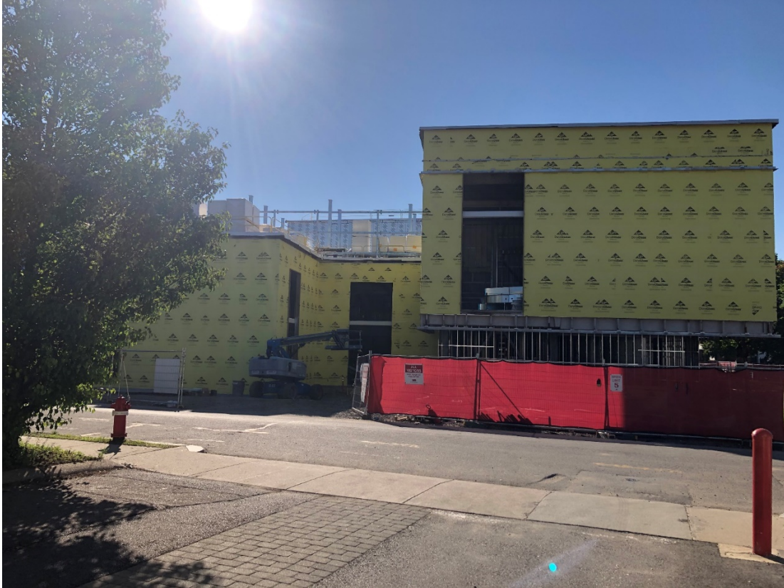
Photograph 5: Phase 1 West Elevation (Schouler Court)