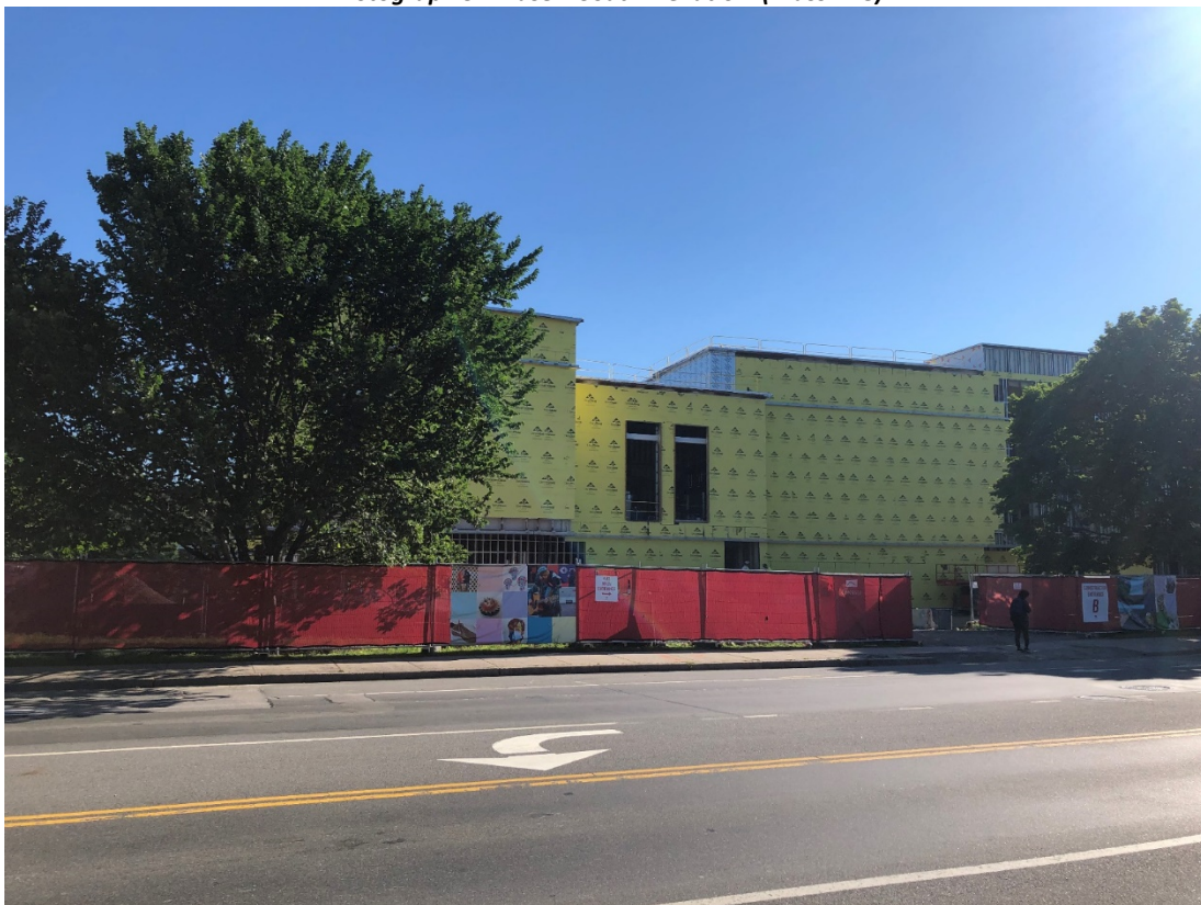
Photograph 4: Phase 1 South Elevation (Mass Ave)