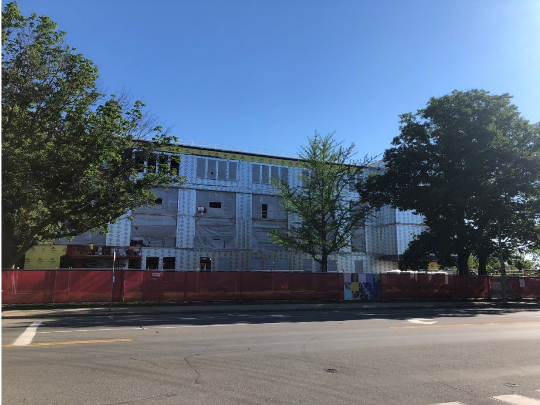
Photograph 3: Phase 1 South Elevation (Mass Ave)