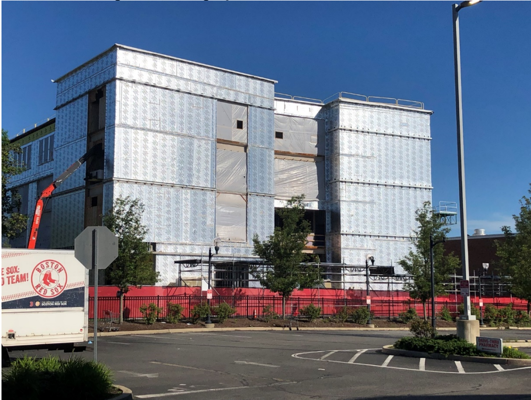
Photograph 1: Phase 1 East Elevation