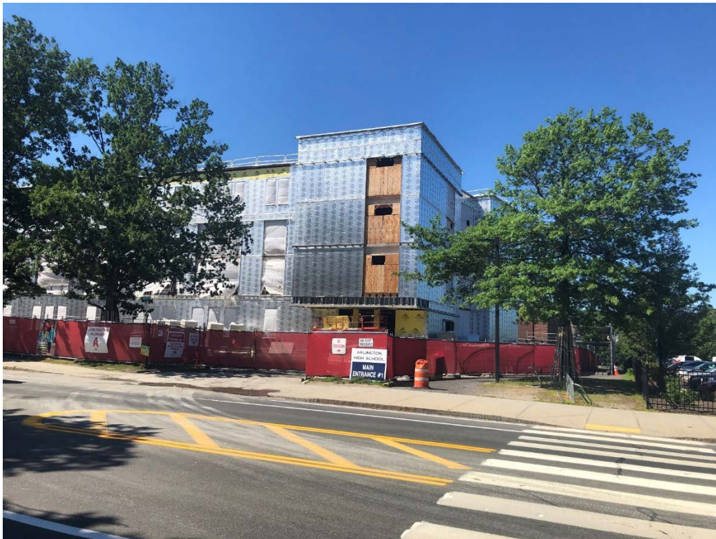
Photograph 2: Phase 1 South Elevation