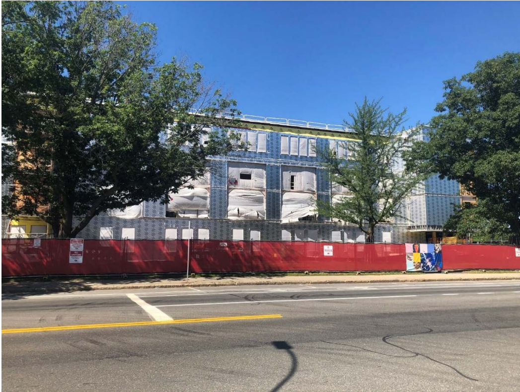
Photograph 3: Phase 1 South Elevation