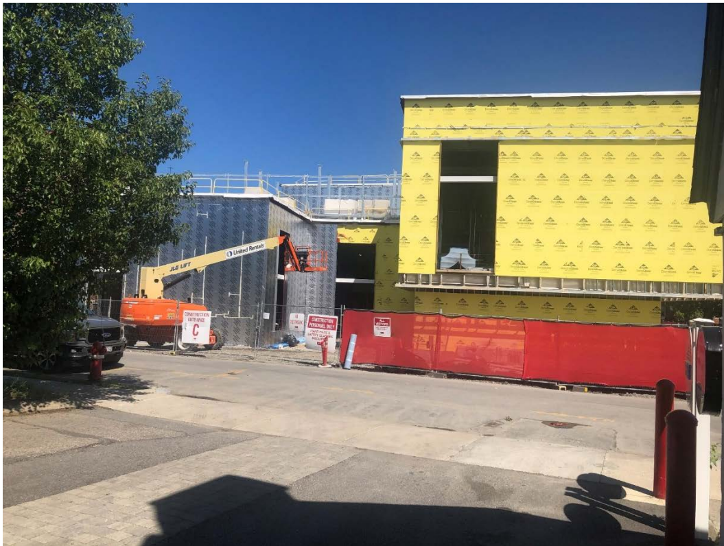
Photograph 6: Phase 1 West Elevation