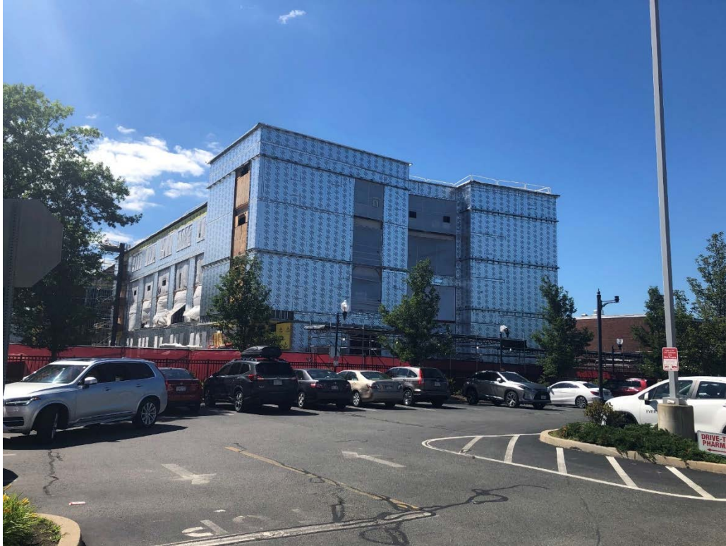
Photograph 1: Phase 1 East Elevation