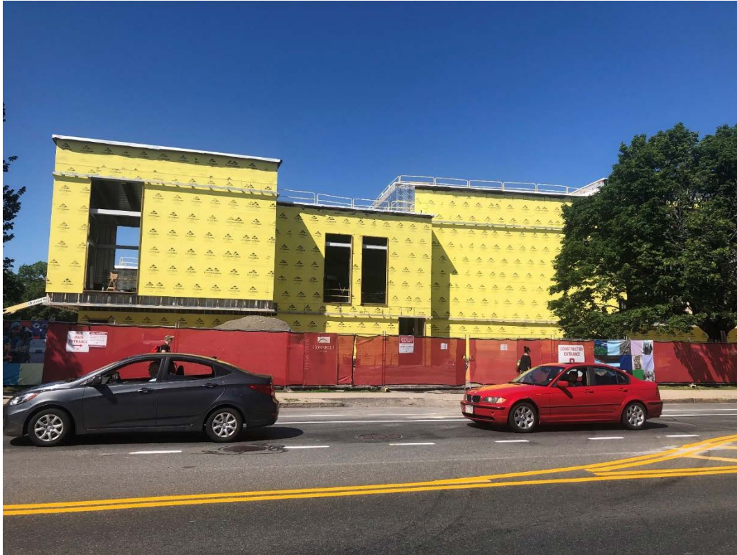
Photograph 5: Phase 1 South Elevation