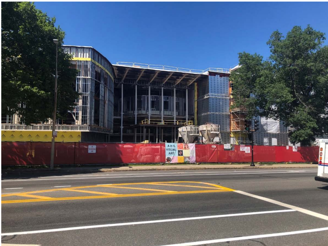
Photograph 4: Phase 1 South Elevation