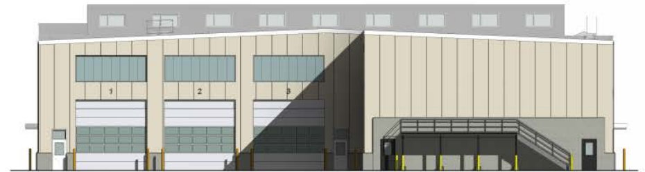
VIEW 2 REAR

1 NORTH EXTERIOR ELEVATION - RENDERED 1/8" = 1'-0" 2/A101